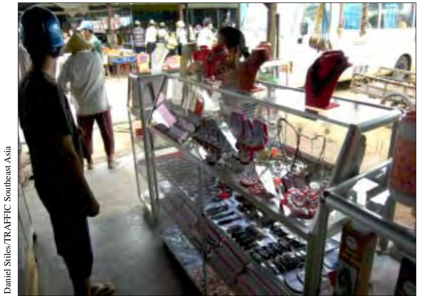
The bekko items in this shop in Ham Ninh village on Phu Quoc were made in Ha Tien. In 2002 TRAFFIC found that they were provided by the father of the former shop owner, who is now retired

foreign Vietnamese tourists, so the bekko was aimed at them. The only other outlet was a small shop near the Ham Ninh jetty, with 154 bekko items.