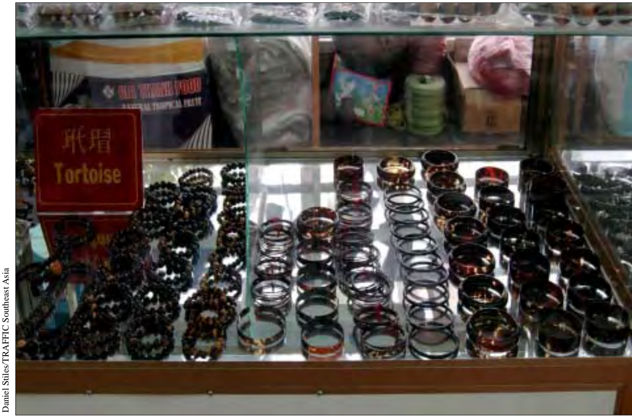
Ha Long City increased the amount of bekko it was selling between 2002 and 2008, probably because of tourist development occurring there.