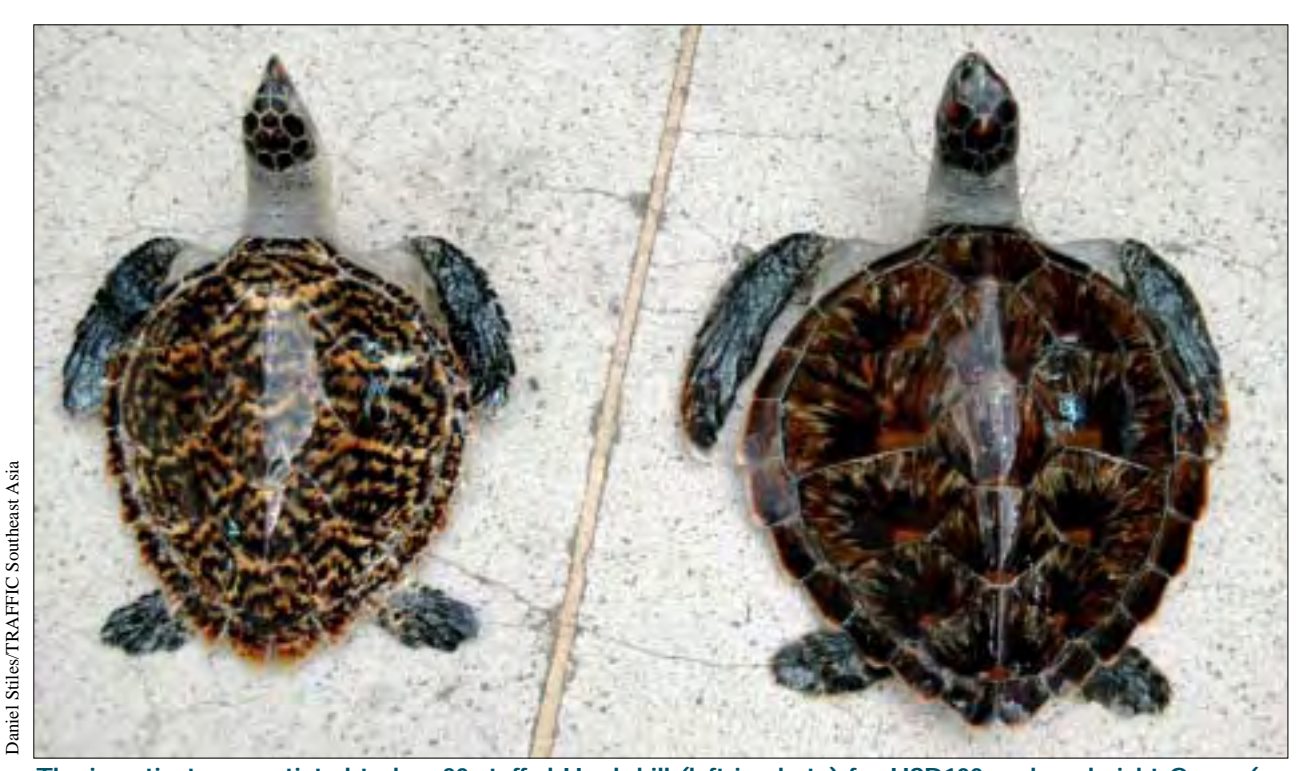
The investigator negotiated to buy 20 stuffed Hawksbill (left in photo) for USD100 each and eight Green (on right) for USD90 each in the Nha Trang market. They were the maximum number the vendors could supply on one day's notice. Although the available Hawksbill were smaller, they are more valuable than the Green

One of the most popular beach resorts in Viet Nam, with many offshore islands and a large fishing community, this small city has long been a centre of marine turtle catching and bekko working. Most of the outlets (10) selling 219 bekko items were found in and around the main market. Most of the stuffed turtles were also found here. The other four shops were located along Tran Phu Street, the beach road,