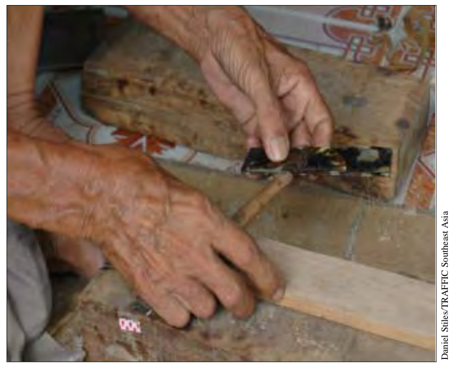
A workshop in Ha Tien supplies all of the bekko sold on Phu Quoc, and dealers come from HCMC and Vung Tau to buy.

The aim of the investigation was to gather as much quantitative data as possible on indicators that reveal the scale and nature of the marine turtle trading system and degree of local demand for marine turtle products. The indicators are (i) prices of whole turtles and raw and worked bekko , (ii)