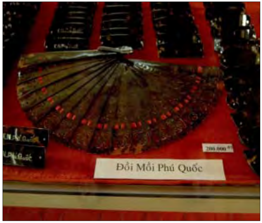
Bekko fans were for sale on Phu Quoc Island for USD93-112, much cheaper than HCMC

This tropical island with about 80 000 inhabitants lies in the far south of Viet Nam very close to Cambodia. The main industry is fishing and as recently as the 1990s marine turtles were commonly caught in nets as by-catch, which engendered a small bekko and stuffed turtle industry. Informants said that marine turtles were very rarely seen or caught today, but shops still sold bekko , obtained from Ha Tien on the mainland not far away. There is a burgeoning tourist industry, with most hotels located near Duong Dong, the main town and port on the island.