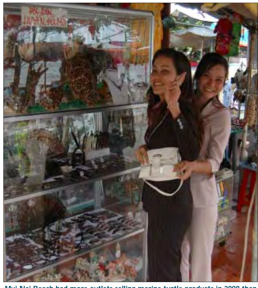
Mui Nai Beach had more outlets selling marine turtle products in 2008 than in 2002. It is popular with Vietnamese tourists