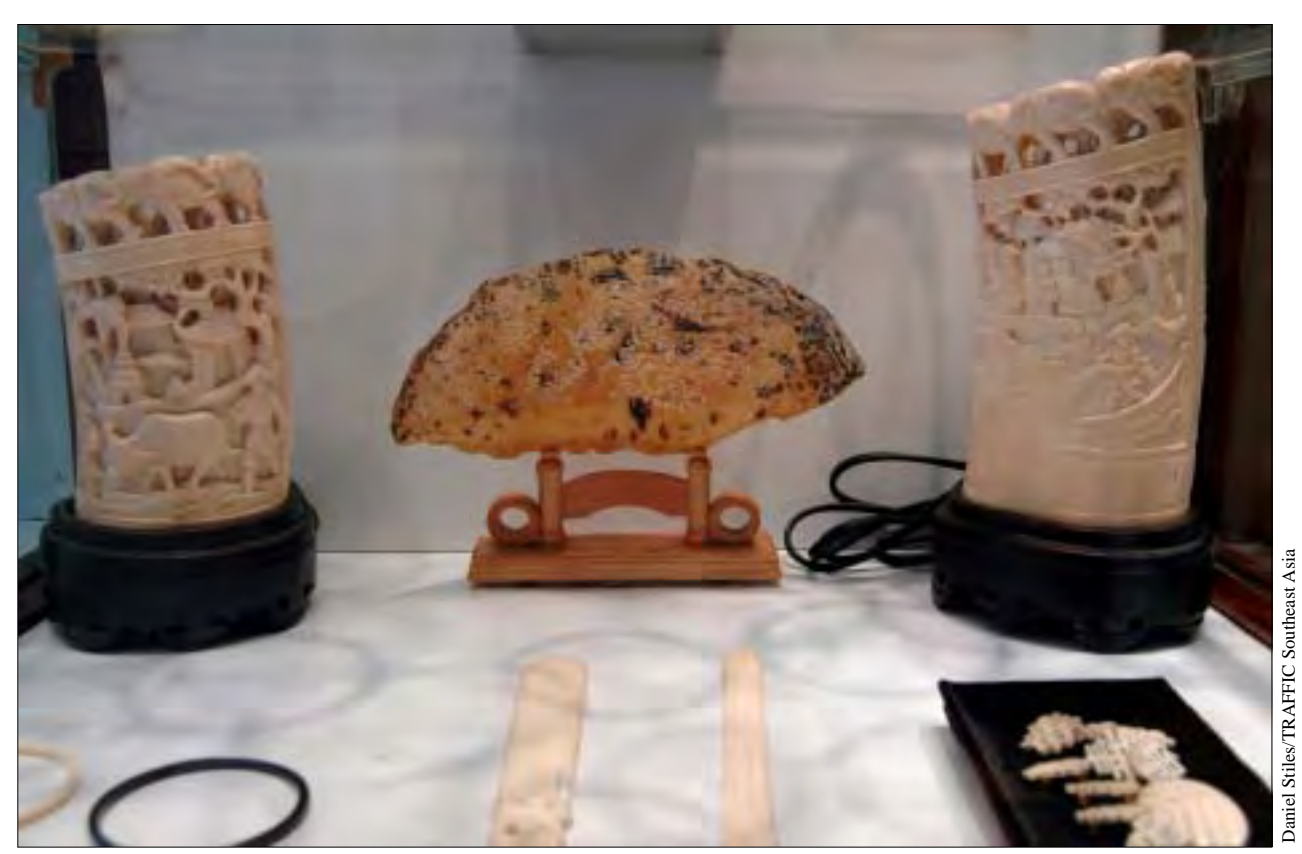
This Hawksbill scute, displayed between two illegal ivory pieces, was for sale in HCMC for USD200

HCMC – One workshop was visited on Le Thanh Ton Street. This workshop employed at least four workers and had sophisticated electrical machinery for shaping and polishing bekko items. The showroom had a wide range of bekko items made in the workshop, including jewellery, hair clips and pins, combs, name seals, fans and spectacle frames were being manufactured during the visits here. The products were high quality and amongst the most expensive seen in Viet Nam. The two other workshops were not visited, although attempts were made, but were said by vendors to be small, home workshops that made mainly hair clips and combs.