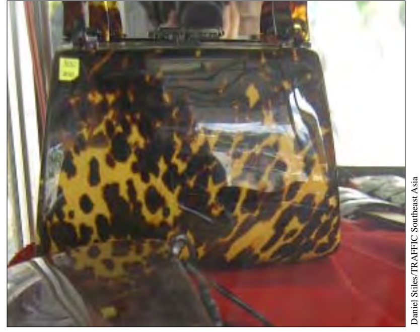
Ladies handbags, made of pure bekko, were priced at USD300 on Phu Quoc Island

They also said that they did not export marine turtle products to other countries and that it was rare for foreigners to come to buy large quantities, though some came to buy small amounts for personal use. They said their bekko production was much smaller than previously and they could barely supply the domestic market demand. would say how much they paid fishermen for whole marine turtles, saying that they rarely bought them now. Only the workshop craftsmen gave a price for scutes, reported above, of USD150/kg.