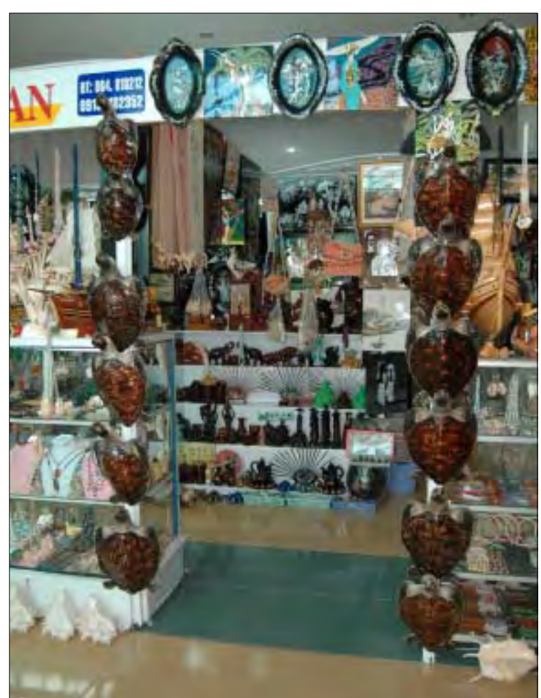
Marine products, including bekko and stuffed marine turtles, were main items in tourist shops in Vung Tau

The largest city in Viet Nam, this commercial and tourism centre attracts many business and tourist visitors, who are the main buyers of marine turtle products. Out of 251 outlets visited (including market stalls), 22 of them carried bekko . The 1938 items seen in these outlets comprised almost exactly one-third (33.2%) of all bekko seen in Viet Nam. HCMC had the most imitation bekko , i.e. pieces made of plastic, and buyers were frequently deceived in markets and department stores that advertised the plastic as real bekko .