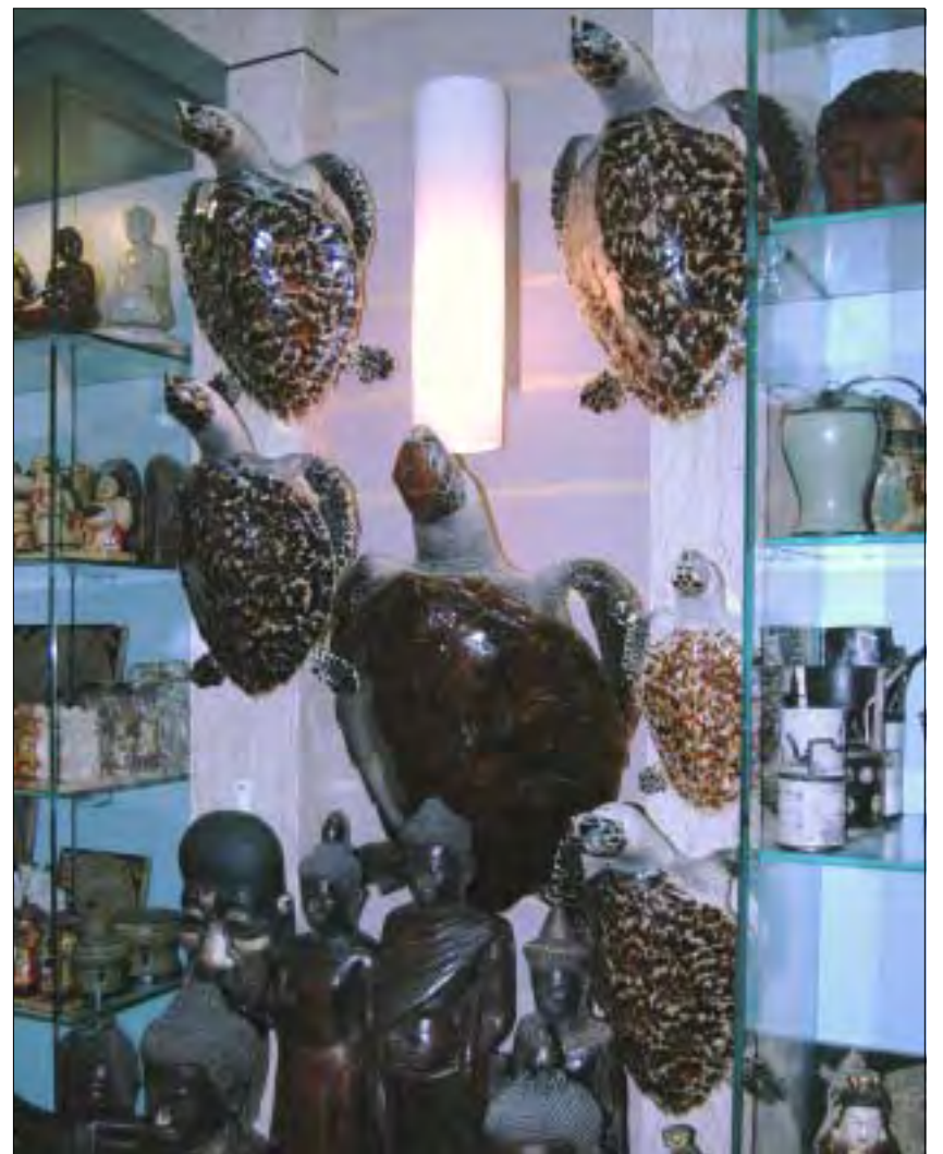
These whole, stuffed marine turtles were for sale in downtown HCMC in an expensive tourist shop

The data were analysed and the counts, types and prices of marine turtle items were broken down for display in tables to allow for standardized comparisons of the indicators between place and time. The retail prices used in this report are the asking prices, though a discount of 20-30% could be obtained with bargaining. Some shops gave prices in Vietnamese dong (VND) and some in US dollars (USD). Where VND were given, the exchange rate used is VND16 100 = USD1 (May 2008), though it varied slightly during the survey period.