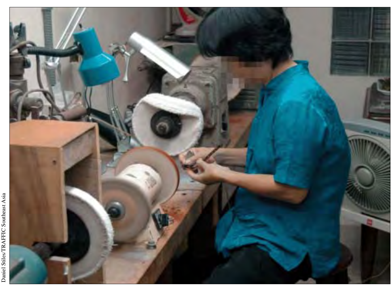
A bekko workshop was found in downtown HCMC in plain view from the street. The lady is making spectacle frames. They do not fear a problem from the authorities for this illegal activity

Most of the 217 spectacle frames seen were made entirely of bekko or bekko mixed with plastic, but 58 of them were bekko on the top half and metal on the frame bottom.