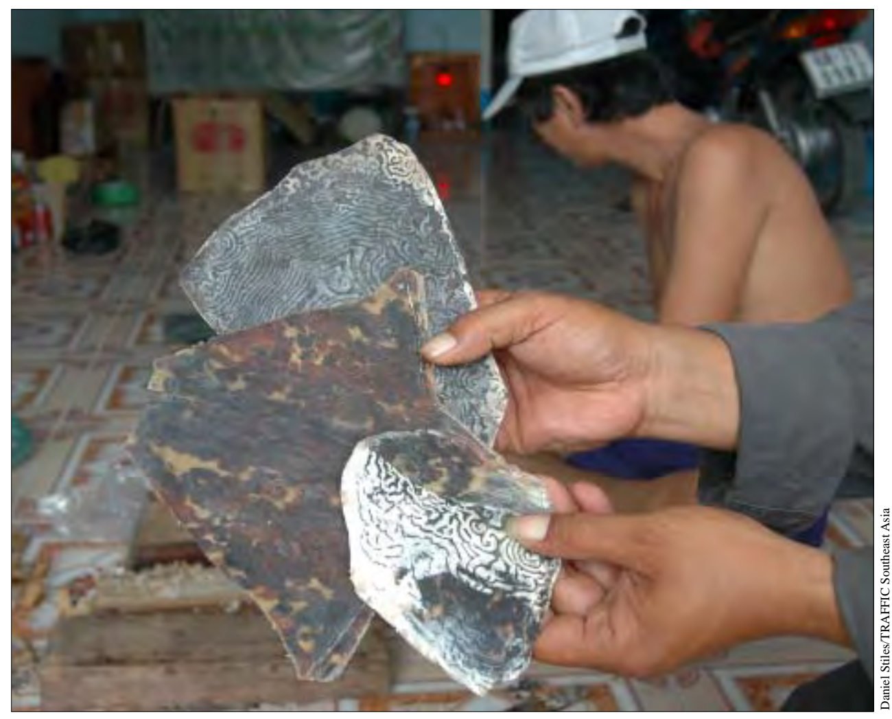
These scutes were purchased by a Ha Tien workshop for USD150/kg from fishermen. Most originate in Indonesia and Malaysia as Vietnamese marine turtle stocks are depleted

Government Decree 48/2002/ND-CP – Prior to 22 April 2002 marine turtles could legally be exploited commercially in Viet Nam. Up to 30 March 2006 the Hawksbill, Green and Leatherback Turtles were listed under Group I, prohibiting their use and exploitation in the wild. Under this category, any special non-commercial use and exploitation must be proposed by the Minister of Agriculture and Rural Development and approved by the Prime Minister on a case-by-case basis. The Olive Ridley Turtle and Loggerhead Turtle were initially listed in Group I, but were later removed and placed in Group II, by Official Letter No. 3399. The five marine turtle species were removed from this list of endangered species by Government Decree 32/2006/ND-CP of 30 March 2006 because they are not forest species.