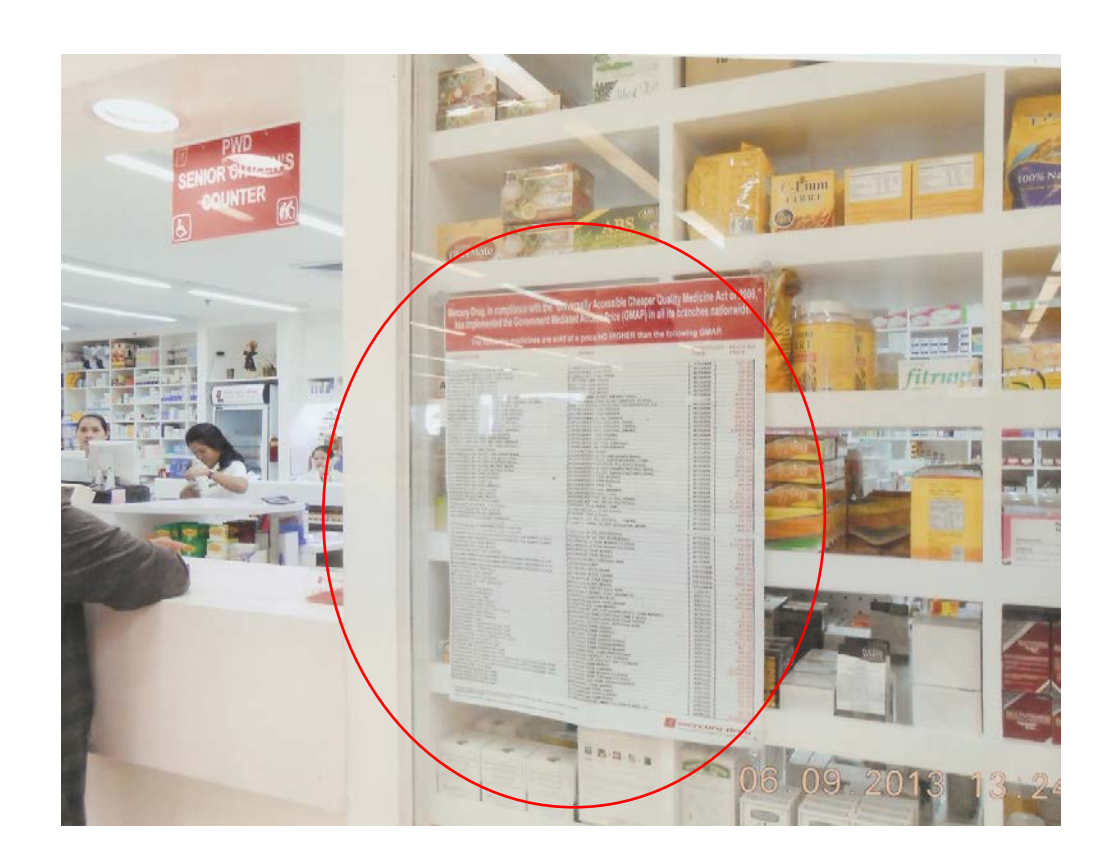
Annex 3: Sample Photos of GMAP Posters in Selected Drugstores