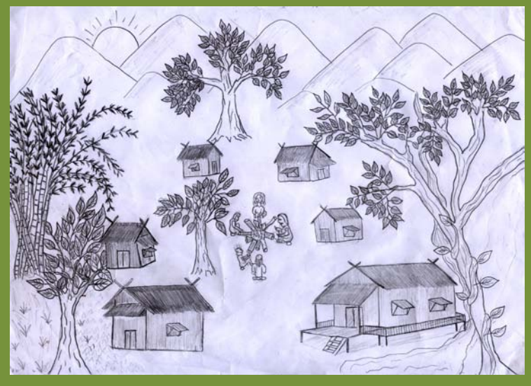
Illustration by Kham Hseng