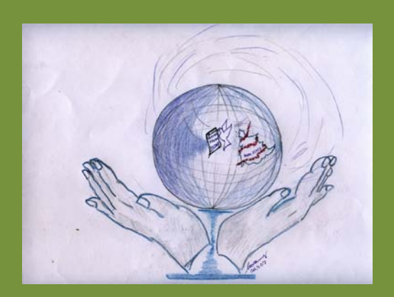
Illustration by Lao Perng