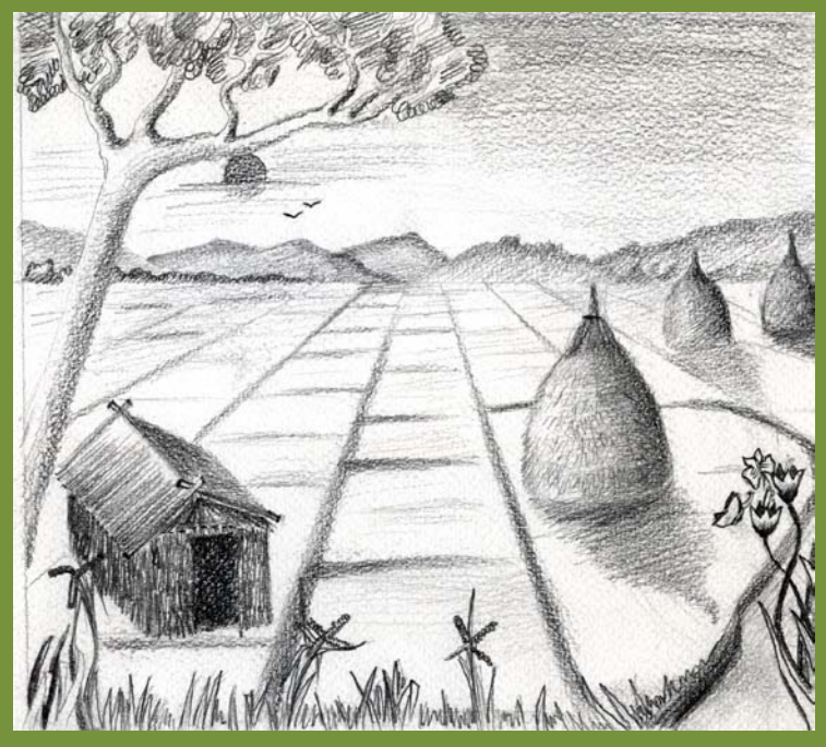
Illustration by Hsai Lern