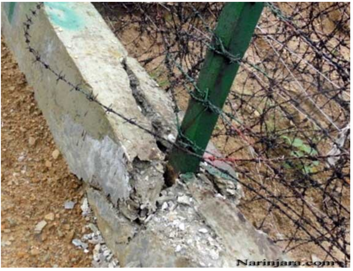
Border fence destroyed at the Bangladeshi side