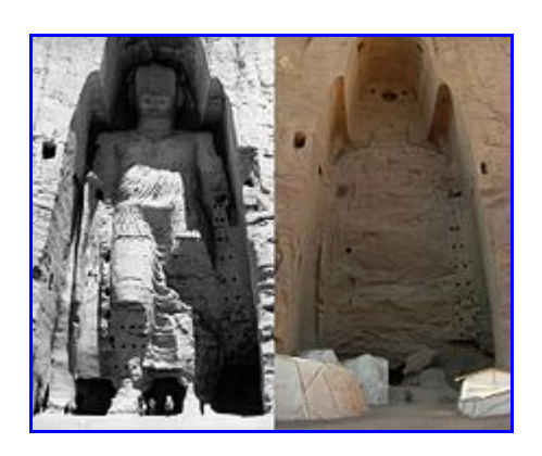
Taller Buddha in 1963 and in 2008 after destruction