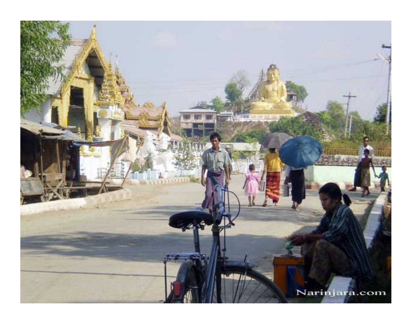
A Scene of an Arakanese Town