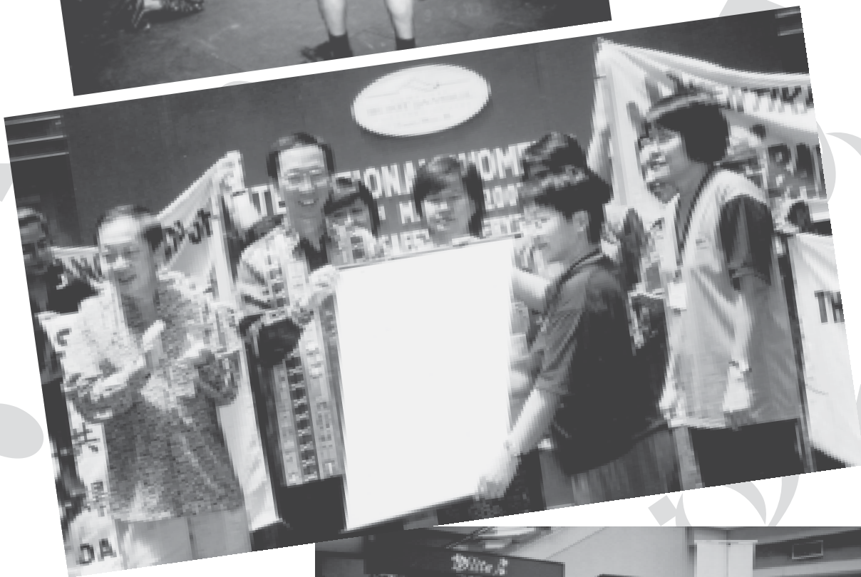
Presenting the IWD memorandum to the Penang Chief Minister