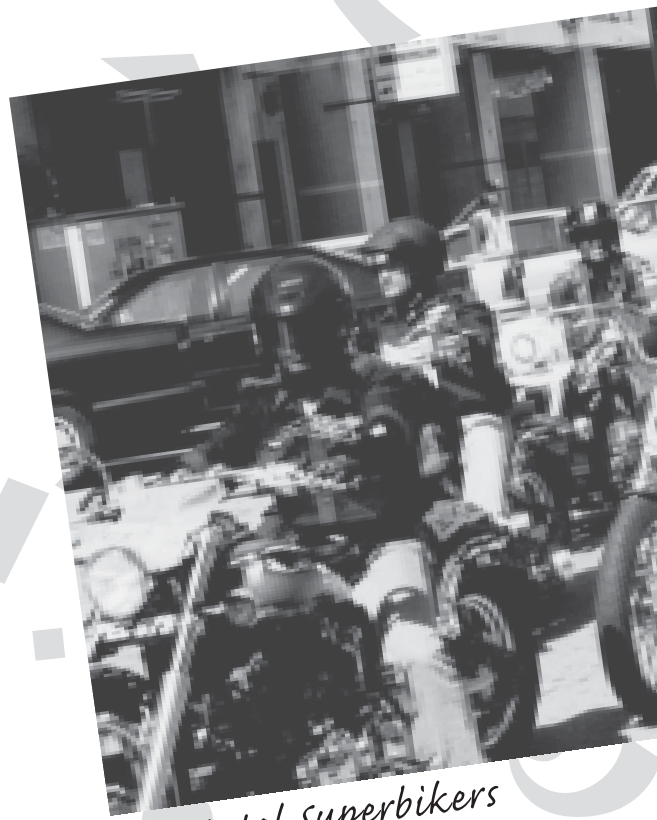
The Intel superbikers