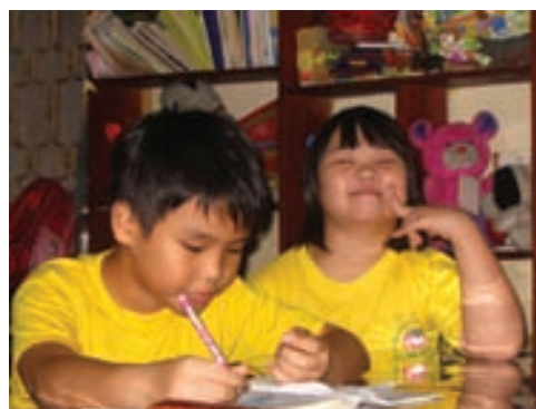
Children at Educational Center District 4

The MAS program was developed throughout 2008. To get input from local organisations on the management areas they felt they required the most support, we held a needs assessment workshop on the 26th of September. More than 40 people attended this workshop and based on their input and our own research we were able to categorize the main management areas for support under the MAS Program. In 2009 we will pilot the MAS Program and incorporate it fully into our core activities.