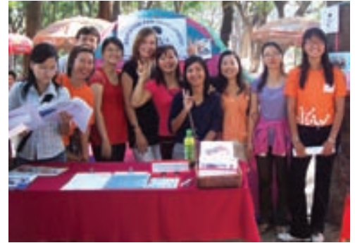
EFD staff and volunteers