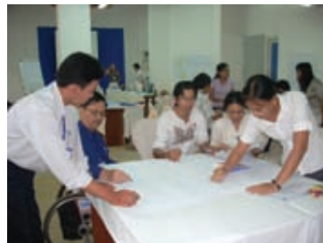
An in-class activity at SDTC

In 2008 EFD focused on supporting the Social Development Training Center (SDTC). This training center has been established by EFD in partnership with Ton Duc Thang University (TDT) in 2004 and has received financial and organisational support by EFD ever since. This year EFD has focused on providing technical support to the staff of SDTC in organizing scheduled and tailor made training courses. SDTC staff has been trained by EFD on topics such as communication, evaluating training courses, facilitation, public speaking, and course management. EFD also participated in board meetings of SDTC in which strategic input was provided.