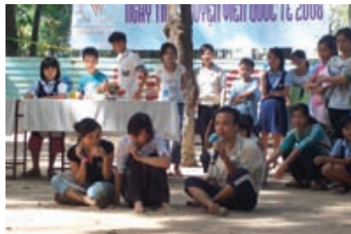
An activity during IVD 2008

The event was a huge success with volunteers, local and international organisations, the general public and local media all showing up to be part of the day. It was a day of celebration and fun activities giving volunteers an opportunity to come together and share their experiences and for people interested in volunteering to become aware of volunteer opportunities in Vietnam.