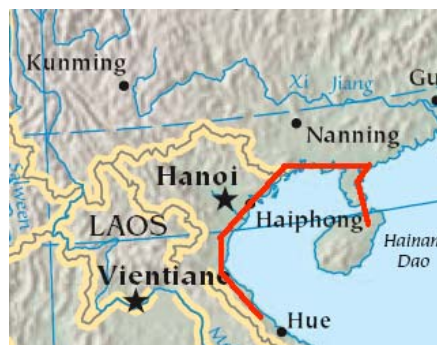
Map 3: The Beibu Rim economic belt 34

Meanwhile, the Beibu Gulf economic belt, circled by the northeastern coast of Vietnam, southern Guangxi coast's Leizhou Peninsula and Hainan Island of China with its 1,595-kilometres coast and an area of over 26,000 square kilometres, is one of the largest gulfs in Southeast Asia and the world. 33 Currently, it embraces China's Guangxi, Guangdong, Hainan (and even extends to Hong Kong and Macao), and 10 coastal localities of Vietnam. It is advantageous for the construction, expansion and operation of many sea ports such as Qinzhou and Fangcheng ports in Guangxi, China, and Cailan and Haiphong ports in Vietnam.