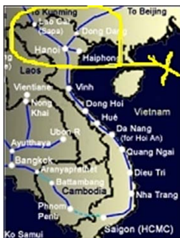
Map 5: Vietnam as a bridgehead, linking China-Vietnam's two economic corridors, one belt with China-ASEAN's One Axis, Two Wings. 67

1,000 projects in Vietnam with the total capital of US$13 billion, accounting for 20% of foreign investment in Vietnam. Vietnam also has more than 120 projects in the ASEAN countries with a total capital of one billion USD. In the same year, Vietnam-China's trade turnover reached US$10.4 billion, a 20% growth from 2005. According to Xinhua News, in the first quarter of 2008, two-way trade turnover between Guangxi and ASEAN reached US$1.07 billion, 2.3 times more than the same period last year, making it the highest rate ever. Its trade turnover with Vietnam is US$890 million, accounting for more than 90% of Guangxi-ASEAN trade turnover. 66 As Guangxi and Yunnan's important trading partners, Vietnam can play a big role in furthering these two provinces' economic relations with other ASEAN countries. In the near future, once the TCOEB and its "two highways, two railways" component are built and put into use, it will reduce the transport line and time remarkably, facilitating significantly to improve China-Vietnam as well as China-ASEAN economic cooperation into a new height.