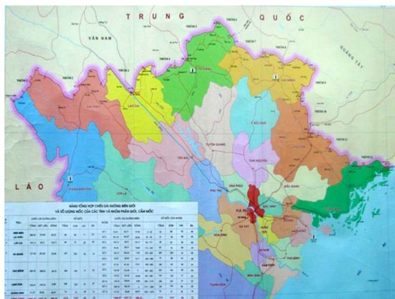
Map 1: Sino-Viet land border after demarcation 19

momentum to push up all-round cooperation within the 16-golden-word framework. The settlement of border issues between China and Vietnam is, therefore, a significant and historic event of their bilateral relationship, and also a contributing factor to regional peace and stability. More importantly, as Ramses Amer has pointed out, the settlement of both land and maritime disputes between Vietnam and China contribute positively to the two countries' capacity to safeguard and exercise their sovereignty in the border region, particularly Vietnam. 18