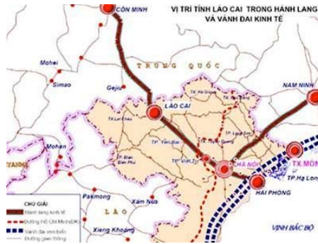
Map 2: Two economic corridors 32

Meanwhile, the Beibu Gulf economic belt, circled by the northeastern coast of Vietnam, southern Guangxi coast's Leizhou Peninsula and Hainan Island of China with its 1,595-kilometres coast and an area of over 26,000 square kilometres, is one of the largest gulfs in Southeast Asia and the world. 33 Currently, it embraces China's Guangxi, Guangdong, Hainan (and even extends to Hong Kong and Macao), and 10 coastal localities of Vietnam. It is advantageous for the construction, expansion and operation of many sea ports such as Qinzhou and Fangcheng ports in Guangxi, China, and Cailan and Haiphong ports in Vietnam.