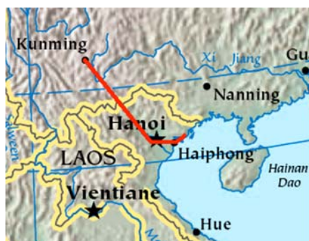
Map 4: The Kunming-Laocai-Hanoi-Haiphong corridor, the shortest route to the sea from China's southwestern region 37

Nanning from Hanoi, the capital of Vietnam, by air and only six hours by bus. The railroad from Kunming, the capital of Yunnan, to Haiphong port in Vietnam via Lao Cai, is only 854 kilometres while the shortest domestic railway from Kunming to Guangxi's Fangcheng port is more than 1,800 kilometres. 36 The Kunming-Laocai-Hanoi-Haiphong route is also the shortest one for the transportation of imported and exported goods from Yunnan to Vietnam and to a third country. Due to Chinese security concerns, the Hanoi-Kunming flight currently still has to fly over Nanning. If China allows a direct flight in the future, the travel time can be shortened to only an hour.