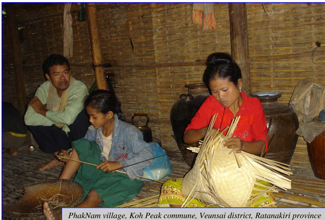
PhakNam village, Koh Peak commune, Veunsai district, Ratanakiri province

In some villages, communities are engaging in processes aiming to re-negotiate respect between elders and youth. Organisations such as HA and NTFP/IYDP