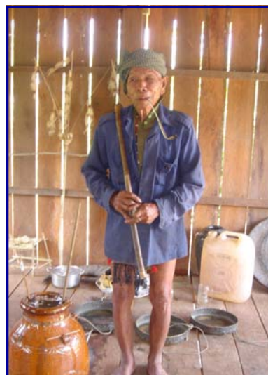
Traditional elder in Ratanakiri province

have piloted work on building youth networks, sending students back into communities to listen to elders and value roots, promoting youth participation in ceremonies, writing new songs about community history, land and culture, and supporting drama and music groups and cultural centres. These activities aimed at bridging the widening gap between elders and youth aim to revitalise cultural pride and heritage, simultaneously accessing and stimulating community led analysis of development. Community led research on culture and tradition can also help strengthen solidarity in villages and validate knowledge and role of TAs. Such activities aim to stimulate cultural history, strengthen social bonds and generate social and personal rewards to youth for