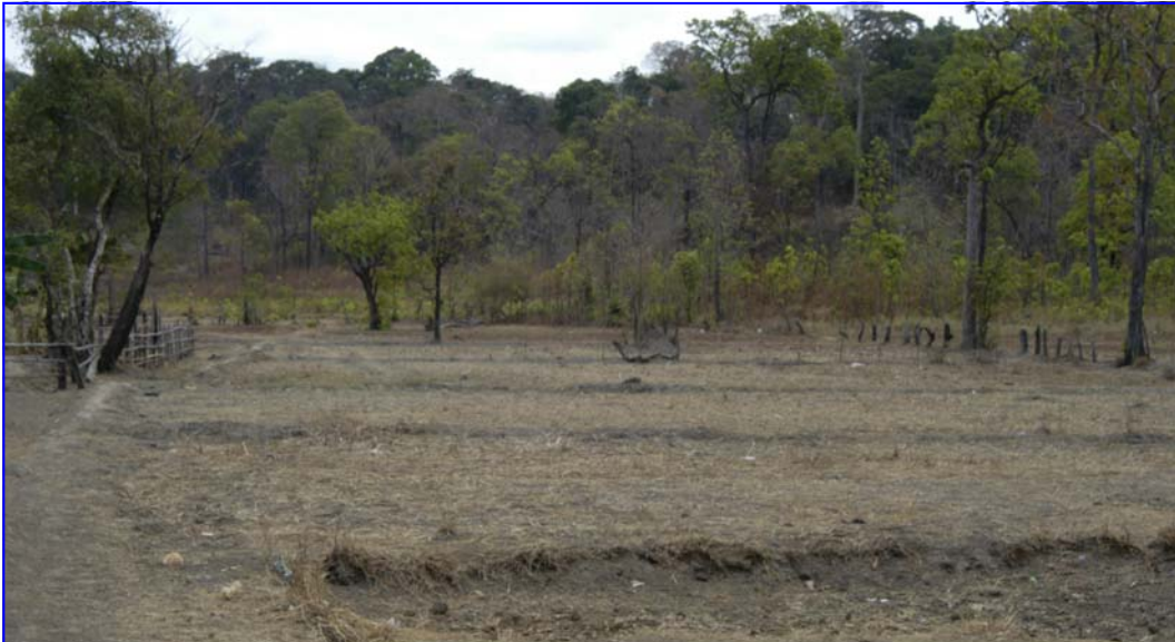
Rice field during dry season in Trapang Ches commune, Koun Mom district, Ratanakiri province

All these assumptions of early agricultural development work have been found to have failed. Many farming communities were actually worse off after agricultural development activities had been implemented. Over time these basic assumptions about agricultural development work have had to be radically changed. There is now a much greater focus on realising that local farmers (men and women) are the experts of their area and it is necessary to work with and build on their local knowledge.