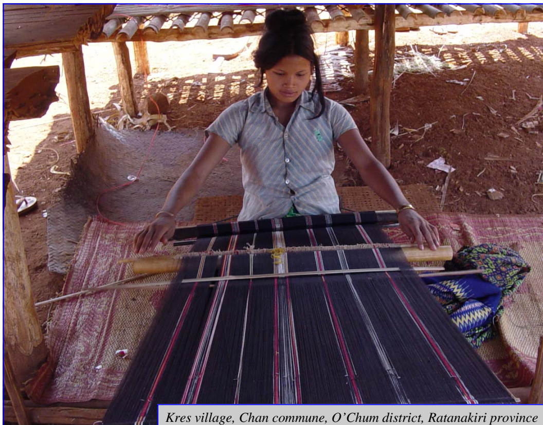
Kres village, Chan commune, O’Chum district, Ratanakiri province

Cultural change is not necessarily a negative development; cultures everywhere are changing all the time. The question is what control the communities in question have over their own cultural change and adaptation. It is important that the community itself decides what must be preserved, what can adapt, what should change. Some changes are actively chosen by the community, ‘combining the old and the new in ways that maintain and enhance their identity while