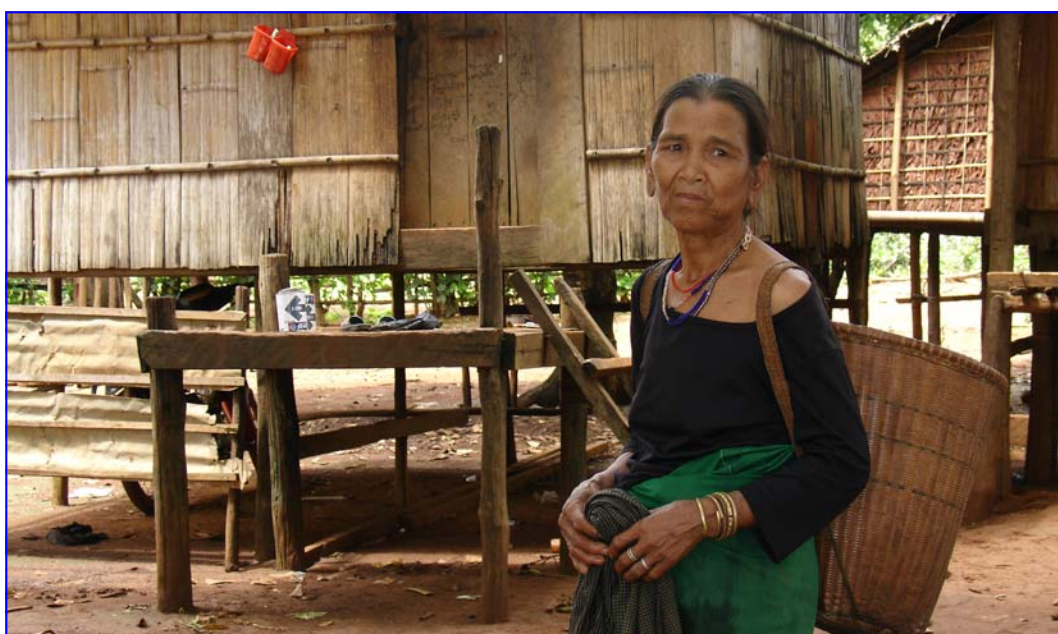
Villager in Kameng village, Chan commune, O'Chom district, Ratanakiri province

The community still cannot defend their land and natural resources from ongoing land selling and illegal logging, even forest land with large trees is being sold. Some villages now have no or little land and there is a fear that the end result will be violence. Many individuals within the community no longer respect their own leaders and don't respect the laws/regulations which have been developed to control activities. Some leaders and community committee members have been involved in illegal activities themselves and have no credibility. People now respect traditional law less, partly because it is ineffective in dealing with outsiders. While formal legal channels are difficult for many reasons, including that authorities have often already signed and authorized an illegal land sale.