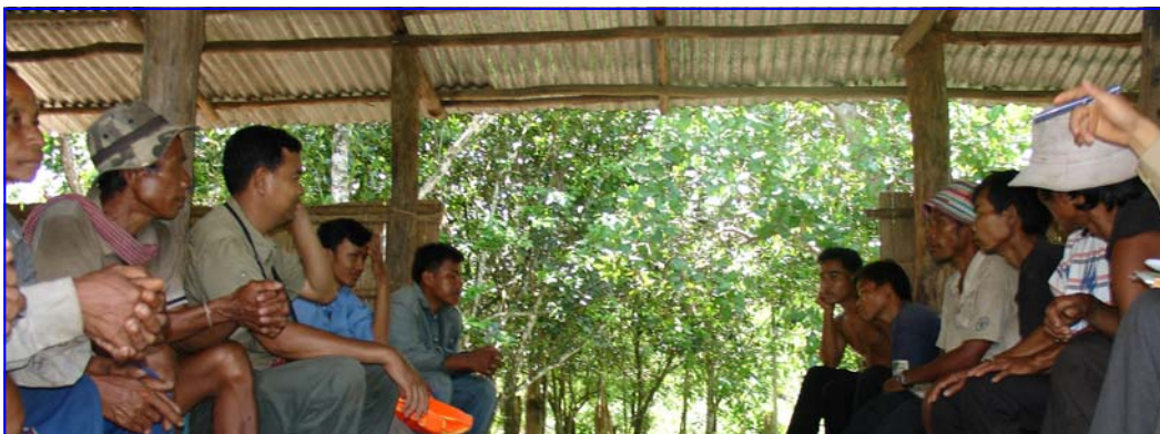
Phao village, Ta Veng Krom commune, Ta Veng district, Ratanakiri province

The ICD program made a paradigm shift when it moved away from humanitarian relief to support for capacity building for social services, and then again when it moved from a traditional sector-based service delivery work to the integrated community development program. The current emphasis on