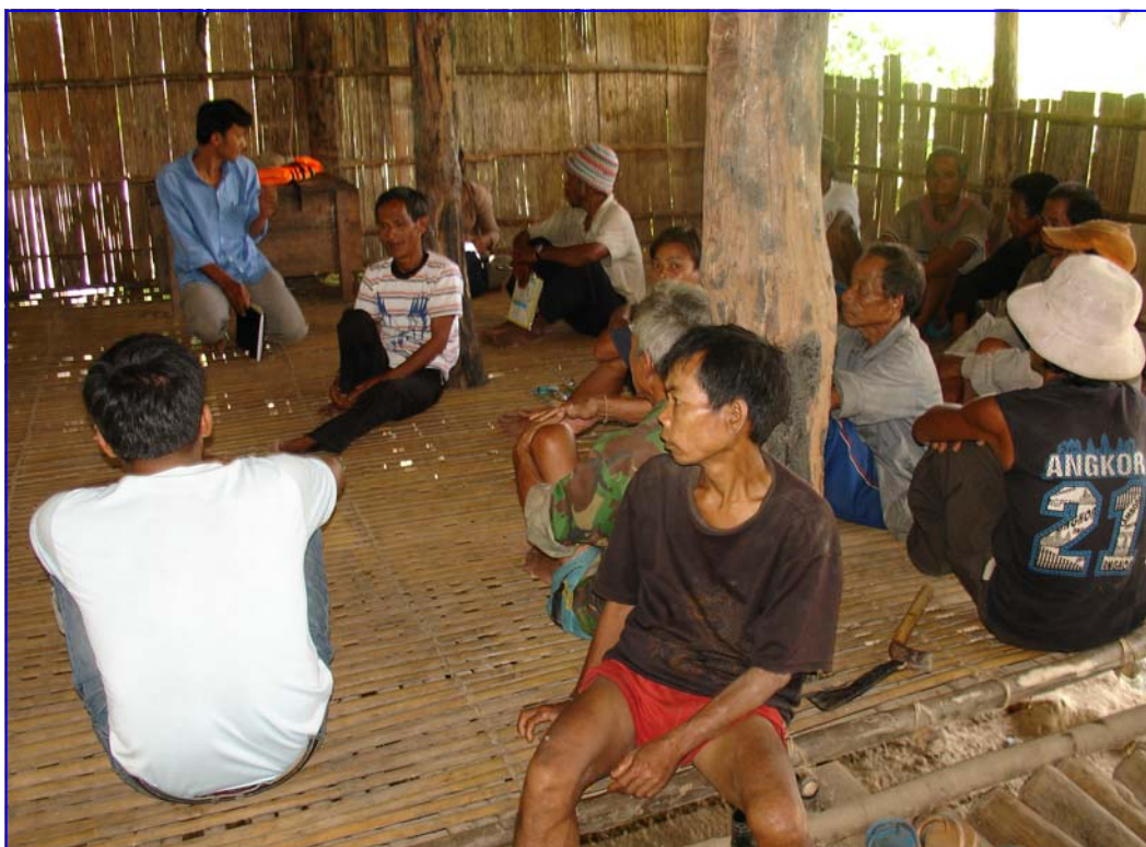
Phao village, Ta Veng Krom commune, Ta Veng district, Ratanakiri province

TAs derive their authority primarily from the consensus of the community who recognise their integrity and leadership based on their reputation for speaking well, fairness, objectivity, knowledge of customary rules and punishments. They are not acting independently, but are governing by consent, an agent of the community in the community. As CFI note ‘traditional leaders still exist, but they rarely speak fluent Khmer, rarely read and write, and operate in a non-hierarchical, non-formal manner. This puts them at a grave disadvantage when trying to interact with mainstream culture, when new laws and policies are drafted, and when development projects are implemented. But, the traditional systems are the ones which hold communities together.’