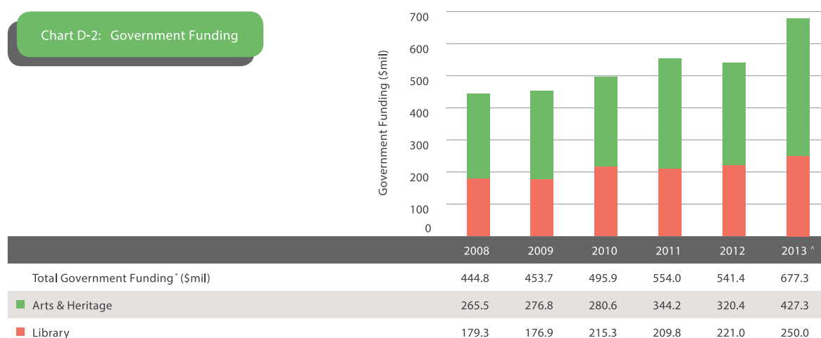
Chart D-2: Government Funding

Source: Ministry of Culture, Community and Youth, and Ministry of Communications and Information. Figures prior to 2012 were from the then Ministry of Information, Communications and the Arts.