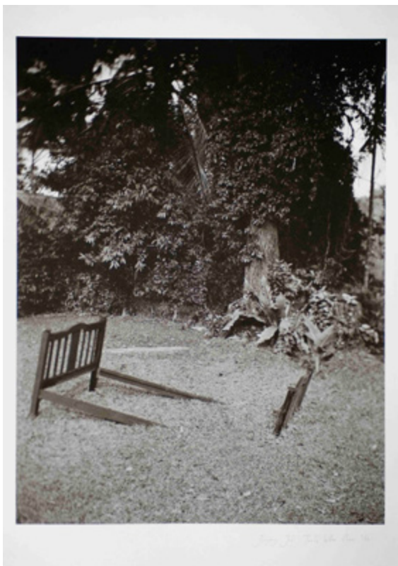
'Ranjang Jati: The Teak Bed that Got Four Humans from Singapore to Travel to Muna Island, Southeast Sulawesi and Back Again,' 2009–2015, Wilton Close, Singapore.