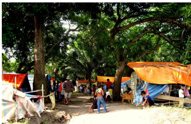
Figure 12: Fatima's “new home” is one of these tents

“We did not really want to come to Pikit because we had our farm to think about and our crops were ready for harvest. When the military came, we were asked to leave our village. My husband asked for the military’s permission to go back to our farms just to harvest our crops, but they said no. They had to ‘clear’ the area of MILF fighters. Then, that same day, the fighting began and we had to flee to Pikit Poblacion (town centre). Nowadays we just sit here, waiting. Waiting for dole outs from NGOs. Waiting to receive rice, noodles, sardines. We wait for handouts, but our farms are also waiting for us. The copra in our backyard is waiting. The corn, ready to be harvested is also waiting. They wait, we wait. Look at our new home. When it rains, the water seeps in. Last week, my husband had fever. Now, he’s better. He wants to go back and try to harvest our crops so that we do not have to rely on handouts.”