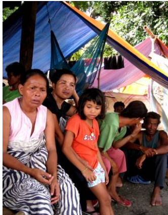
Figure 14: internally displaced persons in North Cotabato province

government to adhere to the UN Guiding Principles for Internal Displacement, including Principle 3(1) which states: “National authorities have the primary duty and responsibility to provide protection and humanitarian assistance to internally displaced persons” and Principle 24 (2) “Humanitarian assistance to internally displaced persons shall not be diverted, in particular for political or military reasons.”