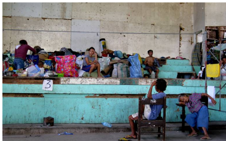
Figure 10: At daytime in many IDP centres, only elderly, women, children are found

In most of the sites visited by Amnesty International, there were midwives and at least one social worker present. Medical care, however was inadequate. There were reports of children dying from diarrhoea in some centres. While on one centre visited by Amnesty International there was a debriefing session conducted by the social workers, other displaced people, especially those staying with relatives, do not receive professional help in processing their often traumatic experiences.