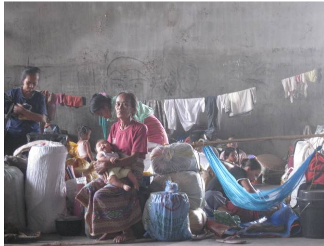
Figure 9: Displaced people in Buisan Evacuation Centre in North Cotabato province

Those that stayed indoors in the rice warehouses or gymnasiums slept on the cement floors, using discarded rice sacks or salvaged blankets for their bedding. Other sites included Islamic schools, mosques, beach resorts, an old municipal building, an old market and a hospital.