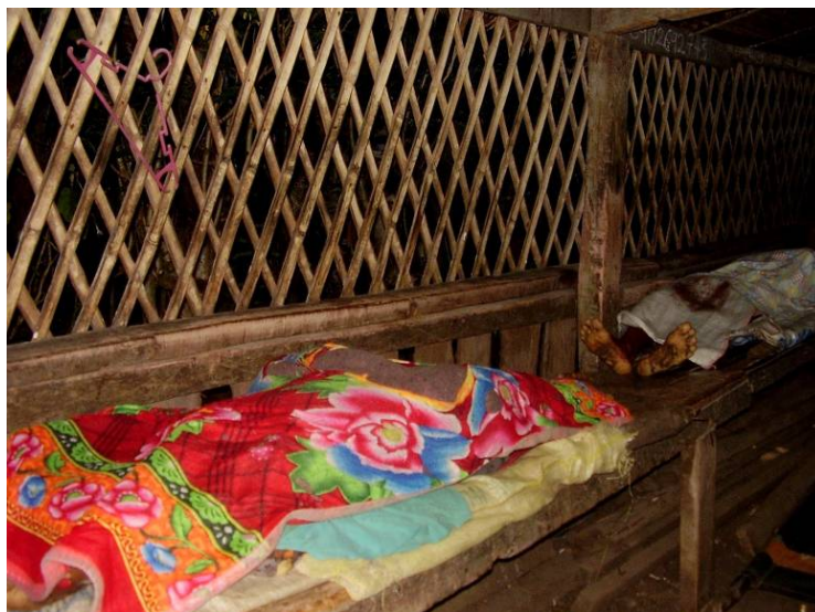
Figure 15: Volunteers recovering the body of Dulcisimo