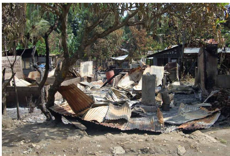
Figure 19: Remains of a burned school in Lanao del Norte province