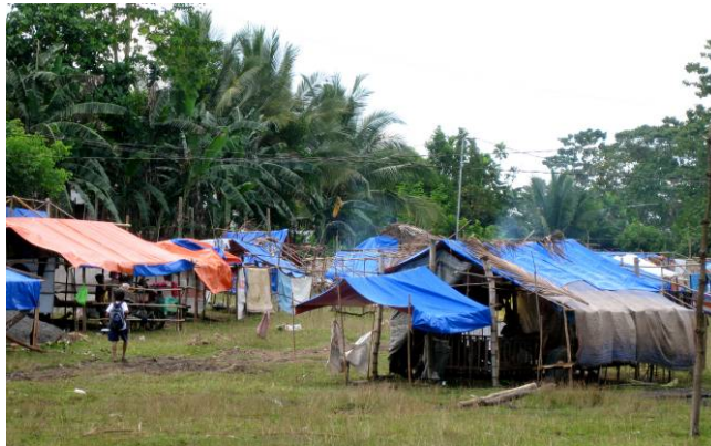
Figure 7: A “tent city” style IDP site in Pikit, North Cotabato

Amnesty International visited some of the temporary shelters including a church-owned gymnasium, a rice warehouse, and various “tent cities”. “Tent cities” are informal structures where displaced people use donated tarpaulin tents for shelter. They augment these materials with dried coconut palm leaves or ripped up sacks of rice. On a typically rainy day during the monsoon season, displaced people have to contend with the muddy ground that is also their floor and sleeping space.