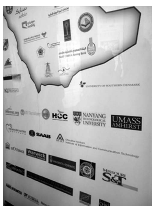
A board showing the collaboration of King Saud University with international institutions, including NTU

All recommendations would be further studied by both parties before charting the way forward. In addition, the Chair expressed its intention to visit Singapore in time to come as a follow-up.