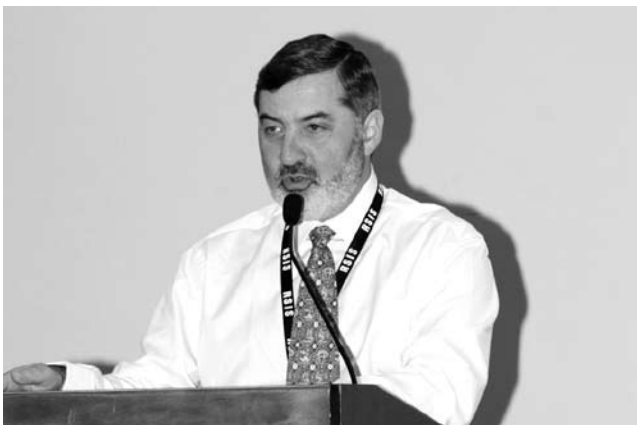
Lord John Alderdice

Lord John Alderdice spoke on the topic of mainstreaming counter-terrorism and its challenges based on his experience from U.K. and Northern Ireland. He said that although mainstreaming counter-terrorism was indeed an attractive idea, its implementation into a nationwide policy would not be easy, mainly due to the obstacles that currently exist