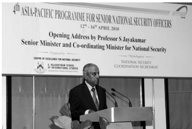
Senior Minister and Coordinating Minister for National Security Professor S Jayakumar

Professor S Jayakumar , Singapore's Senior Minister and Coordinating Minister for National Security, delivered the opening address.