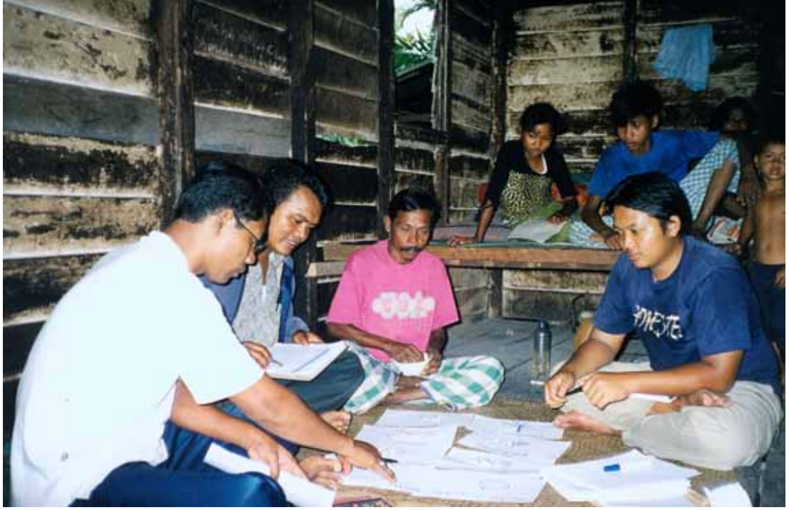
Villager during the PDM exercise