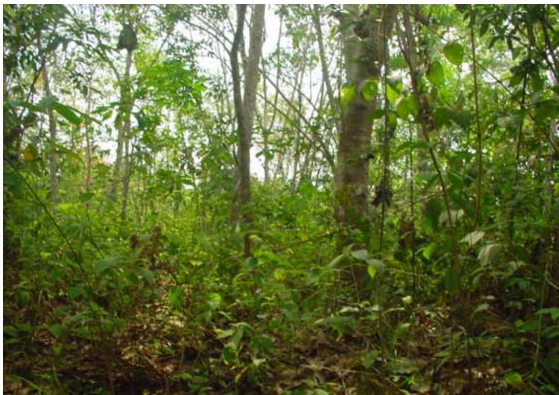
Jungle rubber ( Hevea brasiliensis ) in HTI concession areas

Pulp mills can use almost any wood over 10 cm in diameter to produce pulp for paper and related products. The HTI permits allow the concessionaires to clear-cut the allocated areas (up to 300 000 ha) and to use that wood to supply the early years of their operations. The agreements are usually signed for long periods (42 years for concessions before 1999 and 100 years for those after 1999) and the plantation companies are expected to plant tree species that will meet their mill requirements on a sustainable basis.