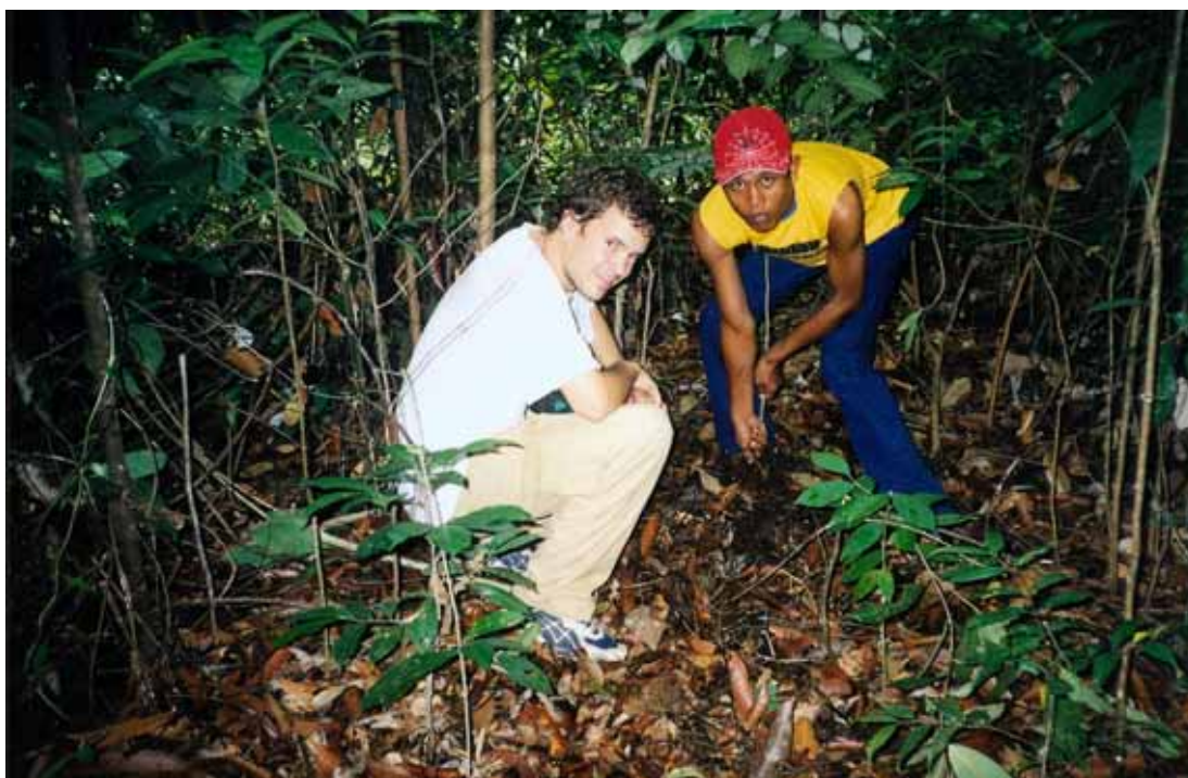
Farmers often visit the remaining forest areas for several resources important to their livelihoods

While this result does not support the reduction or elimination of CD expenses, it does highlight strongly a need for the companies to do some internal brainstorming to try to better understand the reasons and motivations for the claims in their HTI areas. Investment in CD could help in reducing land conflict if it is done in a way that targets specific solutions in each area, instead of simply giving the money away (as is done in part at present). A more detailed analysis at the company level will be required to assess the precise reasons why larger areas are affected by claims where more money has been spent. Nonetheless, these findings already point to the need for a proper rethink of the way the CD money is spent.