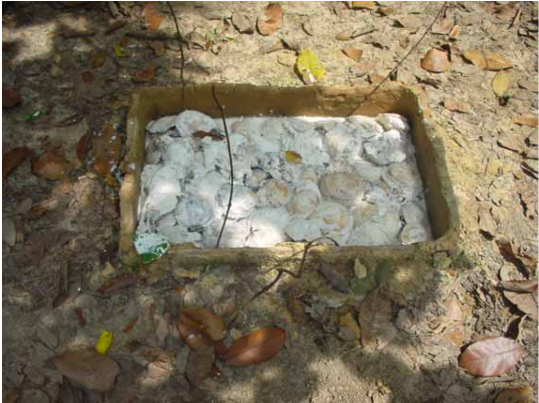
Rubber extracted from the forests in HTI concession areas in Jambi

As mentioned above, these large areas, legally considered State land, often overlap with villages and indigenous community lands. Such areas may contain rubber tree ( Hevea brasiliensis ) plantations, cash-crop or coffee plantations (mainly in North Sumatra); significant proportions of commercially valuable timber (Kartodihardjo and Supriono 2000); or jungle rubber 4 managed by the locals. This then results in the overlapping of interests and the emergence of conflict over the areas.