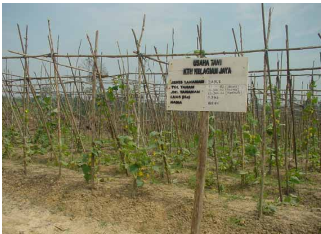
Vegetable cultivation developed by farmers with Company support

The first should demonstrate the significance of the CD expenditures on the incidence of land conflicts and may be a tool in the decision-making process for the companies. The second (obtained land value) could be used to help reduce land conflicts and ensure long-term adoption of the partnerships if used by the companies and communities as the bottom price to be offered/received for land conversion to tree plantations in the areas.