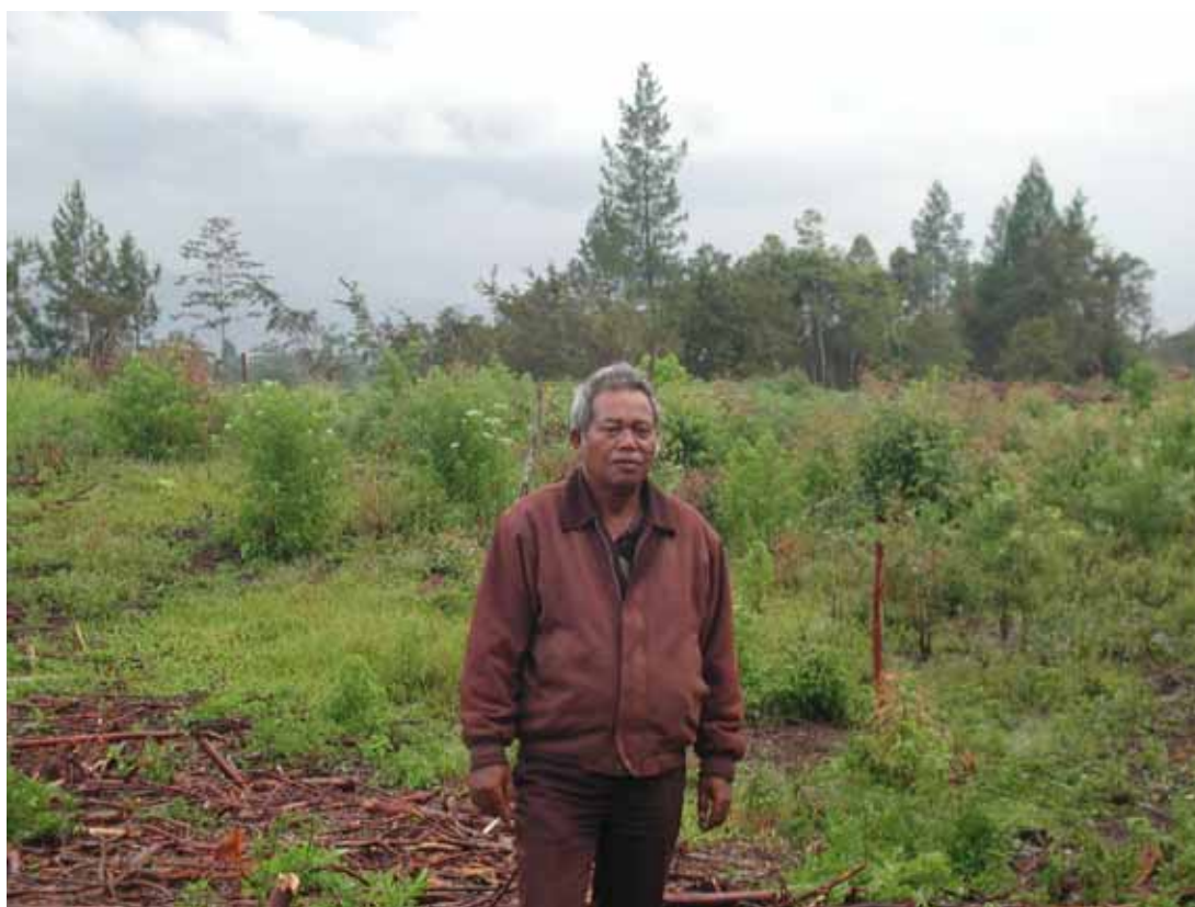
Farmer participating in the PIR joint scheme with IIR

The CD programme began in 1995 and has an average expenditure of US$53 000 per year (see Table 5).