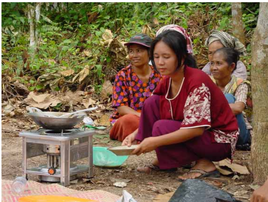
Women cooking in the forest

some), we found that such areas provide more than 300 products to the people who live in or near them. Understanding the importance of these areas and their resources to the local people, and attaching a proper value to them is essential for the companies targeting successful long-term agreements. Offering benefits far below the current benefits people perceive that they receive from the areas will only result in low acceptance and low commitment from the communities.