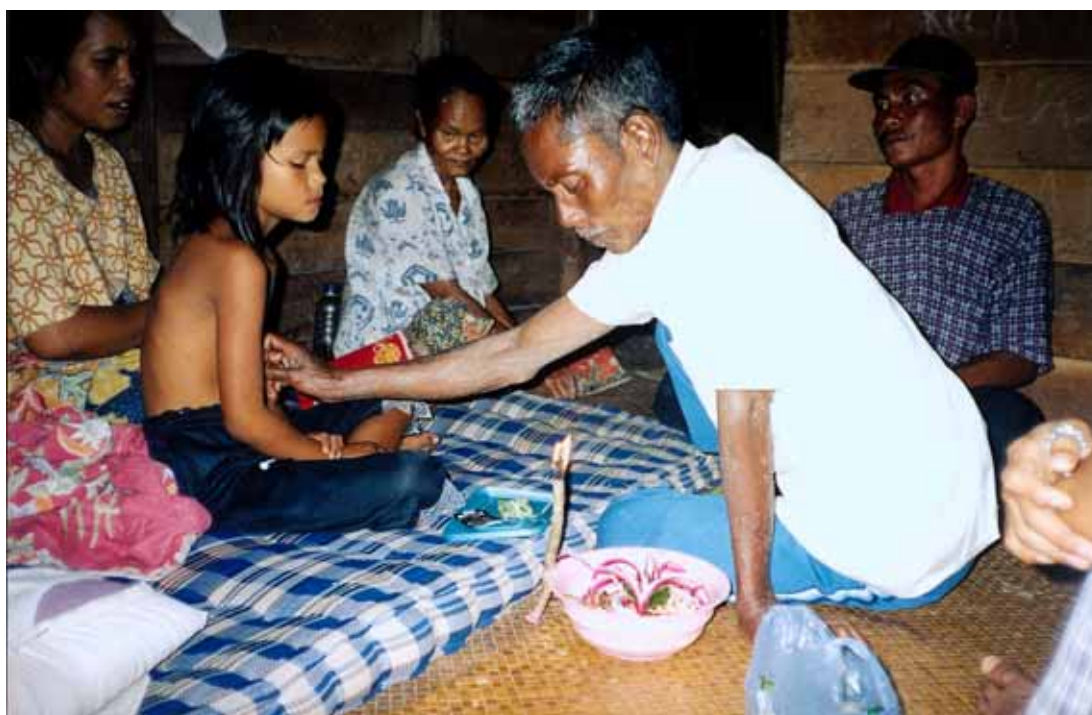
Several products used for medicinal purposes are being obtained from the logged-over forests given in HTI concession

Furthermore, some expenditure lines such as 'help for people', 'community support' and 'social expenses' are too loose to explain how the money is being spent. This leaves gaps for 'gifts' or 'pocket money' for the benefit of one or just a few members of the community. Thus, the money is spent without solving the land conflict issue for the community and rather creating the opportunity for further conflict.