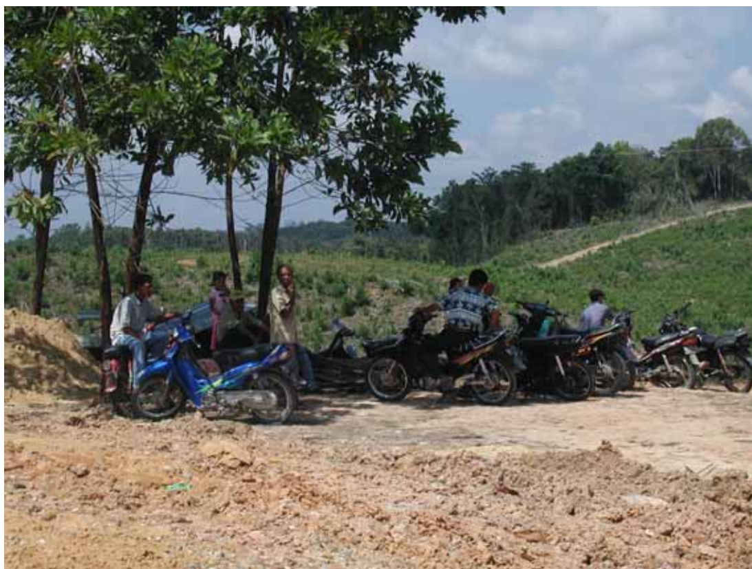
People can travel large distances to get to the areas where plantation companies are undertaking activities

only by the Penaso River. It was a poor village, where some of the people were still using wood, bark, rattan and palm leaves for house construction. All members of the sub-village were Sakai people who had lived in the area since 1944. Most of the people made a living from fishing, either by trapping ( lukah ) or using a fishing rod ( taju ).