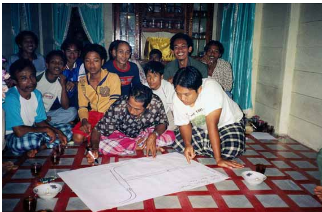
Villagers drawing a community map of their areas

Using the map for general understanding of the areas under analysis, we began to interview householders and ask them to list the products obtained or harvested from the areas for each of the 12 use categories included, and rank them in terms of their perceived importance, using the Pebbles Distribution Method (PDM). This method is a scoring exercise, developed to quantify group assessments of the importance of non-marketable forest products (see Box).