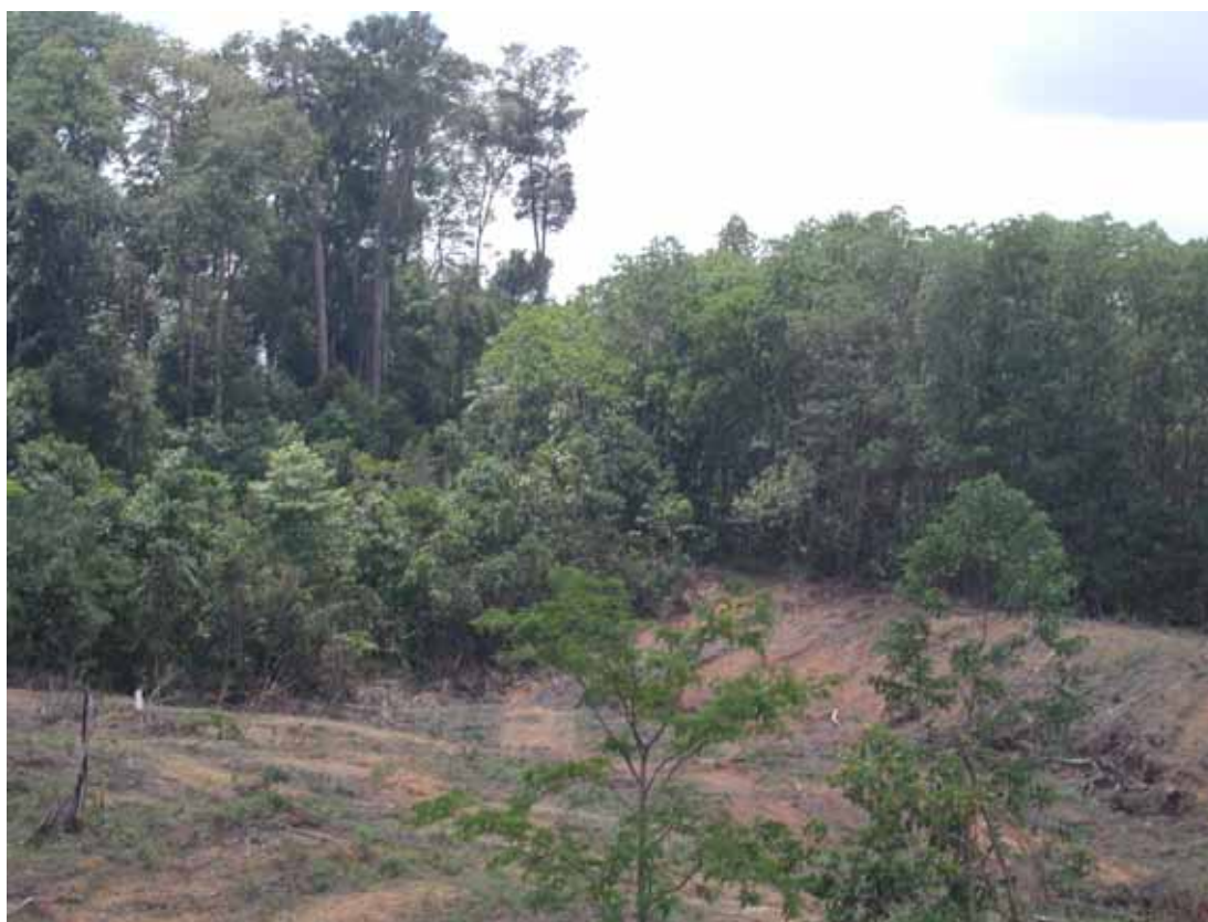
Patch of forest in HTI concession claimed by local villagers

To successfully target community or private lands in the concession area with Company-