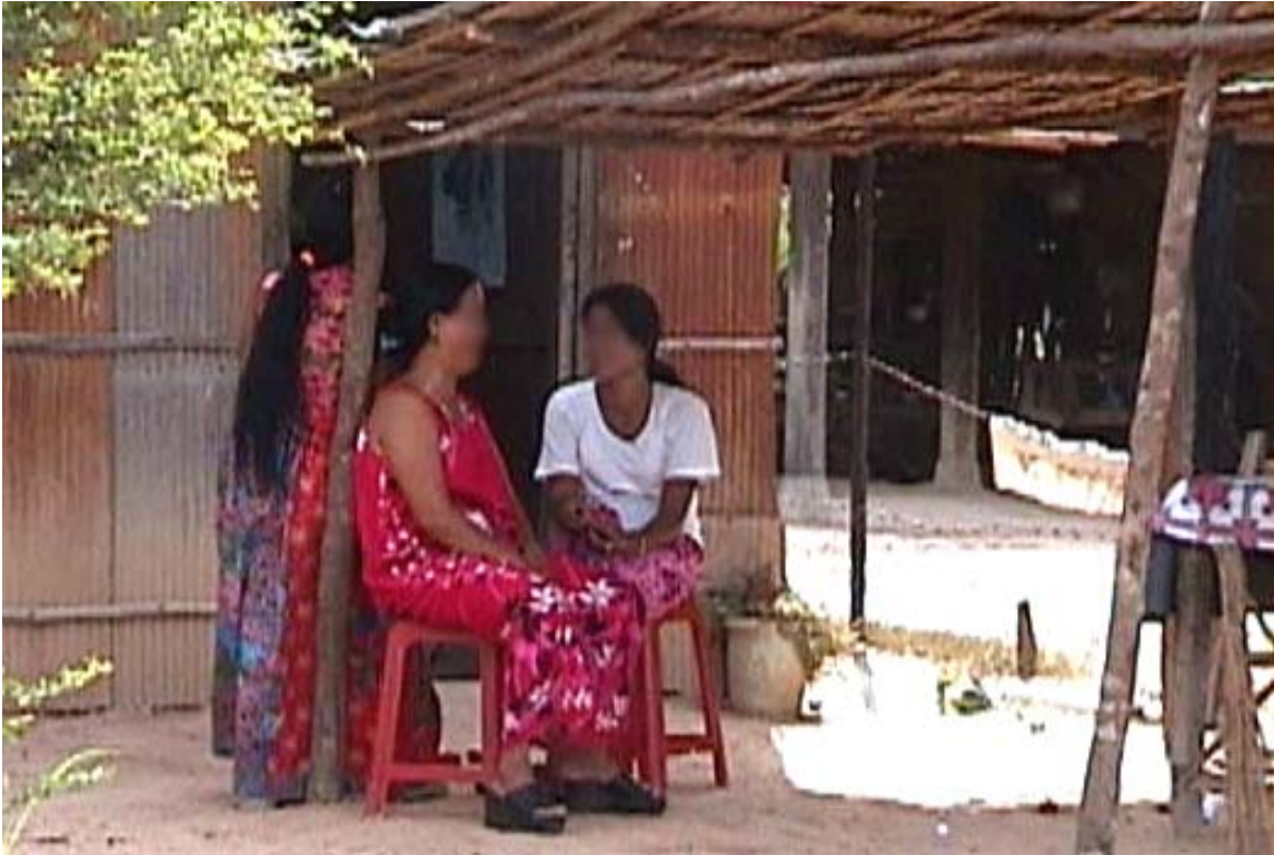
Women await customers outside small brothel in East Central Cambodia

Validity. Sex workers in any sex venue are normally free to leave the work location with customers, and in fact are expected to do so in venues without an on-premises location for sex. Sex venues are in business to make money, and are motivated to reduce costs and increase profits. Control of the movements and location of their employees occur when a venue's managers believe they may incur unusual costs from this freedom. These costs may result from sex workers who according to management's accounting system, owe money to the venue and whom they suspect may fail to return, might complain to their family or to authorities if free, while they cannot call or complain while ensconced in a trafficked brothel, or might run away and not return to pay off a real or imagined debt.