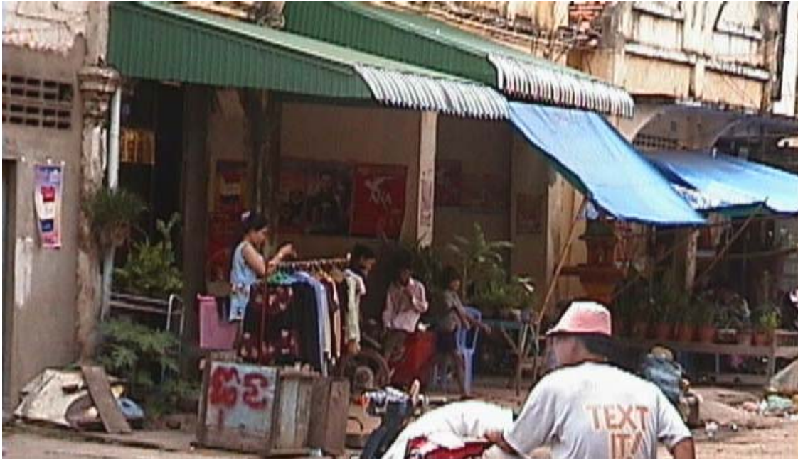
These daytime shops in Southeast Cambodia become sex venues in the evening.

entering the public debate on trafficking in persons, and is often accorded equal status to that given to empirical reports. Derks et al., (2006, pp. 21-26; 29-32) cite many of these guessed estimates in their interesting analysis of trafficking numbers, questioning the credibility of several. The essentially equal status sometimes accorded to guessed estimates may be due in part to the stakeholder status of many of the groups that support these estimates, groups that often provide support to rescued women and children. As important as they are, such groups often believe that their financial support is tied to funding agencies' perceptions of the size of the problem, and that this size is measured in terms of high trafficking numbers. The need for financing influences some groups to put their faith in higher numbers regardless of the evidence. This misplaced faith can lead to confusion over the effectiveness of interventions and prevention programs.