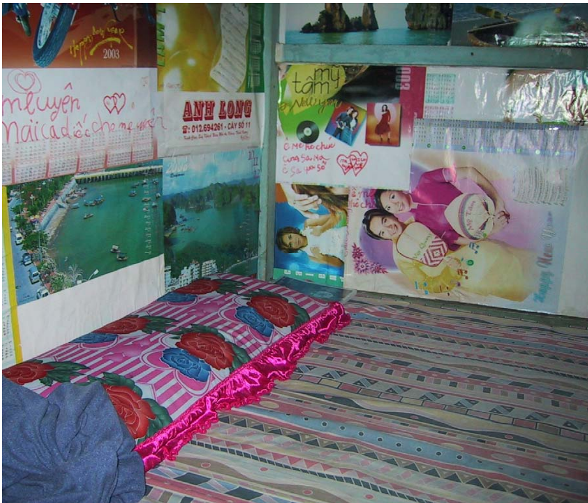
Brothel room in Phnom Penh. Many such rooms have space only for a bed and a way to enter and exit the room. Brothel workers often sleep in the room where they work.

Assumptions 3 to 5 above under Theory and Rationale state that sex work is unlikely to occur in rural areas, including smaller and mid-sized villages. This was borne out by the results from Teams A-E and by Team F in the countryside. Essentially the only villages found with sex work were on main roads in the area, despite an intensive search. In the countryside there appears to be a minimum “natural” distance between such venues such that a sex work venue tends not to occur within a certain travel time distance from another village that has a sex work outlet, thus concentrating rather than diluting the pool of potential customers. This may have the effect of increasing the potential customer population within a given area to a critical level. Cambodia census data are not provided in a manner that allows a calculation of the critical level of the general population size that appears to be required for sex work to occur, and teams did not provide estimates of the population of villages where sex work did and did not occur.