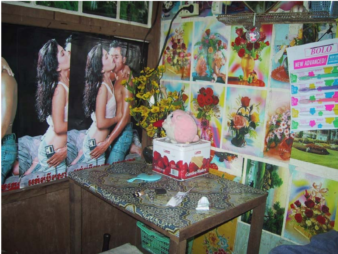
Stand in brothel room with Number One condom ads used as decoration

Brothels are prototypical direct venues. Women are often seated in a room out of sight of the street. The portion of the building behind and/or above the viewing room is usually partitioned into numerous small rooms with a mattress or bed.