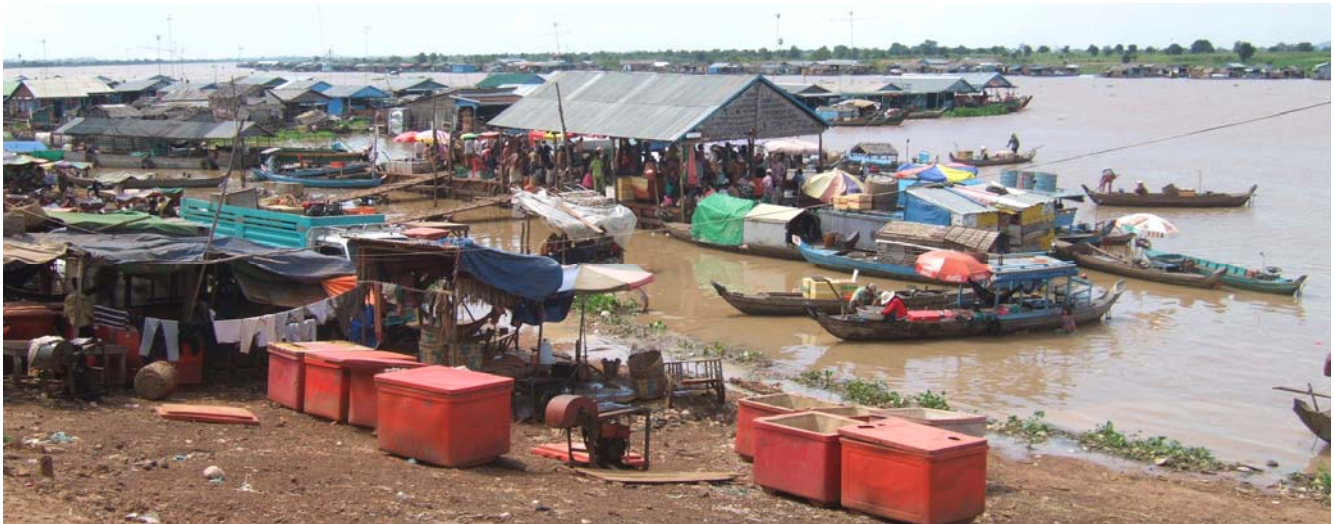
This floating market on the Tonle Sap River in Kampong Chhnang offered no sex work, but it is occasionally found in more dense collections of shops.

These five concepts from [1] to [5] allow calculation of yearly trafficking numbers or estimates over any specified time period through empirical observations.