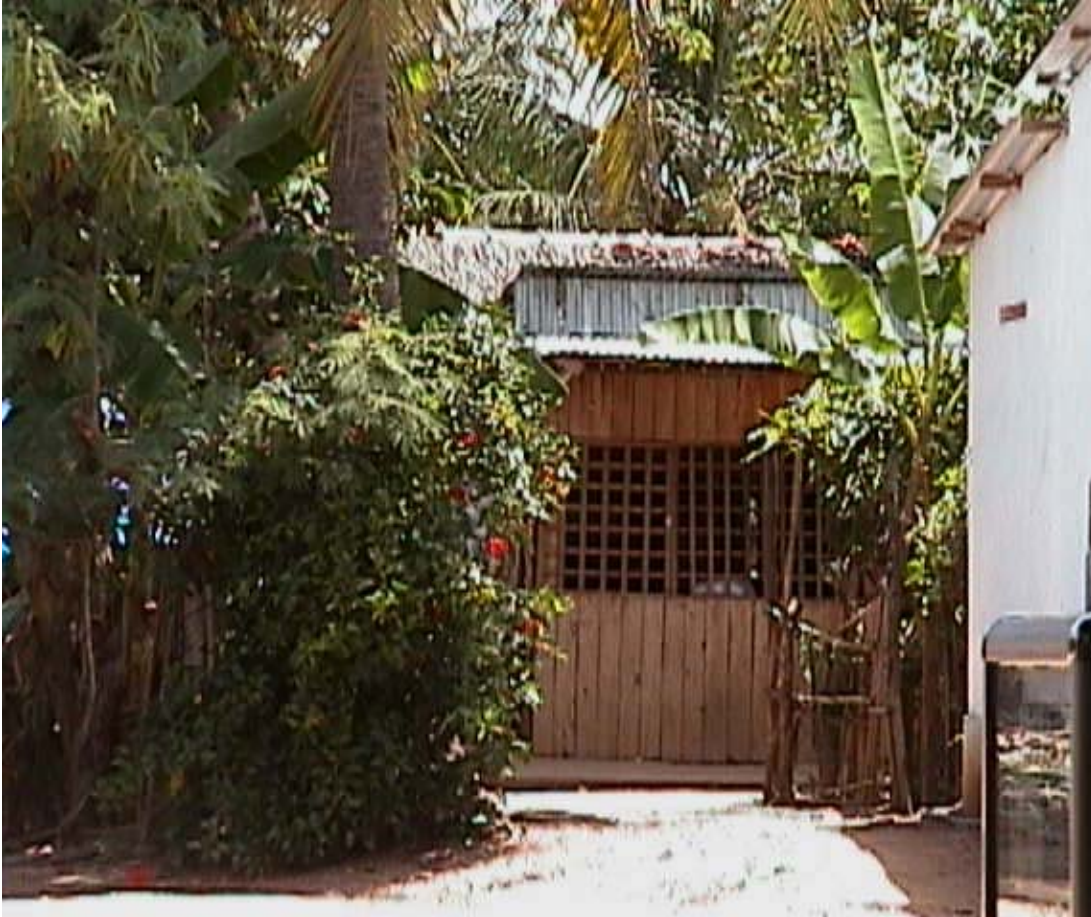
Brothels, such as this one several hundred meters west of the main channel of the Mekong just north of the Vietnamese border, may be set back from the street behind several other structures.