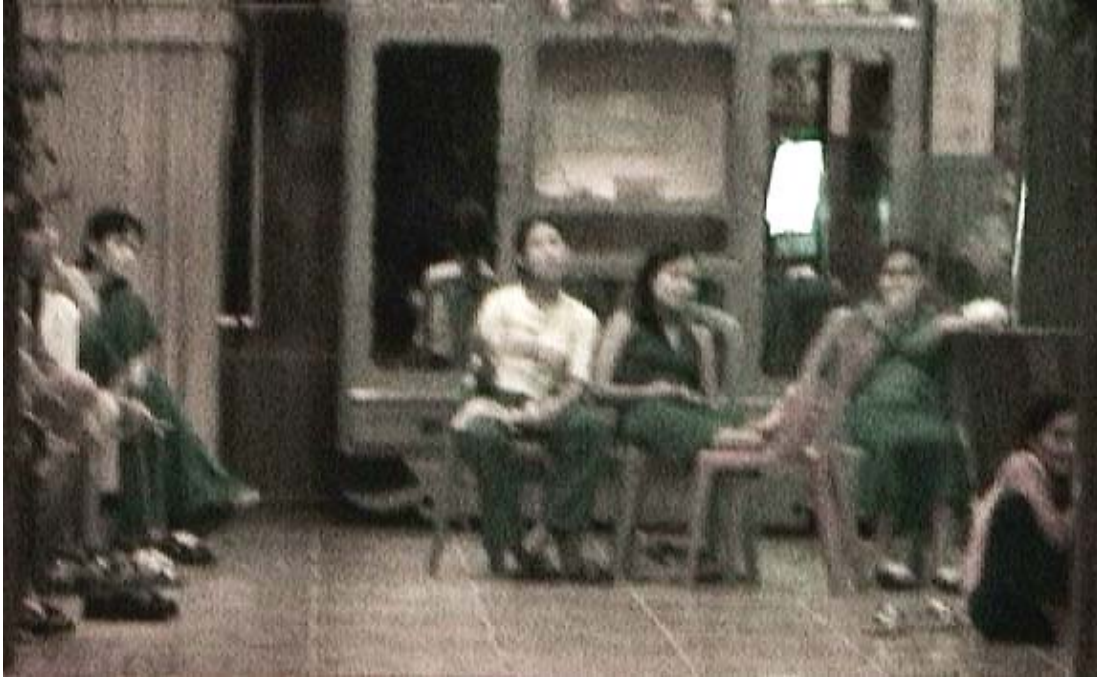
Viewing room of brothel in Southwest Cambodia at night

to be accurate, for each of the non-independence reasons cited, the calculations represent a slight over estimate of the total number of sex workers. This is also true for the total number trafficked