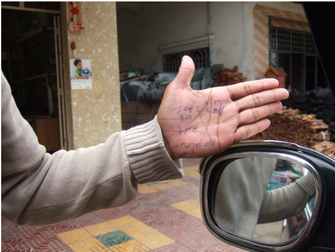
Interviewer in Southern Cambodia provides information to data recorder using notes on his hand, several blocks from venue to which it refers.

These interviewers were hired as day laborers were given the specifics of the information desired. We asked them to bring us: the number of workers observed, whether any worker who was selected could leave with the interviewer to go to a local hotel, and whether any “small ladies” might be available. They could obtain this by discussion with workers or management and by observation. Interviewers were not told how to obtain the information or why it was being requested. The specifics of how to request or obtain the desired information were left to the personal style of the individual data gatherer. Informants received no instructions in terms of specific questions to ask or scenarios to present in obtaining the requested information, as an intentional part of our method. Training observers on how to ask questions may create a ‘clerk’ or