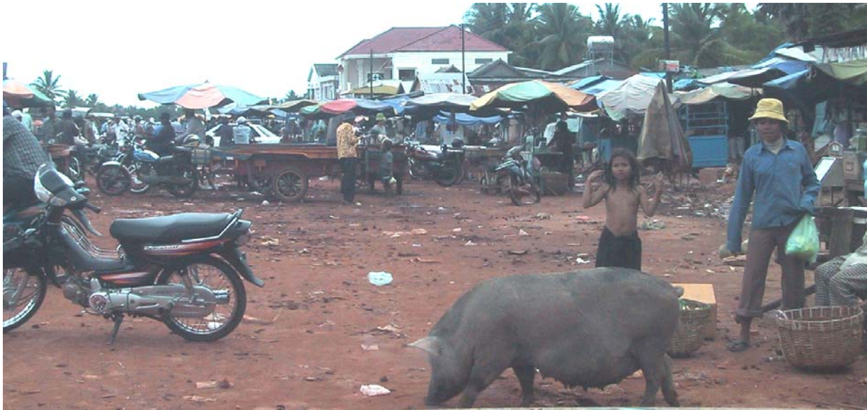
No brothels are in this market by the side of a National Road, but one operates 100 meters behind market stalls on right

Reports from victims sheltered by NGOs are one possible source and need to be monitored. The trafficking section of the US Embassy follows all such leads carefully. Such reports occasionally lead to the prosecution of traffickers. Trafficking victims are seldom in a position to know about numbers of others in their circumstances beyond those directly observed in their own immediate experience, and they are commonly kept in a confined location while trafficked. They are often unaware that they are or have been trafficked until well into the transit