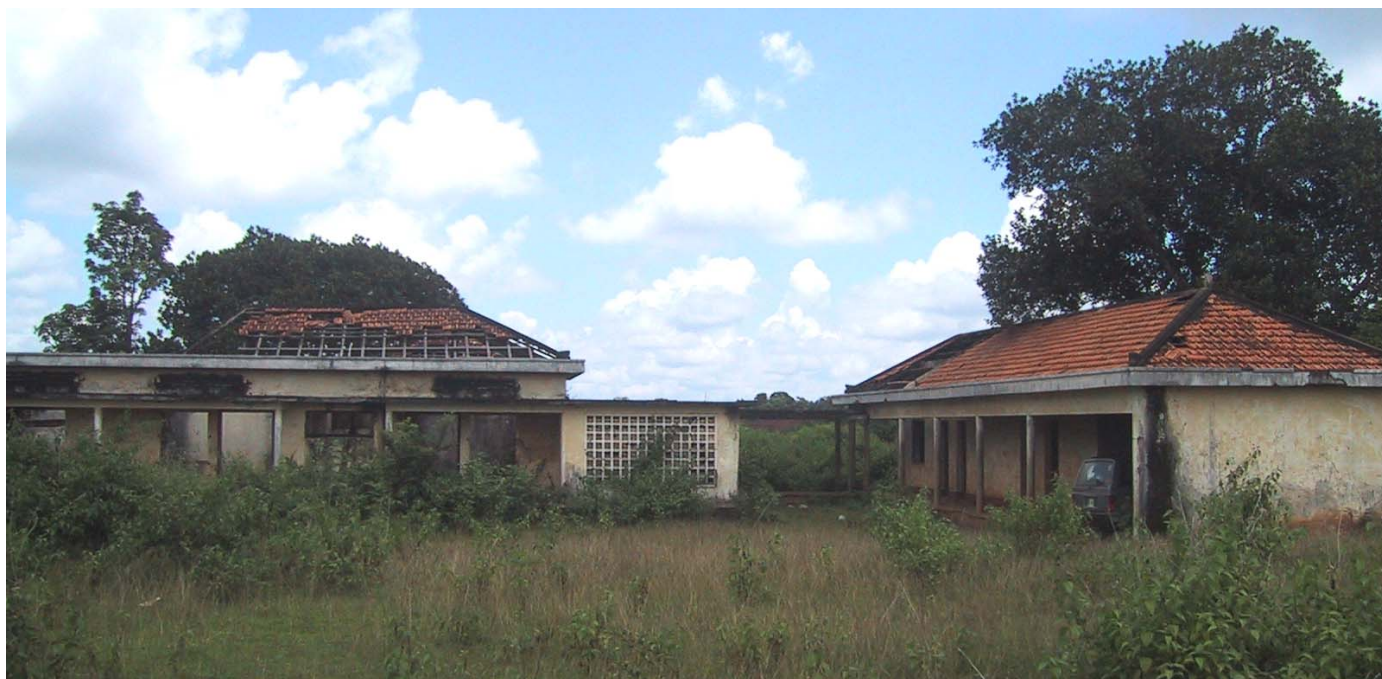
Former Royal Retreat in Saen Momourom near the central highlands of Vietnam bombed by US planes during the US-Vietnam War in the early 1970s