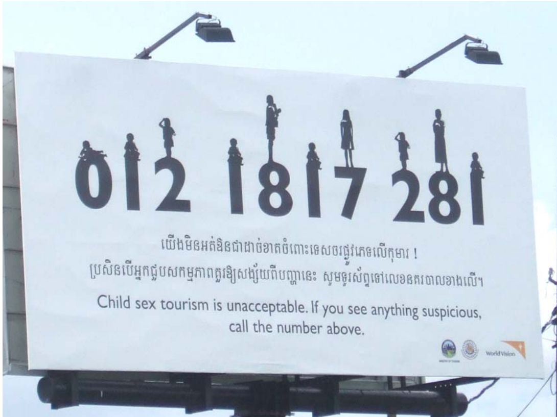
Ways of reporting suspected child sex tourism are not difficult to find, as in this billboard in Siهانoukville

Concern with which authorities to notify is always problematic. Any person or group believing that the appropriate course of action is to call in the police, rather than other authorities, if trafficking is even suspected need only follow location and observation procedures similar to ours in order to find such places. Yet many though not all sex venues in Cambodia are either run by or protected by some elements of the police. As in any police force there are honest and dishonest elements, and 'Calling the police' or other authorities operating in a given locality is often not ethically appropriate. Many other notification possibilities exist, and a better alternative may be the reporting of trafficking results to an agency such as the child sex tourism hotline or the human trafficking section of the Embassy of the United States of America. Embassy personnel insure the careful investigation of all reports of suspected trafficking.