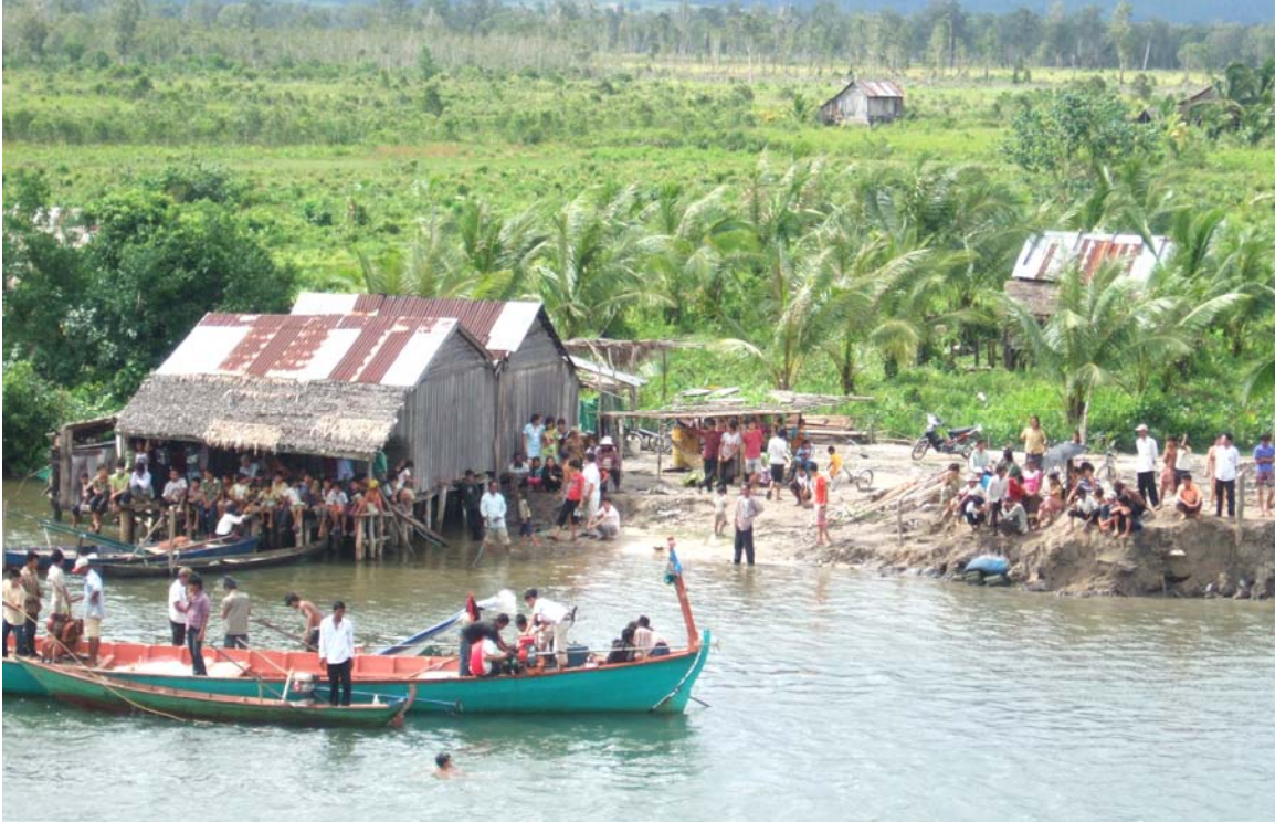
The collective concern of Khmer people for the welfare of children is illustrated in this impromptu rural gathering. A young girl has fallen from a fishing boat in rural Koh Kong Province. Boom on the far side of the boat is being used for dragging. Her body was found shortly after this picture was taken.

Ethical questions that occur include: Is the person in question actually trafficked? If of age, does the person see it in their best interest to be rescued? Are they accurate in this perception? What negative consequences might happen to this person and others if this person is “rescued?” Will the intended course of action create greater dangers for the person in question or for others, possibly members of the research group? What happens if the rescue goes bad and workers are injured or worse? What are the probabilities of success of the intended course of action, and of failure? What are the potential unintended consequences and the probabilities, costs, and benefits of success, and of failure? What are the potential dangers for members of the research team if this action is taken? The same or similar questions apply if the person is not “rescued.” It is often impossible to determine a solution that is ethically satisfactory from all perspectives. That does not mean the ethical implications of finding a trafficked person should be ignored. It also does not provide an unambiguous ethical course of action. The case of children is different since identification is clearer, though some of the ethical problems are similar.