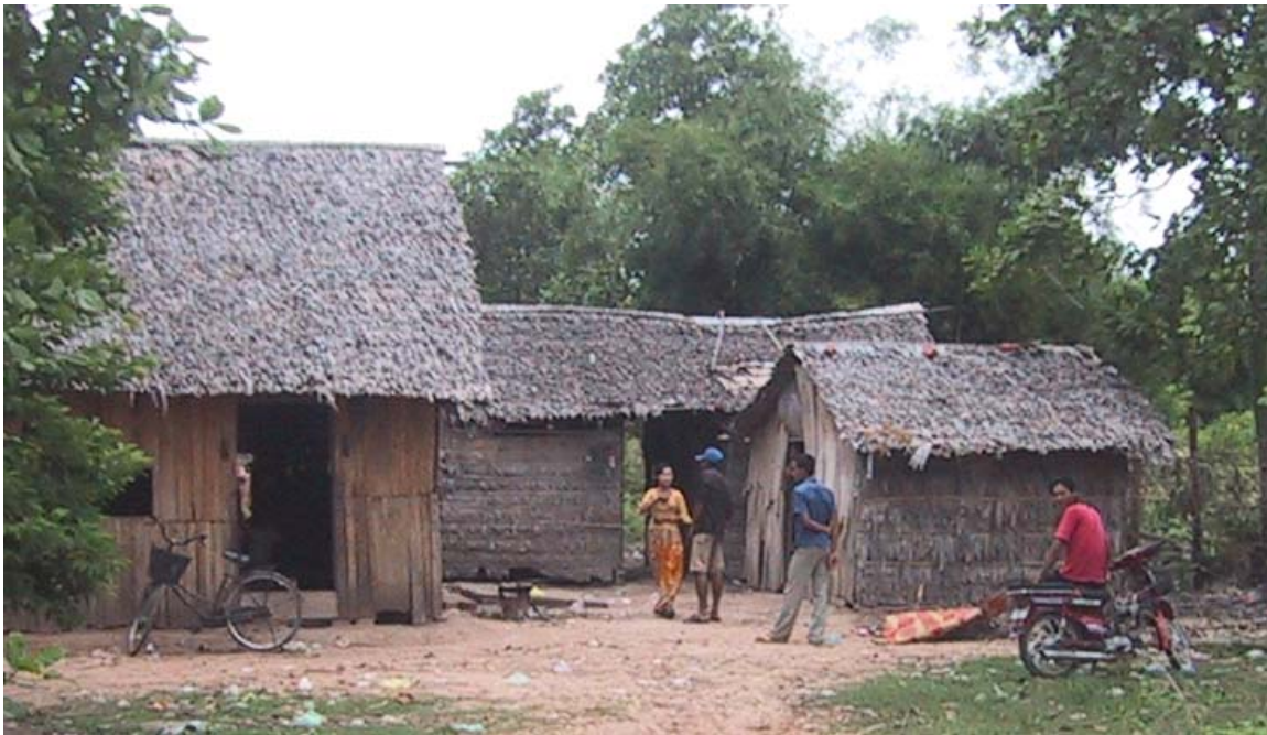
Brothel in Northeast Cambodia - Moto driver waits while passengers inquire and negotiate. These individuals are not part of the research effort.

if the driver would like to be paid or whether he would like to show the passenger another venue. In almost all cases the driver wishes to continue. The driver is encouraged to drive to "hidden" locations in addition to popular locations, perhaps those not often visited, or visited only by people with money, or with sex workers who were unusual in some way, or young. After several such locations have been recorded, the passenger pays the driver what is owed, but asks if the driver would like to work with him longer for a set amount. The driver usually accepts. If accepted by the driver, the process continues until the driver wants to stop or when the driver can think of no new places. If the driver does not accept he is paid. If there is time left in the day, the team member then walks one block, hails another moto that is driving down the street, never one parked at a location, and continues the process. This provides a clean break between each successive moto driver on a given day and none know of the other's work, or of any prior