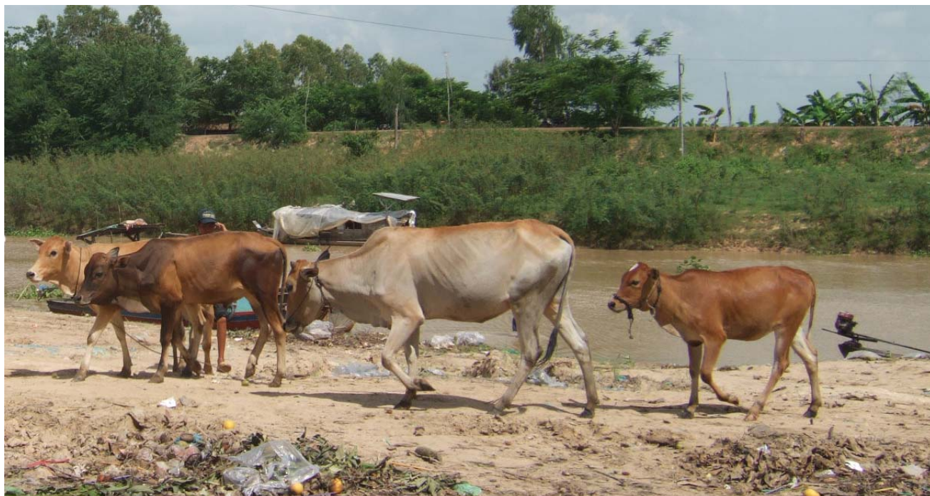
A stream forms part of the Vietnamese border near the “Parrot’s Beak” area of Svay Rieng. Cattle are on the Cambodian side. People cross with no border controls. Paved road in Vietnam near the top follows the stream. A dirt road leads to this point in Cambodia. Most of the border between the two countries is uncontrolled.

far more likely than the Phnom Penh teams to search in areas sufficiently rural that motodop taxis were in limited supply. When this occurred, location information was obtained from individual local males, as described under Locating Venues , above. In this regard, Lainez (2010) provides a discussion of Vietnamese migrants from An Giang entering Takeo.