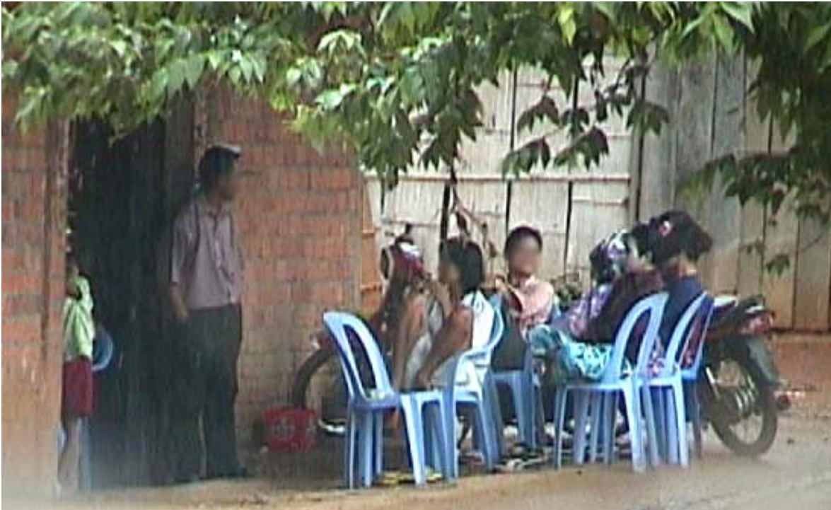
Moto driver waits for customer, while workers and mamasan await more customers near a small town in Western Cambodia close to the Thai border. Much sex work is quite open. Child is the daughter of a worker. Women and men often take entire families to work with them, or live where they work.

as advertized, and the clientele entering and leaving. While Team A marked potential sex venues based on the testimony of the moto driver or other informant, Team B used the sense of the main researcher and the street knowledge of the Khmer assistant to make this determination. Following the creation of the map, a team of moto drivers were employed to enter the located establishments so as to determine the number of sex workers, their age, their nationality and whether they could leave the establishment. Interviewers for Team B were aware that they were working for a researcher who was interested in obtaining the data they were asked to collect. In the case of large venues such as The Building, a long rambling six story decaying structure near the Mekong known as a major low-priced sex work venue, all apartments were marked as potential sex venues.