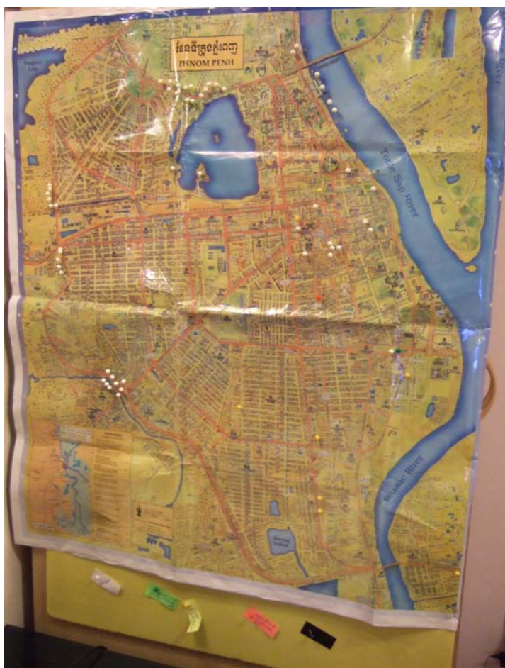
Hard copy map of Phnom Penh used during early stages of data collection by one team in 2008, at this point indicating several venues of potential interest.