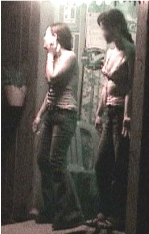
Workers await customers at night in small brothel in Southern Cambodia with only two workers

to considerable reticence of sex work management to disclose certain information, which is also likely to restrict the form of access employed to obtain data from available non-freelance sex workers. When sex work operates relatively freely, as has long been the case in Cambodia, simple direct communication with the manager and workers provides accurate information from those most likely to actually possess knowledge of the information required. If the anti-sex work edicts are enforced, then during that time and in the geographic areas when and where it is enforced, any method of locating trafficked individuals will be affected.