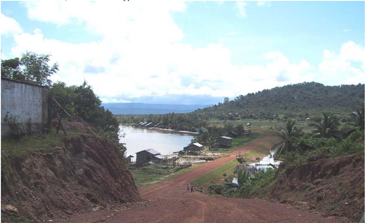
Port in Southwest Cambodia with early to mid-20 th Century reputation for smuggling and contraband

This line of thought suggests that labor suppliers may be the easiest knowledgeable source. But if labor employers will be circumspect, that should be doubly true for labor suppliers involved in trafficking. Yet this may not be true. Just as brothel owners with trafficked women and children would be expected to avoid providing information about trafficking, legitimate business questions can be formed that will produce that information. Labor suppliers may also provide relevant trafficking information in the same way and for the same reasons as brothel owners: they are motivated by profit. Labor employers are also profit motivated, but there seems to be no obvious economic advantage to them to provide trafficking information. The key is discovering and then asking common business questions that use this economic motivation. The problem remains of how to find these labor suppliers, how to phrase the questions, in what form of conversation, and from what type of interviewer.