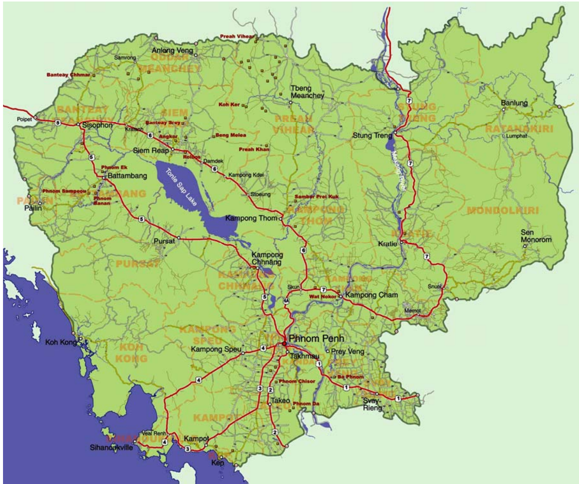
Figure 1. Cambodia, with national roads in red, provincial roads in yellow and white, minor roads in gray.

the location of those that might be nearby. Three to seven such informants are sought out each day over several days in larger locations. A map of Cambodia is available in Figure 1.