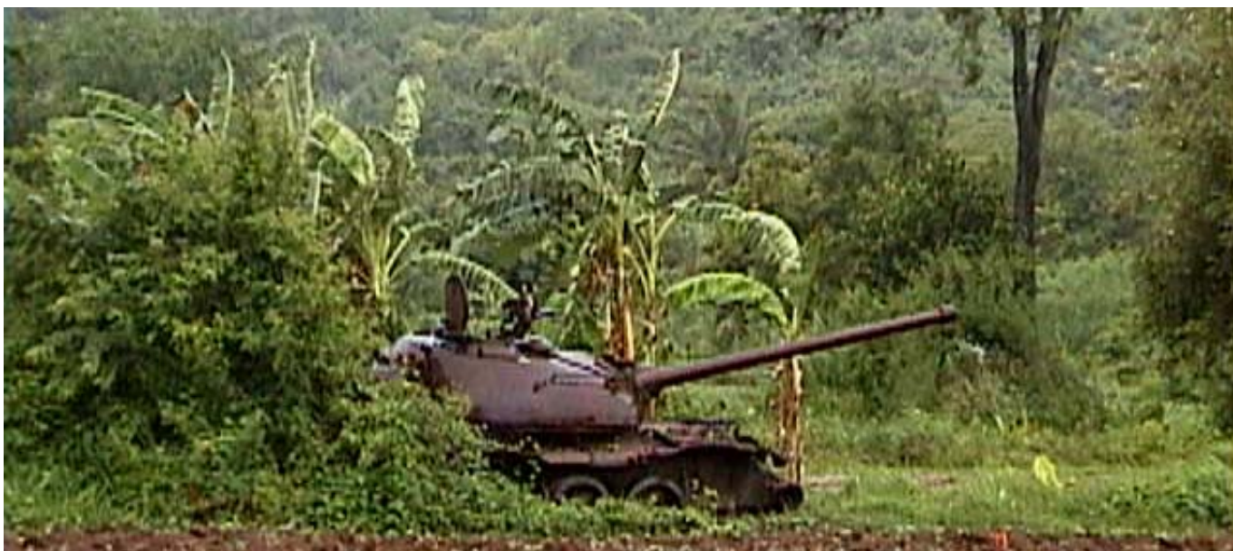
Remnants of the 1975-1979 Vietnamese War against the Khmer Rouge, not far from a brothel area in Western Cambodia

unconscionable actions of the Khmer Rouge. In addition to locations in Phnom Penh, reminders of that past that cannot begin to capture the horror of the time remain scattered across the rural landscape of Cambodia.