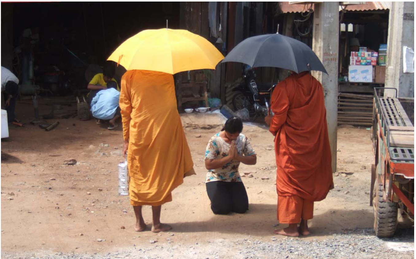
Shop owner provides food to monks across from a market and nearby brothel. The arousal of desire by a sex worker may create bad karma, but neither sex nor charging for sex are branded as necessarily evil in traditional Buddhism unless the woman is married.

Trafficking for domestic servitude is a good candidate for future research on trafficking in women and children, as Derks, et al., (2006) mention. The spread of the potential problem, with a few people in large numbers of households across urban and rural Cambodia, presents a challenge to confront. Labor trafficking, aside from sex trafficking, is another strong possibility within several industries, including seafaring labor. Many of these labor areas employ male laborers, while domestic workers are often female.