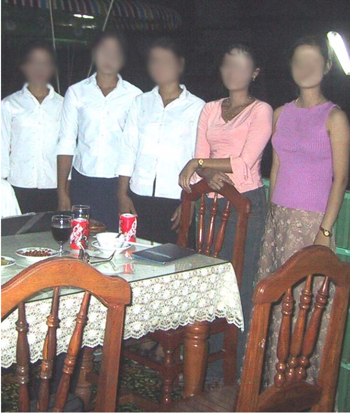
Beer promotion workers in Central Cambodia

desired sex with whom they converse and have a good time and who chooses to leave with them.