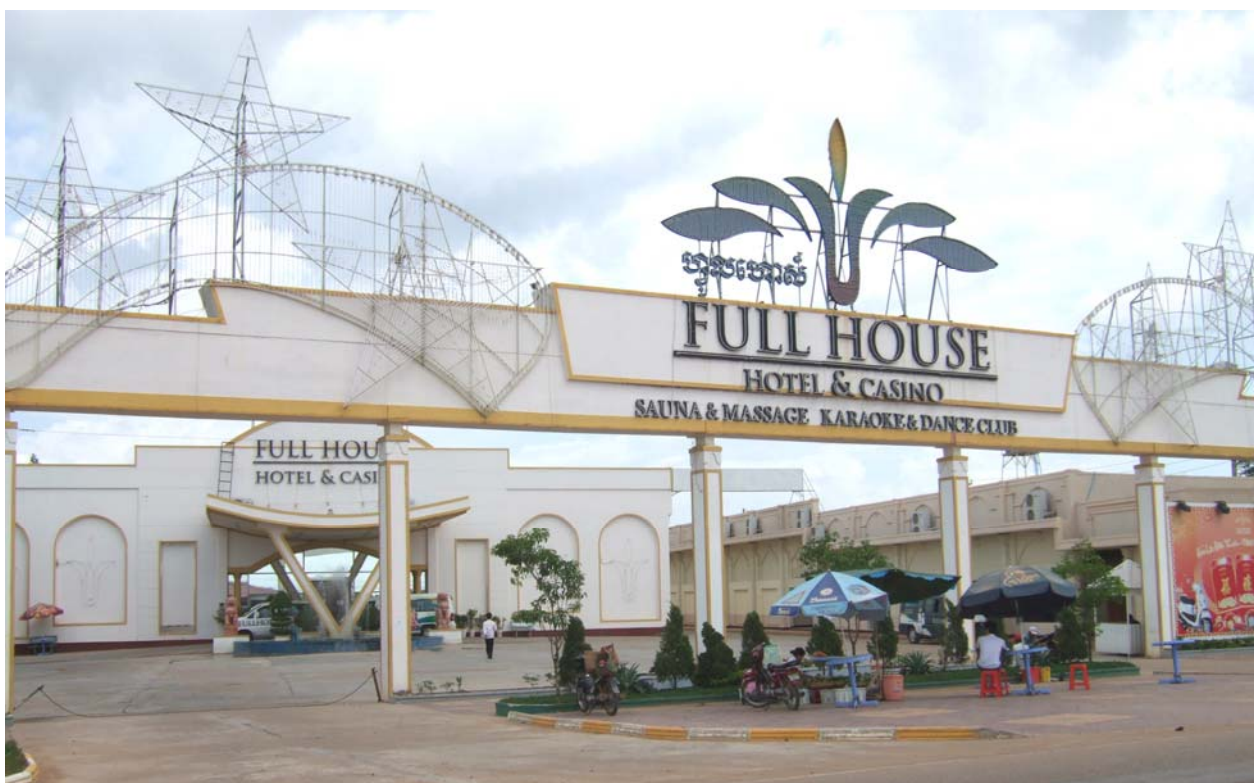
While casinos often discourage sex workers near the tables, some advertise typical sex work venues as part of the casino complex.

casino that might be provided by sex trafficking. If trafficking should exist in some form in some casinos and escape detection, its limited size should not materially affect the number of trafficked individuals. The sex workers observed in or near casinos proper are listed as freelance.