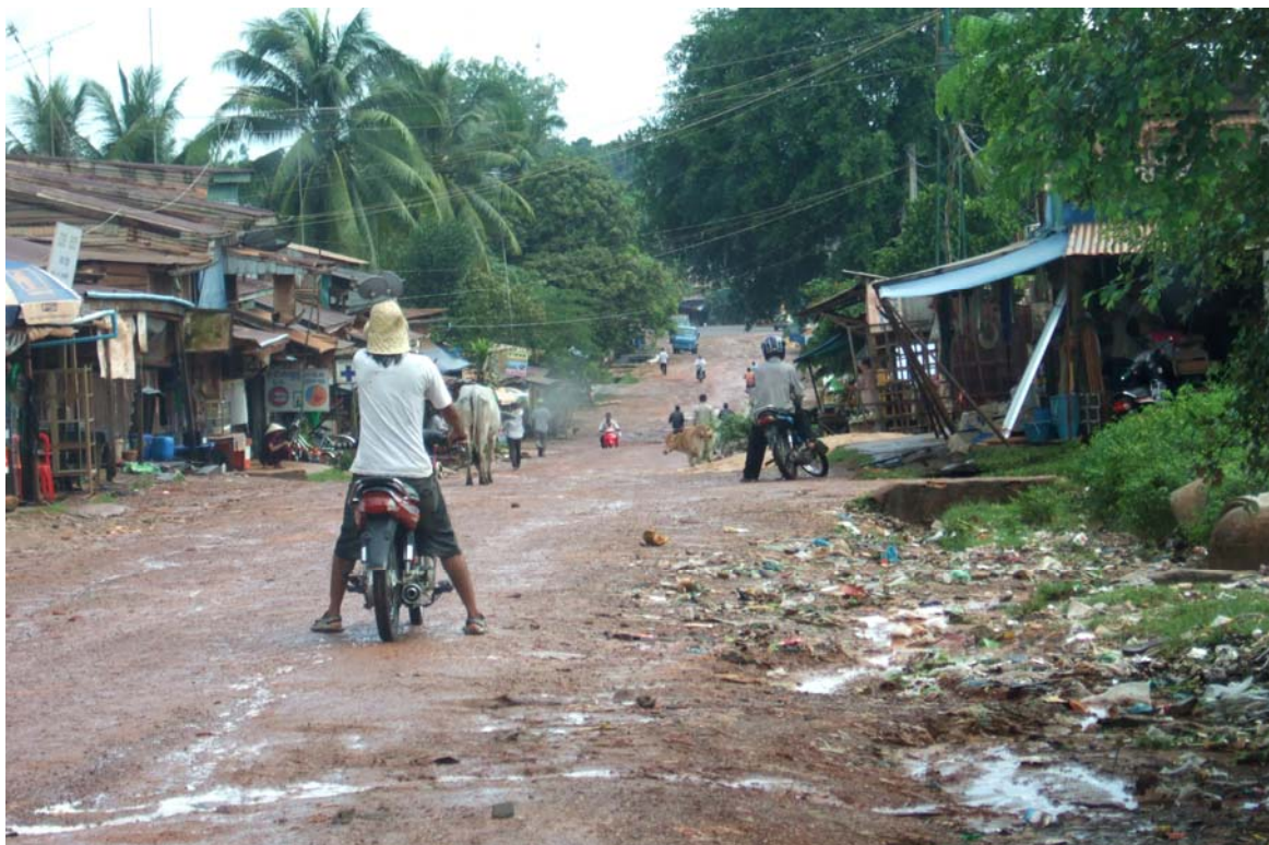
Street in Southwest Cambodia town with brothel on left near approaching red moto.

Results from the 2002, 2003, and 2008 studies are generally consistent with the findings of other empirical studies, though the method, focus, and level of detail vary across the other studies. Derks, et al., (2006) review many of these reports. The relative congruity regarding numbers of workers among empirical studies provides a level of validation across their methods and results. Numerical estimates offered by groups and individuals without benefit of a study to support them are seldom consistent with empirical results, especially when the estimator has something to gain financially or emotionally from the size of the estimate.