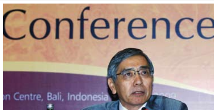
President of the Asian Development Bank (ADB), Haruhiko Kuroda, talks to journalists during a press conference after the closing of the 42 nd ADB annual meeting in Nusa Dua on the resort island of Bali on May 5, 2009. The Asian Development Bank is embarking on a huge expansion of its lending activities.

Asian attempts at crisis management came too late, according to Regling. Japan, Korea, and China met on the sidelines of the G-20 summit in Washington, DC in November to underline their commitment to financial cooperation. Asean