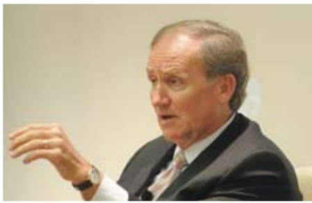
Robert M. Kimmitt Former Deputy Secretary of the US Treasury

World leaders must resist the urge to retreat into protectionism amid the global economic crisis, Kimmitt said. Leaders must find a balance between prudential regulation and market discipline, reform the global financial architecture, and back up their commitment to free trade and open investment as guiding principles of a healthy global economy. These issues must be interwoven with on-going crisis management discussions and decisions.