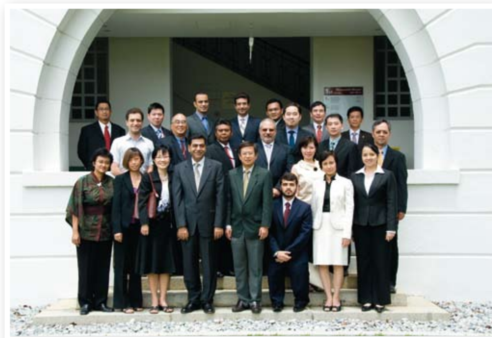
Participants of the programme on Developing Clusters and National Competitiveness

THE ASIA COMPETITIVENESS INSTITUTE (ACI) conducted its flagship programme on Developing Clusters and National Competitiveness (DCNC) on April 20 – 24. This was the second time ACI's open-enrolment programme was organised in collaboration with the LKY School's executive education department.