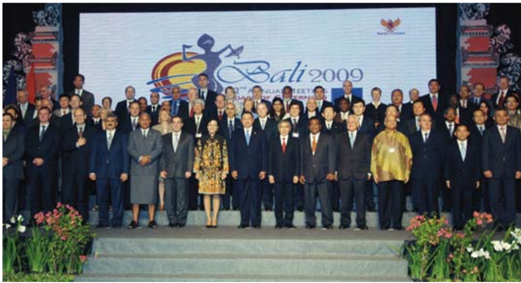
Indonesian President Susilo Bambang Yudhoyono (front centre) and attending finance ministers pose for a group photo during the opening of the 42 nd Asian Development Bank (ADB) annual meeting in Nusa Dua in Bali on May 4.

REGIONAL COOPERATION in Asia has received a new impetus as the region's export-dependent countries try to address the steep decline in trade and financing during the global economic crisis. While recent initiatives have been lauded, a lack of clear leadership and weak institutions are obstacles to developing an Asian influence on the restructuring of the global economic architecture and establishing regional support mechanisms, experts at the Lee Kuan Yew School of Public Policy said.