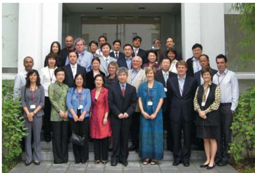
Workshop participants including delegates from the LKY School, the Asia Foundation, Mexico, the United States, Singapore, China, Korea, Vietnam and India.

THE ASIA FOUNDATION and the Centre on Asia and Globalisation (CAG) of the LKY School jointly hosted the International Workshop on Transparency and Access to Information from March 4 – 6. The event brought together academics, civil society members, and government officials from around the world to discuss the use of transparency regulation in strengthening local governance.