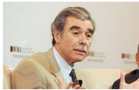
Carlos M. Gutierrez Former US Secretary of the Department of Commerce

Proposed measures to close tax loopholes in the US by preventing US multinational companies from keeping profits in foreign companies in order to defer tax payment are likely to reduce foreign direct investment to Asia, Gutierrez said. The proposals are likely to lead to more double taxation of foreign profits.