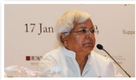
Lalu Prasad Minister for Railways, Government of India

Indian Minister of Railways Lalu Prasad told a standing-room-only audience the story of how he engineered the dramatic turnaround of railways with a budget of just $200 million when he took the top post of this national institution in 2004. The revival of the railway behemoth is now a popular case study in policy and business schools around the world. Prasad rejected advice from the World Bank to increase fares, layoff employees, and privatise the core business of the organisation. Instead, he kept the railways' 1.4 million employees, reduced fares, improved efficiency, and started partnerships with private companies.