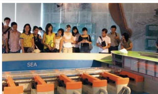
Students visit the Marina Barrage