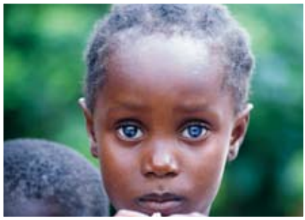
Blue-eyed girl, Liberia

THE LKY SCHOOL HOSTED the “People of Liberia” photo exhibition by UN Fellow Lino Sciarra on