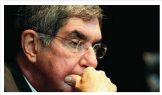
Oscar Arias Sanchez, President of the Republic of Costa Rica

The President of Costa Rica presented his initiative “Peace with Nature,” an invitation to all the countries of the world to unite and make a consolidated effort to strengthen their actions and political commitment to reverse the trends of environmental degradation caused by the impact of human activities on the planet’s ecosystems.