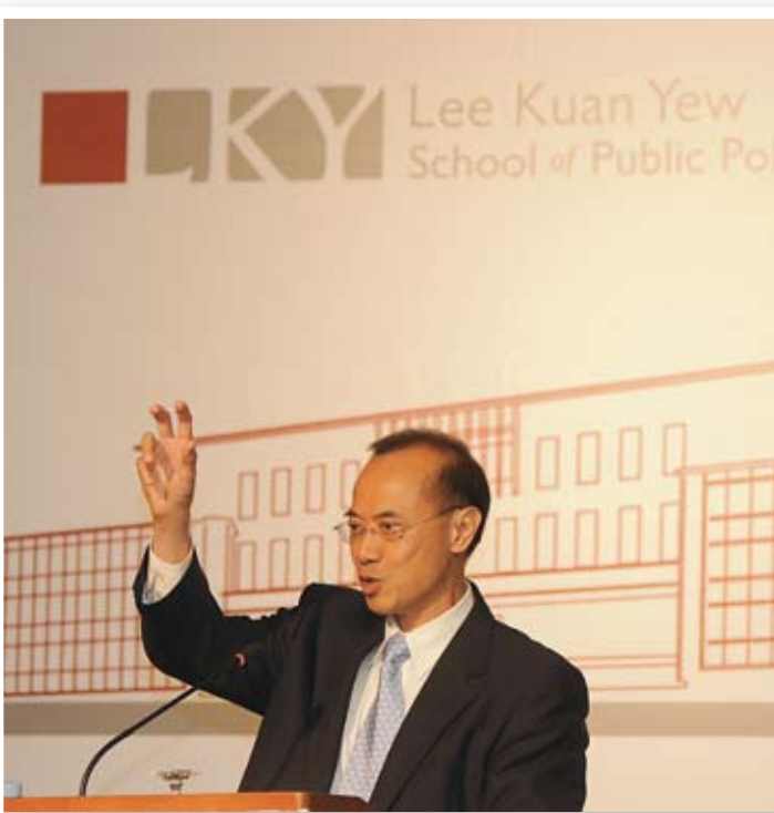
■ George Yeo, Singapore’s Minister for Foreign Affairs.