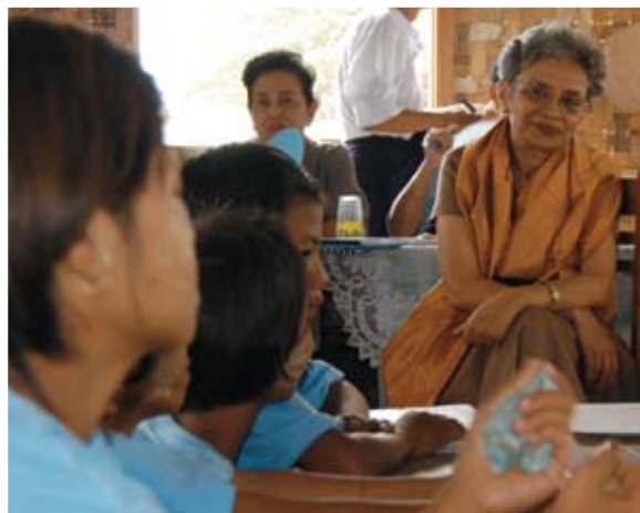
Anupama Rao Singh, Regional Director, UNICEF East Asia and Pacific Office, visits a Unicef programme at A-latt-chaung village across Rangoon River, Myanmar

Children all over the region will be affected since they are the most vulnerable members of society. The East Asia and the Pacific Island economies are extremely diverse and every nation is being hit by this crisis in different ways. Thailand and Singapore are dealing with the fall-out of their export-oriented policies, while the Pacific Island nations, which are extremely isolated, are having to deal with higher fuel costs for their imports.