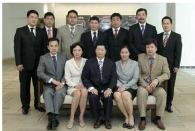
Executive Programme on Good Governance Capacity Building for Mongolia December 8-12, 2008

Mongolia is very interested in expanding cooperation and relations with other Asian countries, including Singapore, Gansukh said. In January of 2008, Mongolia upgraded its Consulate General in Singapore to a full embassy. gisa