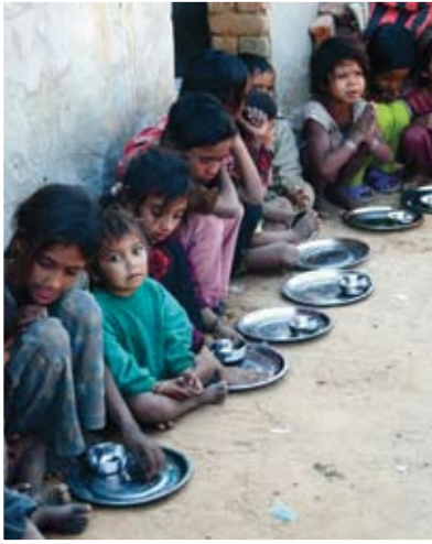
Street children in Jaipur, India

ASIAN GOVERNMENTS must find ways to increase their support for women and children even as government revenue dwindles during the global financial crisis, officials from the United Nations Children's Fund (Unicef) said at a conference held at the LKY School on January 6–7.