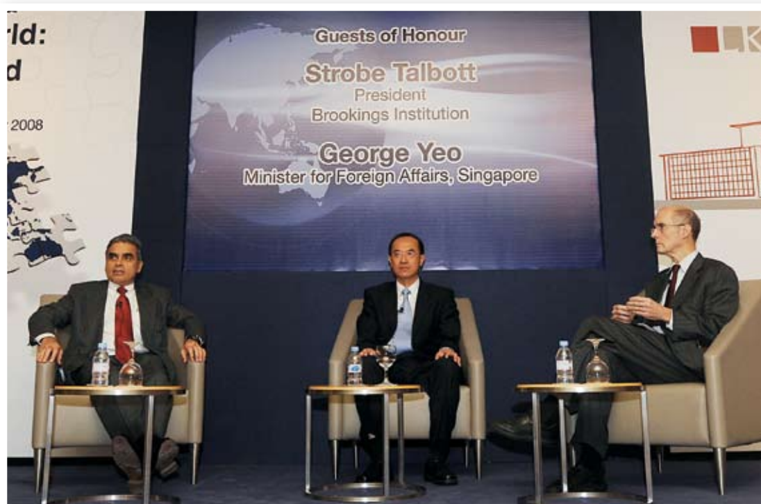
■ Kishore Mahbubani, George Yeo, and Strobe Talbott at the S.T. Lee Project on Global Governance conference

"When we talk about global governance, when all is said and done, it has to be built around the human being – respect for human beings, respect for the diversity of human beings," he said.