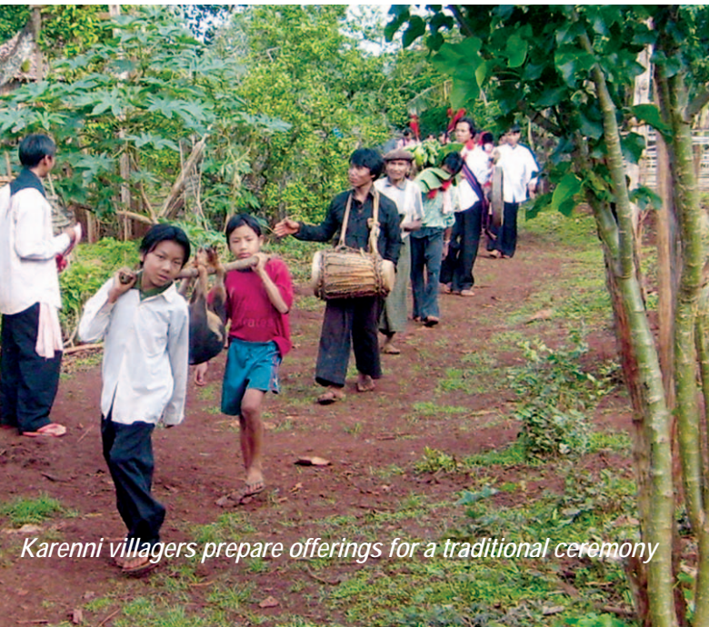
Karenni villagers prepare offerings for a traditional ceremony

The Salween is a sediment-rich river, providing vital nutrients to gardens and farms along its banks for hundreds of kilometers downstream and helping to sustain the nearly ½ million people living in the Salween's delta area of Mon State, an important rice-producing region. The dam will block these sediments from reaching the farms that need them, decreasing productivity and impacting food security.