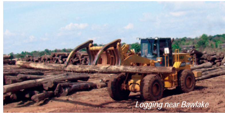
Logging near Bawlake

Logging has recently been increasing in the area of the Ywathit dam; there are logging camps and saw mills along the Salween all the way to the Shan State border. These forests are in the bio-diverse ecoregion of the Kayah-Karen Montane Rainforests. Both dams will also negatively impact fisheries; the Salween is home to at least 47 species that can be found nowhere else in the world.