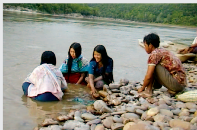
Yintale people at the Salween River