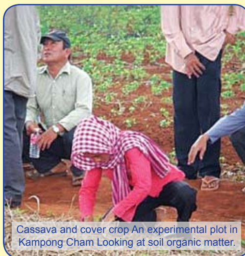
Cassava and cover crop An experimental plot in Kampong Cham Looking at soil organic matter.

DMC techniques are adapted for most Cambodian agro-ecosystems and in particular for plains areas. These systems are also more climate change resilient than traditional agriculture. The first demonstration plots and training activities are currently taking place in Kampong Cham and Battambang provinces. In 2009, 40 ha of demonstration plots and 100 ha of farmers' plots were cultivated under DMC techniques. For 2010, the DMC network will increase with further private sector involvement.