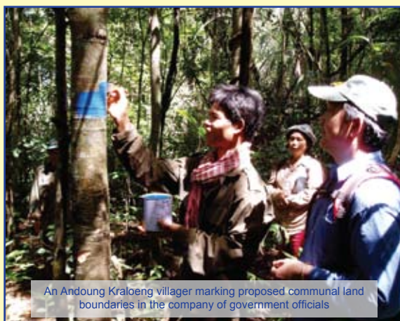
An Andoung Kraloeng villager marking proposed communal land boundaries in the company of government officials

Cambodia's indigenous ethnic minority groups mostly live at the mountainous fringes of the country. Many live within or close to protected areas with high cultural and environmental value. However, these communities also experience high levels of poverty and are often heavily dependent on common-property natural resources such as forests, fisheries and the fallow lands of their shifting cultivation cycle.