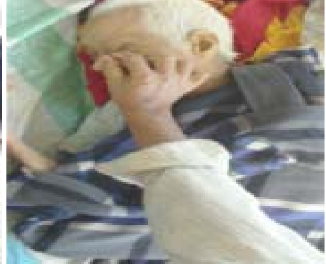
Relief Distribution to Giri affected community