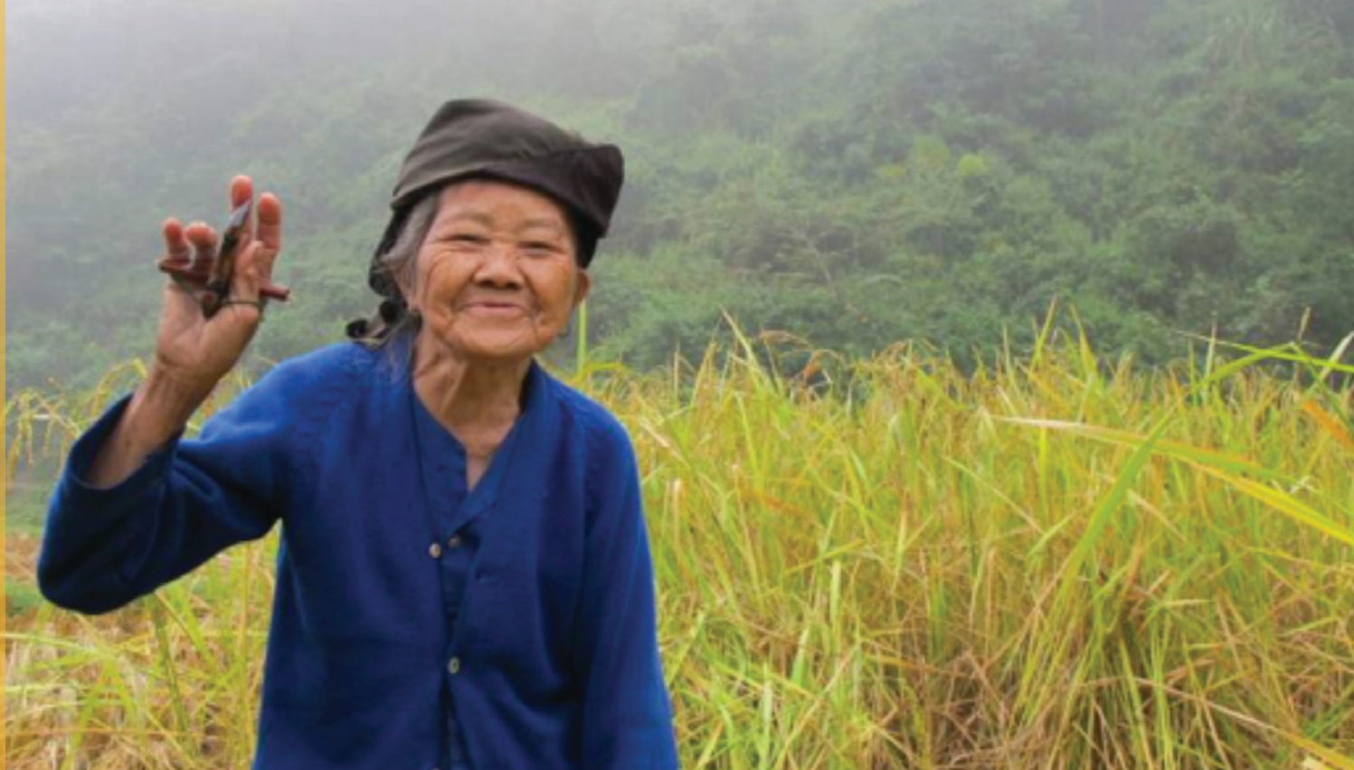
Woman in Bac Kan holding traditional tool to cut hill-rice.