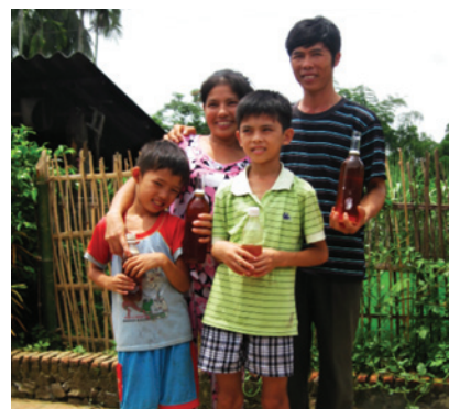
Family holding honey bottle, Thanh Hoa.

The positive outcomes from some specific disaster risk reduction projects by non-government organisations, including international agencies, are operating in the northern mountainous region but have not yet been replicated by the local authorities on a broader scale.