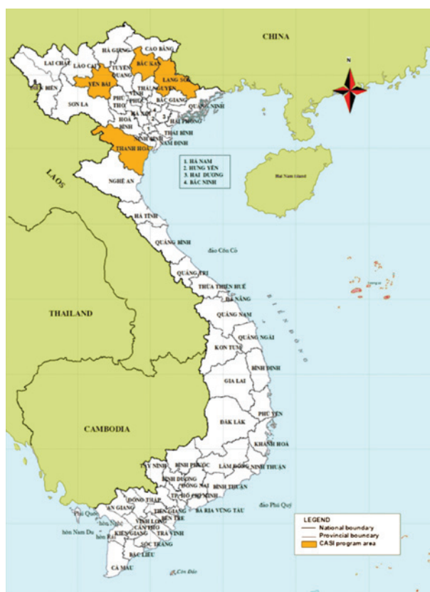
Figure 1: CASI project areas shaded in orange

The ethnic groups that inhabit the province are Tay 54%, Dao 16.5% and Kinh 13%. The remainder are Nung, Hmong and smaller groups. Bac Kan has one main town, seven rural districts, four precincts, six sub district towns and 112 communes.