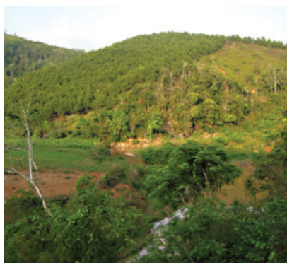
Typical view of mixed use landscape, Pac Giau, Lang Son.