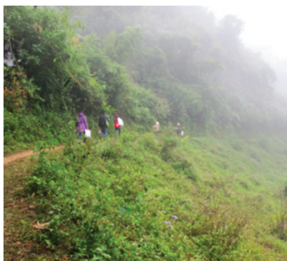
Typical village access road in Bac Kan