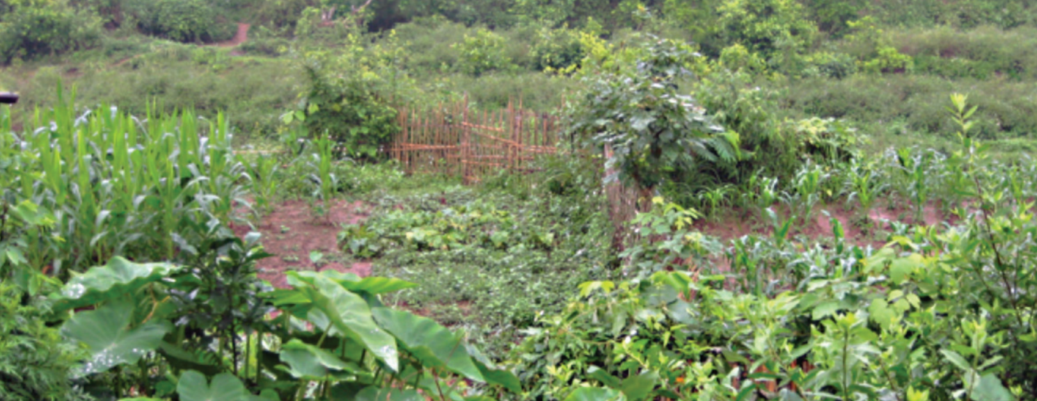
A typical home garden in the project area in Lang Son.