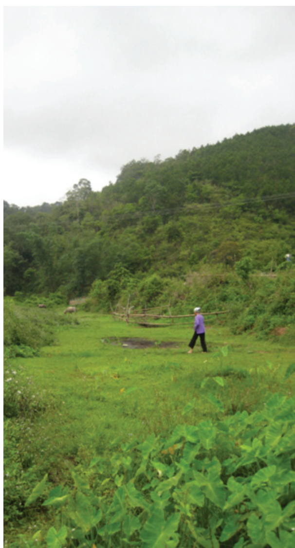
A field left fallow because of flash flooding in Pac Giao Lang Son

Both hot and cold extremes were frequently cited as of concern to villagers. These result in lost production days whilst waiting for the extremes to pass, as well as crop loss depending on when in the cropping cycle the extremes occur. There was also a common concern about the impact of temperature extremes on human health. Children were frequently sick in the hot weather after playing in dirty water, and during cold snaps they often came down with colds, coughs and fevers. Women were unable to work in the field or collect forest products in these situations, leading to lost productivity. In addition, temperature extremes were also linked to animal disease and mortality, increases in pest outbreaks (such as chicken mites) and damage to stored food. Prolonged cold spells also increase the need for firewood. This adds to the burden on women and female children, who may spend up to two hours a day collecting firewood, as well as increased forest degradation.