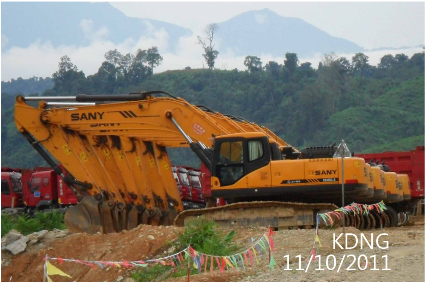
Trucks and machines are sitting and ready at the Myitsone dam site