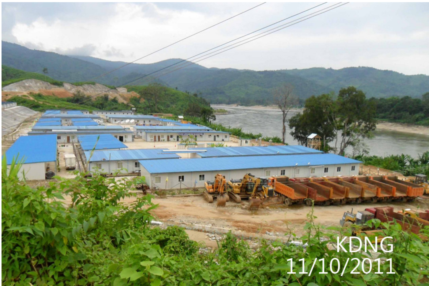
Trucks and machines are parked and ready at Chinese workers' compound