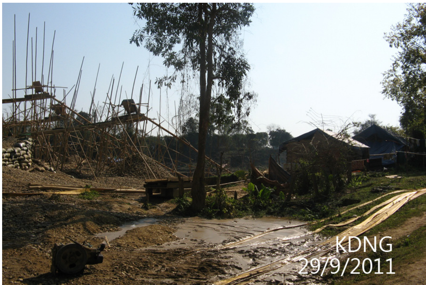
Gold mining on the river banks at the Myitsone dam site