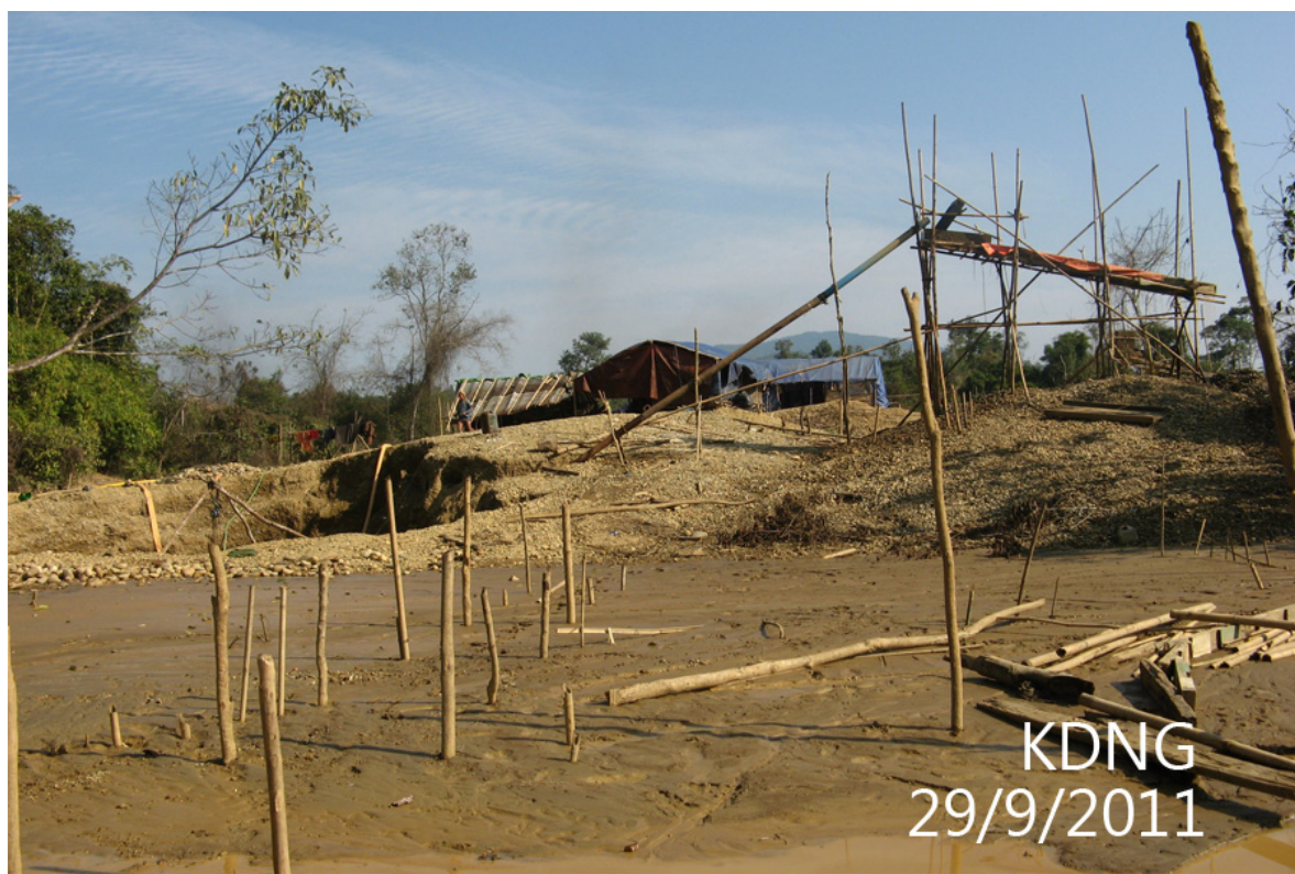
Gold mining on the river banks at the Myitsone dam site