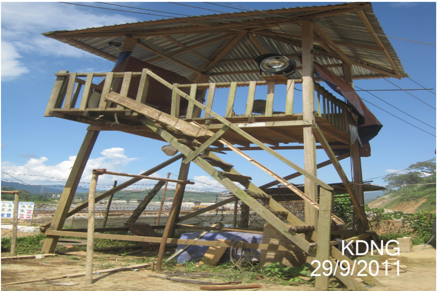
A guard tower equipped with security cameras is stationed at all construction sites