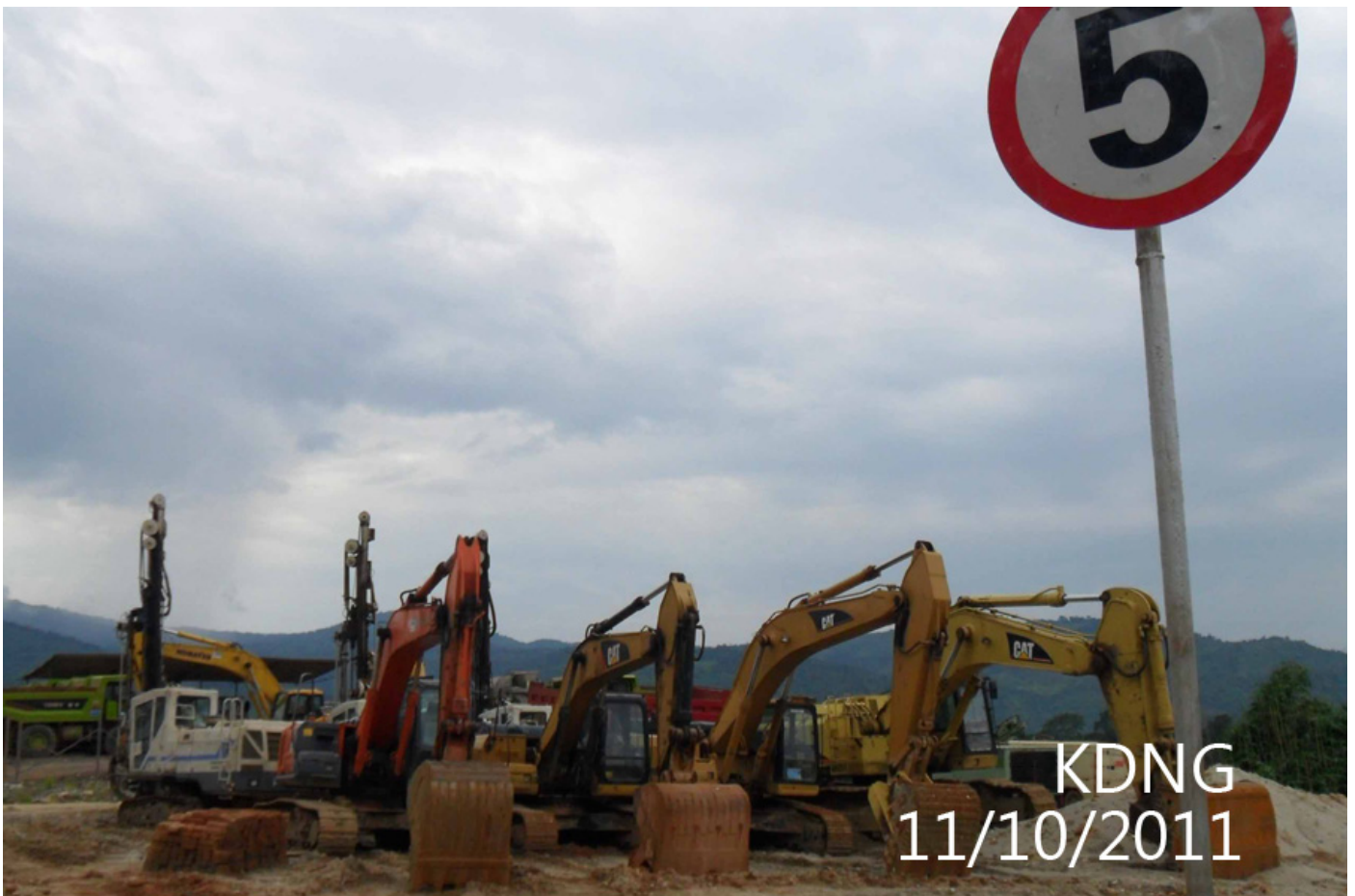
Machines at Construction Site No. 5