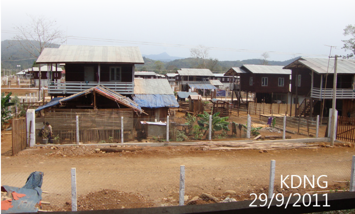
Houses at Aung Mye Tar relocation camp, 4.3 miles downstream of the Myitsone

"I don't know what will be our future. We don't know what to do for our livelihood in this camp, there is no space. Everyone is worried for their future. We are staying here not because of our will and not because we are happy. I feel like I've just travelled to one place and waiting to go back home. We are praying to go back to our old village. After just one year the roof is already leaking and the floor is breaking in this house. I feel like we are living in the desert." - Resident of Aung Mye Tar relocation camp, 11 October 2011