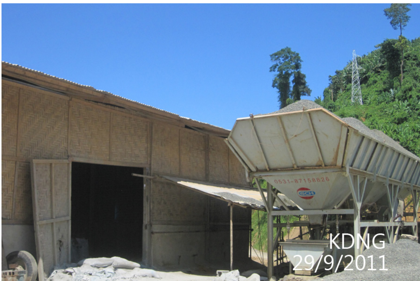
A factory for breaking stones and making bricks at Construction Site No.7.