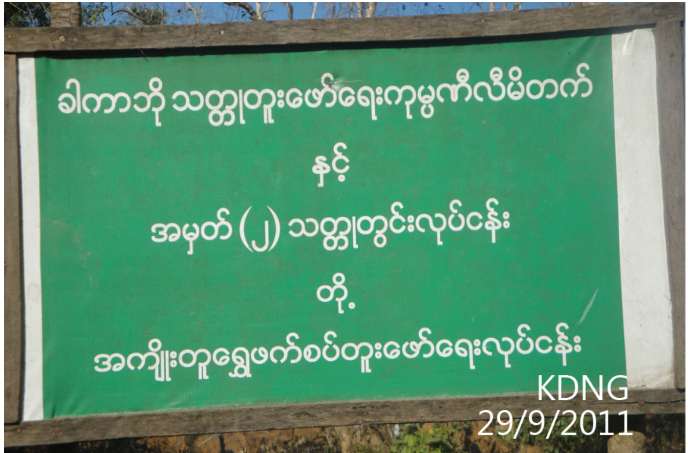
Hka Ka Bo Mining Co. Ltd. and the government's No (2) Mining Ministry have a joint venture to mine for gold at the Myitsone

Mining and logging concessions were given after dam plans were announced in order to clear out the dam and reservoir areas. Large scale gold mining began in 2010 and continues today. Mercury and cyanide used in the processing of the gold is dumped without regulation into local rivers and directly into the Irrawaddy, threatening downstream populations with exposure to toxins which leads to health problems and birth defects.