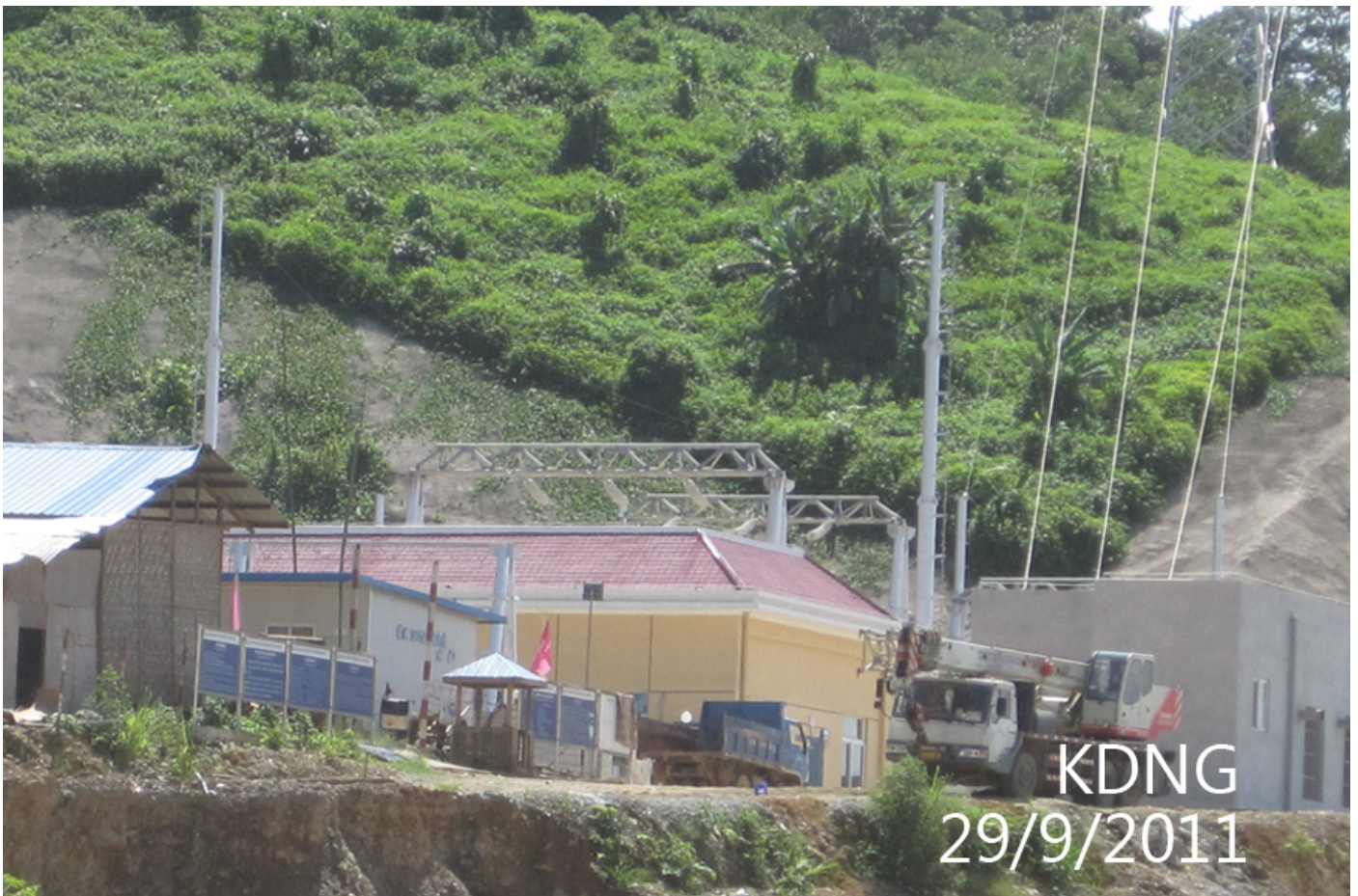
Power relay station to transfer electricity for construction activities at the Myitsone dam site