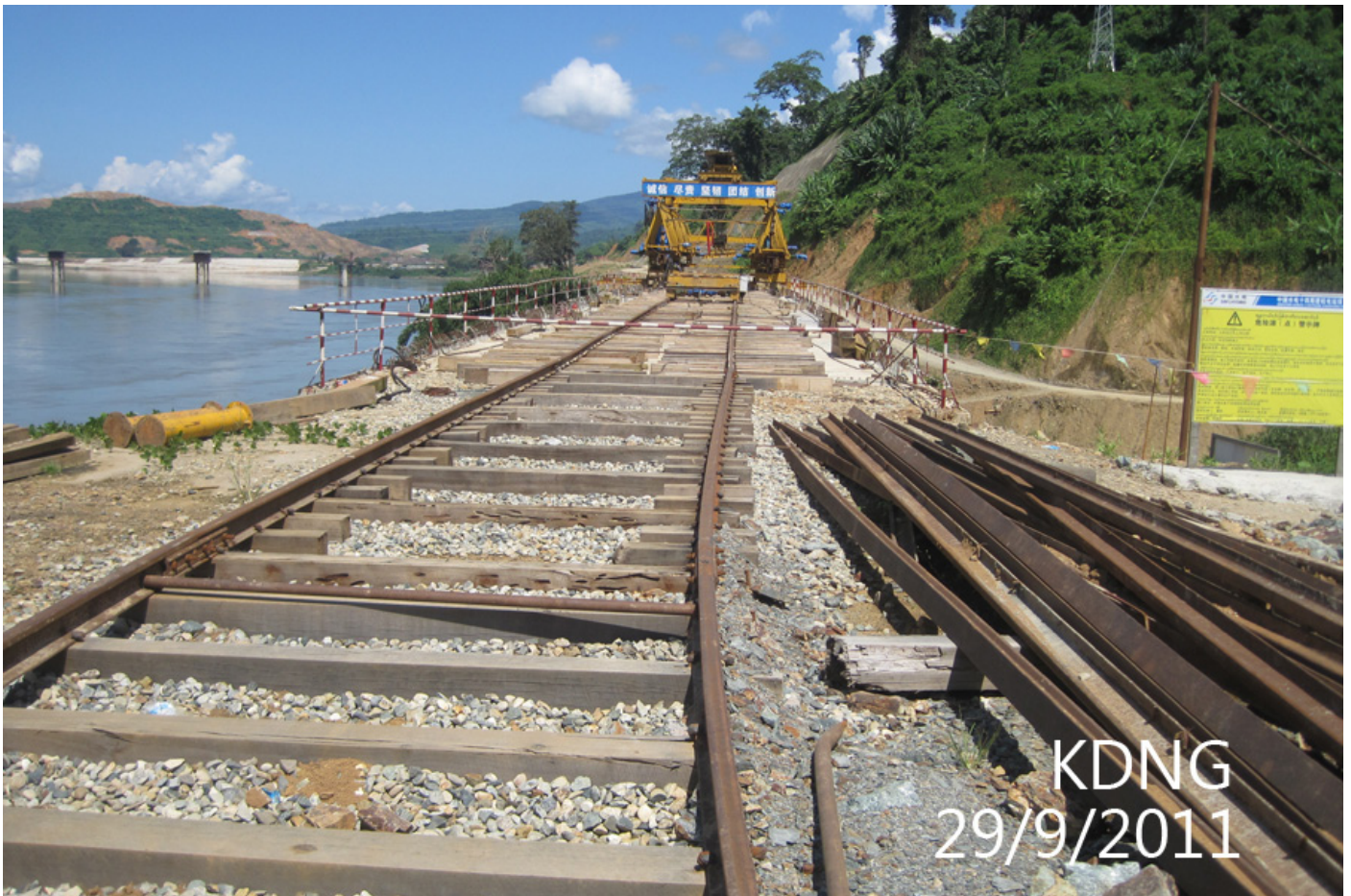
A railway to transport equipment and materials between construction sites at the Myitsone Dam