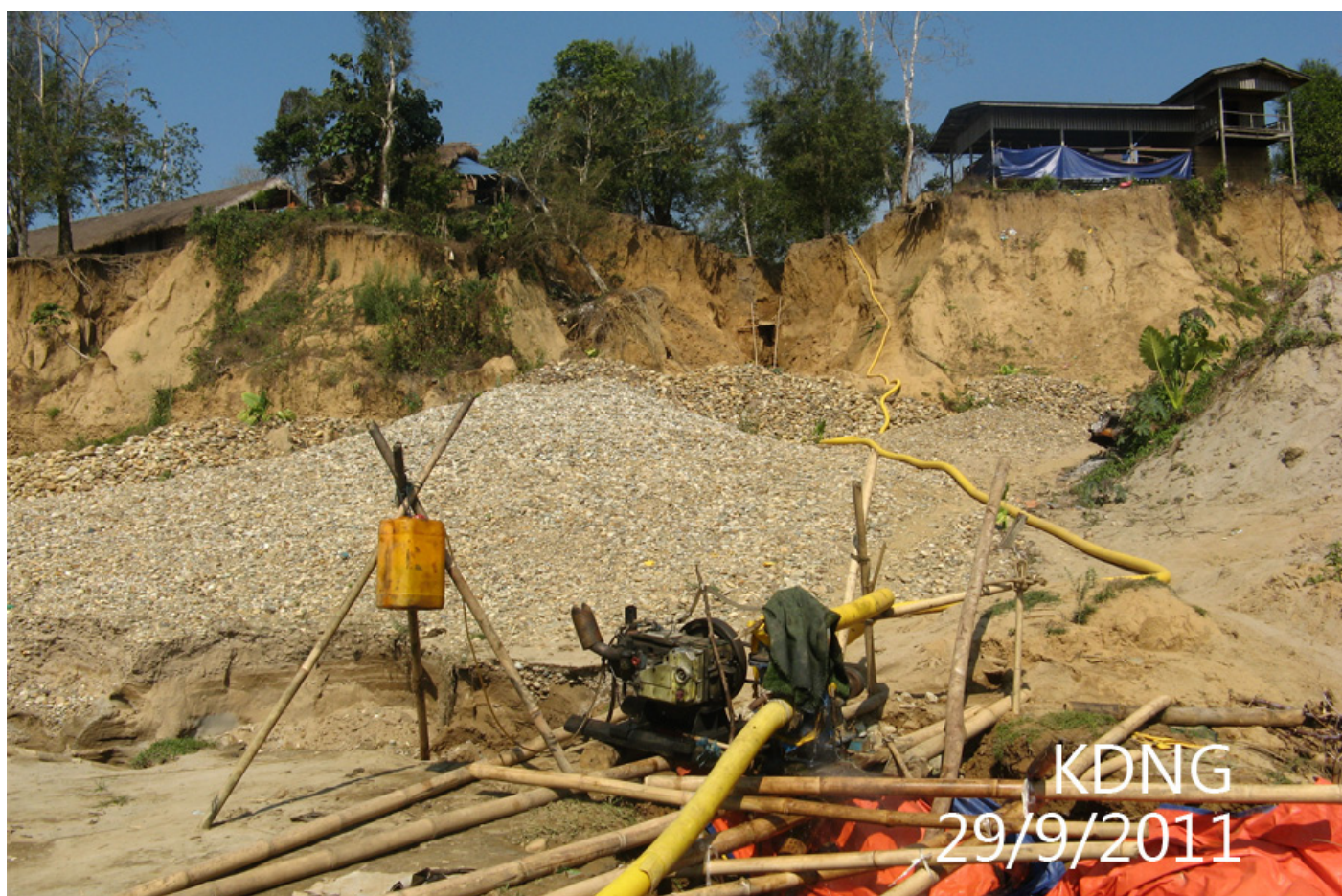
Gold mining on the river banks at the Myitsone dam site