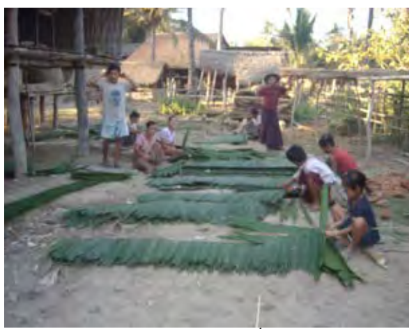
This photo, taken on February 15<sup>th</sup> 2011, shows L---villagers in Dweh Loh Township, Papun District, producing thatch shingles in front of the L---village head's house. The village head is visible standing in the foreground in the photo on the right. The villager who took this photo reported that Tatmadaw Border Guard Battalion #1013 Commander Maung Soe Myay demanded 8,000 thatch shingles from L---village. <sup>288</sup> [Photo: KHRG]

This photo, taken on January 9<sup>th</sup> 2011, shows M---villagers portering rations to Gkleh Muh Htah Border Guard camp from M---village on the order of Tatmadaw Border Guard Battalion #1013. According to the villager who took this photo, Kyaw Beh, a Battalion #1013 officer, ordered each household in M---village, Dweh Loh Township, Papun District, to provide one porter without fail. Approximately 50 M---villagers portered rations to the camp at Gkleh Muh Hta on January 9<sup>th</sup>. <sup>287</sup> [Photo: KHRG]