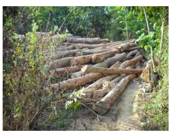
This photo shows another logging operation carried out by Border Guard Battalion #1011 in the area of M--- and R--- villages, P--- village tract, Lu Pleh Township, Pa'an District. The villager trained by KHRG to document human rights abuses who took this photo reported that villagers in this area have been forced to serve as guides to help Border Guard soldiers locate trees suitable for felling, to cut and carry trees, and to construct shelters.