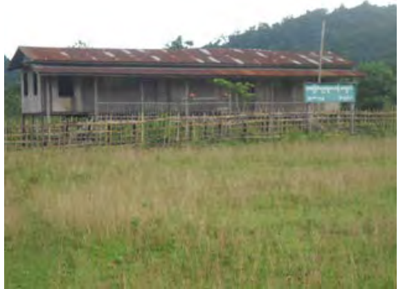
The photos above show abandoned residences and other buildings in P--- village, Pa'an District, including the P--- village high school (top left) and primary school (bottom right). According to the villager who took these photos and wrote this report, on July 15<sup>th</sup> 2011, Tatmadaw Border Guard commanders ordered residents of P---, along with residents of L---, N---, B---, A---, M---, W--- and K---, to relocate to a designated site within five days. According to the same villager, the P--- village schools served the children of at least five villages, including B---, A---, M---, W--- and P--- villages, before residents were forced to relocate.