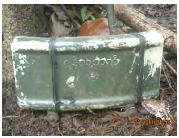
These photos show factory-produced claymore mines; the villager who took these photos reported that these mines were provided by the Tatmadaw to Border Guard Battalion #1015, which planted the mines near the gate of Battalion #1015 camp at R---, Pa'an District. In the photo at right, the Burmese inscription 'yan thu bet' translates as 'enemy side' or 'side facing enemy'; in the photo bottom right, the inscription 'shay twet

<sup>144</sup> This is an excerpt from an unpublished situation update written by a villager in Dooplaya District and received by KHRG in January 2011.