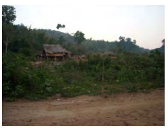
These pictures, taken on April 8<sup>th</sup> 2011, show Khaw Klaw village, Dweh Loh Township, Papun District, which is located beside the Meh Gkleh Law River. The villager who took these photos reported that villagers living in areas adjacent to the Meh Gkleh Law River were relocated to Khaw Klaw village on the Meh Gkleh Law riverbank after August 2010, when the DKBA commenced gold-mining activities in the river. Even though the DKBA mining operation in the Meh Gkleh Law River is no longer active, villagers continue to live in Khaw Klaw due to the presence of landmines in their original villages.