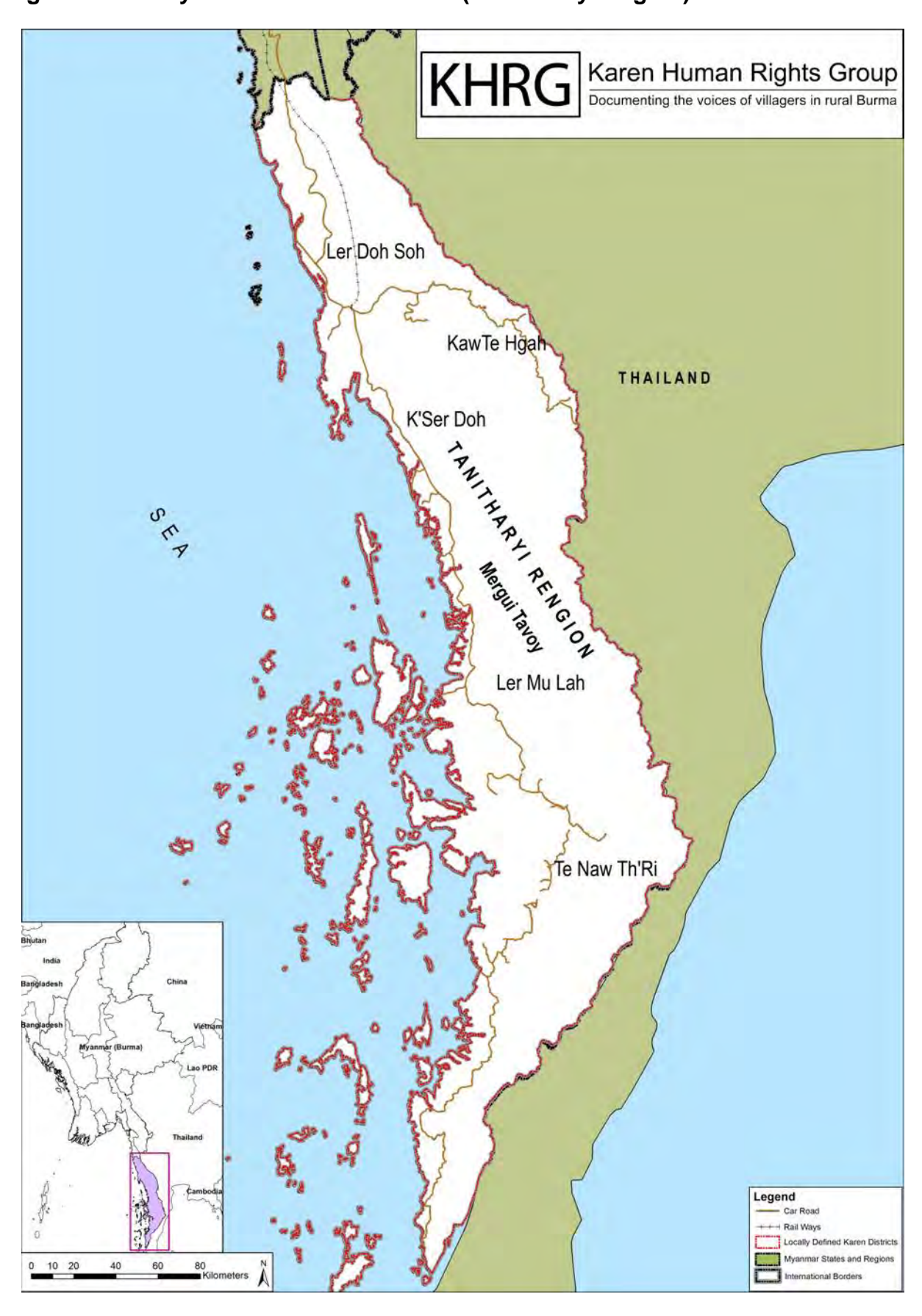
Figure 2: Locally-defined Karen districts (Tanintharyi Region)