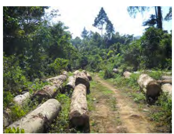
This photo shows a logging site in the Mae Ta Woh area of Pa'an District controlled by Captains Pah Daw Boe and Officer Pah Ta Gkee of Border Guard Battalion #1011. The villager trained by KHRG to document human rights abuses who took this photo reported that villagers in the area were forced to provide unpaid labour at this site, performing duties which included sawing and transporting wood to lumber trucks. <sup>284</sup>