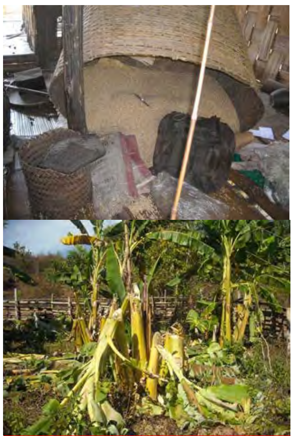
These photos, taken on February 26<sup>th</sup> 2011, show damage to the food supply and agricultural and cooking equipment perpetrated by Tatmadaw LIB #252 during the attack on Dteh Neh village, Lu Thaw Township, Papun District. <sup>97</sup>

not be clear out of context and without the interviewer's questions. See: "Tenasserim Interview: Saw K---, August