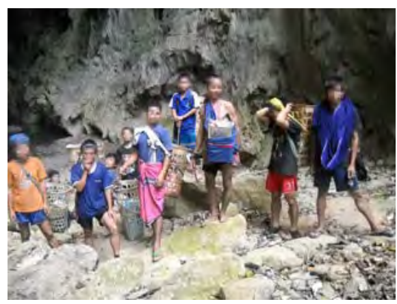
The photo above shows residents of R--- village, P-- village tract, Lu Pleh Township, Pa'an District, travelling covertly to access medical assistance. <sup>219</sup>

Villagers in five of the seven research areas<sup>223</sup> raised concerns that they were prevented from accessing humanitarian goods or services, due to restrictions on the transport of food and