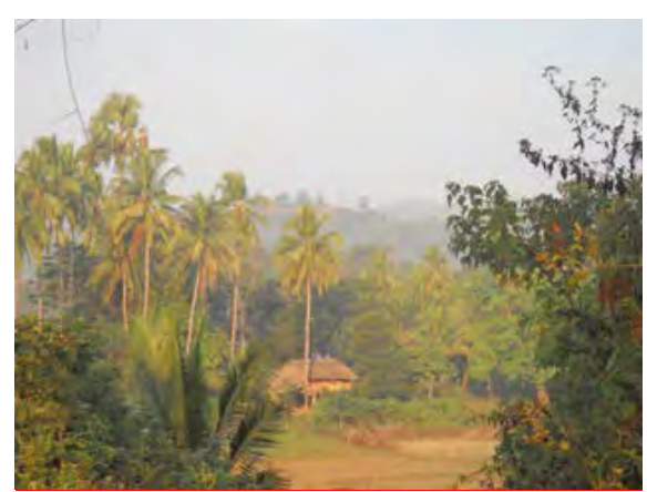
The photo above left shows a Tatmadaw camp situated on an elevated location near T--- village, which is depicted above right. The villager who took these photos reported that, on March 7<sup>th</sup> 2011, Colonel Zaw Win from TOC #2 of Tatmadaw MOC #19 ordered villagers living in upland areas adjacent to the camp to relocate to T--- village. Villagers who did not have land to build a house in T--- village were ordered to pay 300,000 kyat (US $407) while all residents of T--- village were ordered to pay 150,000 kyat (US $203) for a plot of land on which to build a house in the relocation site.

information from Pa'an District, including two incident reports, 11 other interviews, two situation updates and 155 photographs. ^{313} "Pa'an Situation Update: April 2011," KHRG, September 2011.