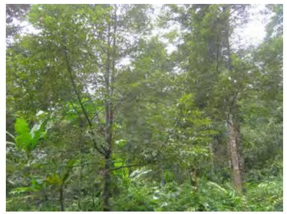
These photos, also taken on September 30<sup>th</sup> 2011, show more agricultural projects in Je--- village, Kawkareik Township, Dooplaya District, among the 167 acres of land that local Tatmadaw forces planned to confiscate in Je--- village, according to local villagers. The photo at left shows a three-acre betelnut and durian plantation owned by Saw A---; the photo at right shows a three-acre durian plantation containing approximately 400 durian trees belonging to Saw D---. <sup>346</sup>