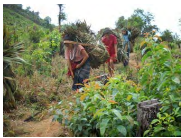
The two photos above show residents of Gk--- village in Lu Pleh Township, Pa'an District, carrying loads of palm leaves to logging sites operated by Border Guard Battalion #1011. According to the villager who took these photos, Gk--- villagers transport the palm leaves to the logging sites, where they also have to build huts, make thatch shingles using the palm leaves, and roof the huts with the thatch shingles.