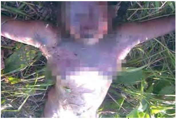
This photo was taken on December 22<sup>nd</sup> 2010 near the Waw Lay village school in Kawkareik Township, Dooplaya District, by a villager trained by KHRG to document human rights abuses. The villager estimated that the woman, who appeared to be between the ages of 20 to 30, had been killed approximately two days previously.

Incident report written by a villager, Than Daung Township, Toungoo District (April 2011)<sup>48</sup>