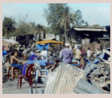
During (top) and after (bottom) the first Tonle Bassac fire of 2001. The Municipality's handling of the crisis eroded the trust of squatter area residents and spurred urban groups to initiate the Resettlement Action Network.

it is, we can assert that the participation of civil society in policy formulation has become one of the rules of the game. The third impact area examines changes in the capacity of individuals, grassroots organizations, and NGOs to conduct advocacy. Since this report focuses on campaigns, it does not measure the impact of policies in the implementation phase.