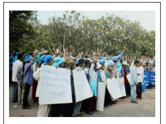
An indication that the Cambodian labor movement is gaining strength: garment workers organize and demonstrate in front of the Council of Ministers demanding better working conditions, February 2000.

The labor movement in Cambodia is an example of outside actors identifying a problem