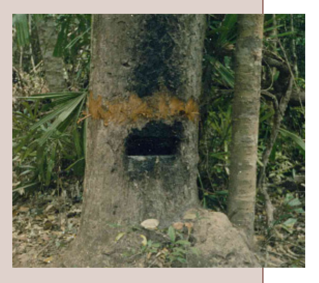
province. Increasing forest concessions and privatization of forest lands risks villagers' livlihoods.

Local villagers depend on income made from tapping resin trees like this one in Kratie