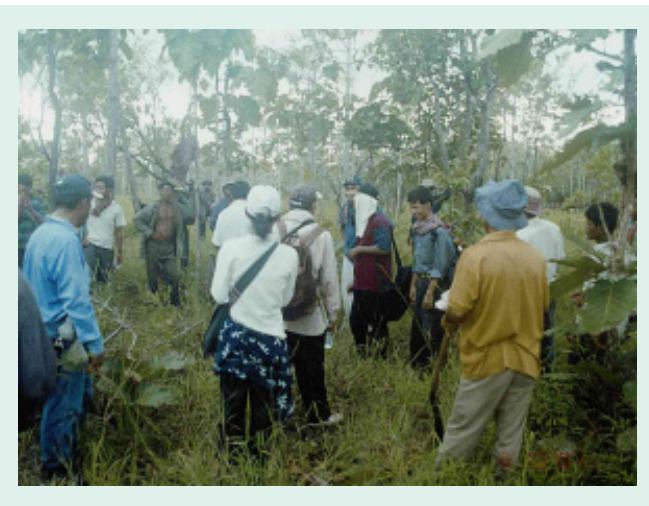
The NGO Forum's environmental working group organized a field trip to Ansachambok, Pursat province for journalists and NGO staff. The purpose of the trip was to visit an example of a healthy forest.

The media's presence at an event has a direct effect on government behavior: when their words are being recorded in print or on videotape, officials know that they must be more restrained