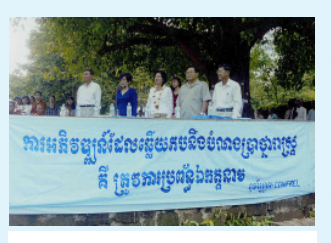
EMOs held a public forum before the commune council election in Kampong Cham and invited parliamentarians to participate, 2001.

The original objectives of this campaign were not met, yet the issue attracted considerable press through a strategic media campaign. Efforts were slightly weakened when ideological differences prevented the EMOs from presenting a unified front at times. The most valuable lesson for these advocating organizations, which are not traditionally community-based NGOs, was the sense of legitimacy they gained from conducting the public polls that gave strong credence to popular demand for a direct electoral system. Other lessons learned include the need to think more strategically before implying that the EMOs