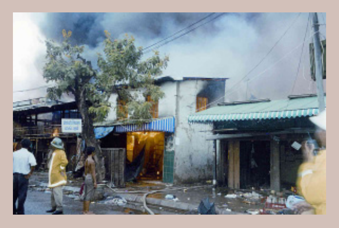
Fires burn in the Building area of the Tonle Bassac squatter community, May 2001.

The scale of the Tonle Bassac fires acted as a catalyst for urban-sector NGOs. The first fire in Bondos Vichea affected 547 families, while the