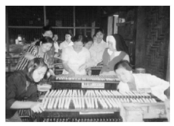
Alam Village women at a candle-making training, Kachin State

Women's Development Programme has in three years accomplished a total of 18 development and skills training courses in such subjects as candlemaking, handicrafts and basic animal husbandry. The projects have been specifically developed for women in the Kachin, Kayah, Kayin, Mon and Shan States as well as the Mandalay and Yangon Divisions. 446 participants have directly benefitted from these training, and nearly all the alumni have formed Savings and Loan groups in their communities to mutually support one another. World Day of Prayer, German Committee