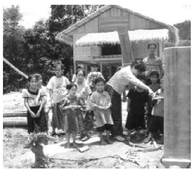
26 households of Htamone Ngwedaung Village, Kayin State now have easy access to clean water

26 wells have been constructed for 1,425 households in nine villages across the Kachin State, one gravity flow system established for 26 households in one village in the Kayin State, and two gravity flow water supply constructions accomplished for 103 households in two villages in the Sagaing Division. John & Nina Cassils, Maryknoll, British Embassy, Yangon