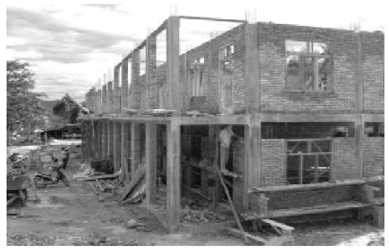
Construction of 2-storey RC Primary & Middle Schools, Laiza, Kachin State

The construction of a durable Primary and Middle School for 650 students of Laiza in the Kachin State is in progress. The 10-room Reinforced Cement Concrete building with steel roof truss is supported by the Embassy of Japan , Yangon .