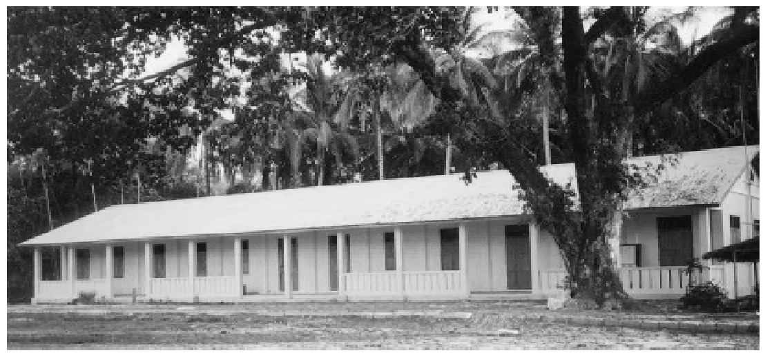
A 30ft x 120ft primary school has been newly-rebuilt in Deedugone Village, Ngapudaw Township, Ayeyarwady Division, while nine schools are newly-reconstructed and eleven schools renovated in the Tsunami-affected area

Metta accomplished emergency relief activities for communities from the December 2004 tsunami affected areas in early 2005. It then commenced reconstruction and community-development activities with the aim to rebuild basic infrastructure in 23 villages. Primarily, Metta focuses on education enhancement projects benefitting 5,494 students. Metta facilitates Preparatory and Need Assessment Workshops, Basic Accounting training and PAR training to enable the respective communities to make their own decisions and initiate their own development programmes In addition, Early Childhood Care and Development activities as well as small-scale community managed projects are to be continued. Novib