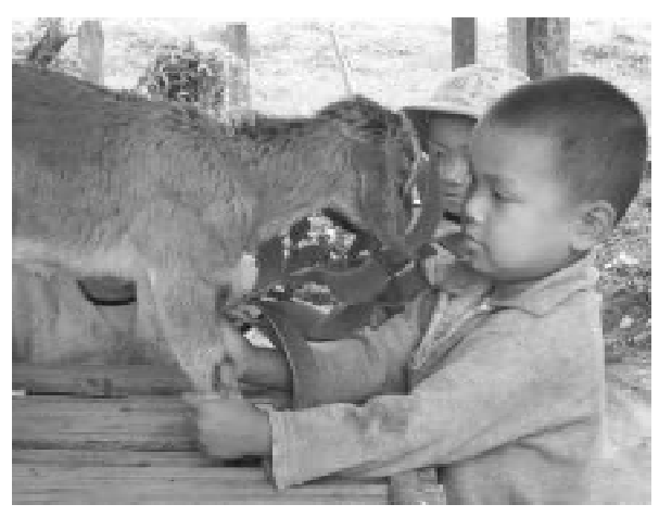
Play is important for child development. Touching and playing with tame domestic animals in pre-school enables children to learn about them as well.

A toy-making workshop has been offered at four strategic locations, enabling the facilitators and committees to make suitable toys from locally available materials. Small-scale income generation activities managed by the local committees are implemented in all 45 villages in order to sustain their ECCD centres. Novib