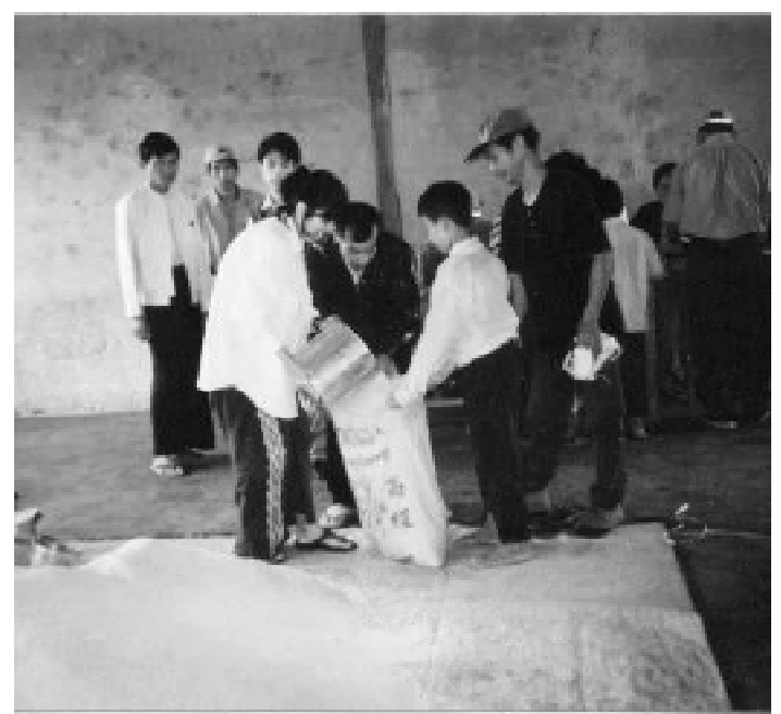
In this project second year, 3,602 metric tons of rice have been distributed to 288 primary schools benefitting 28,537 children besides 4,000 vulnerable persons and 15,000 villagers who have taken part in food-for-work (FFW) activities.