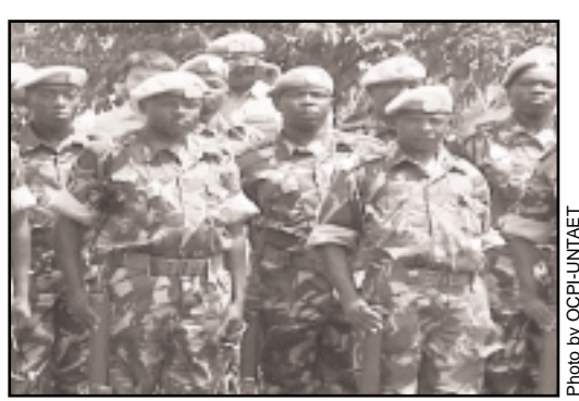
Kenyan troops with the United Nations Peacekeeping Force (UN-PKF) have also been providing medical care and taking on engineering projects such as repairing the road from Dili to Aileu.