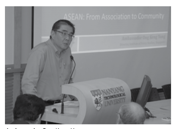
Ambassador Ong Keng Yong

Ambassador Ong highlighted the progress of ASEAN since its inception in 1967. From the original five founding members: Indonesia, Malaysia, Philippines, Singapore and Thailand; ASEAN today embraces 10 member states, with the addition of Brunei, Viet Nam, Laos, Myanmar and Cambodia. He noted that having an ASEAN that encompassed all Southeast Asian nations not only allowed the region to have a greater voice and weight collectively, it also delivered a greater synergy in economic, political, and socio-cultural development across the region. At the same time, the key challenge that remained was how best and how quickly ASEAN could narrow the development gap among its member states.