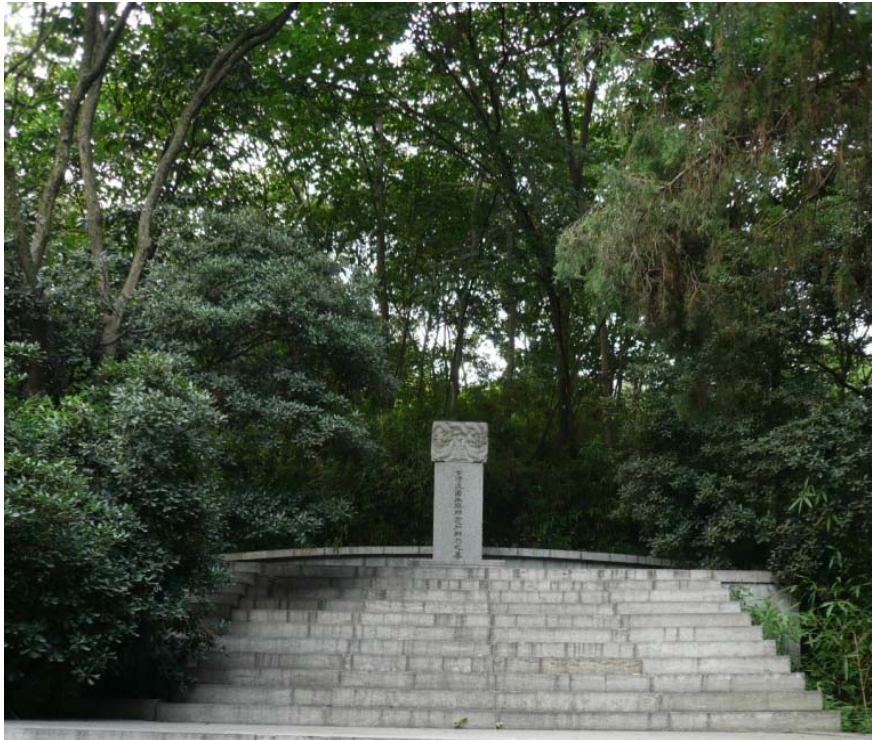
Figure 2: Brunei-China Friendship Park in Nanjing, China Stele in front of the tumulus