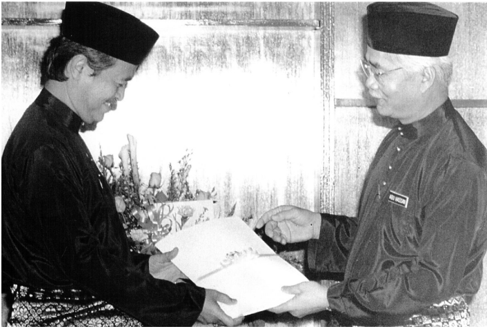
Handing over of duties by Datuk (later Tan Sri) Haji Abu Hassan bin Haji Omar (right) to Datuk Abdullah Haji Ahmad Badawi (left) who took over the portfolio of Foreign Minister from 15 March 1991.