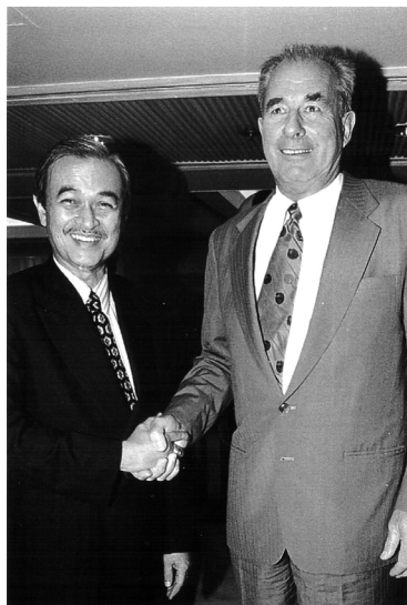
Abdullah and Mr. Don McKinnon (New Zealand counterpart) after a meeting in Kuala Lumpur on 26 October 1998.