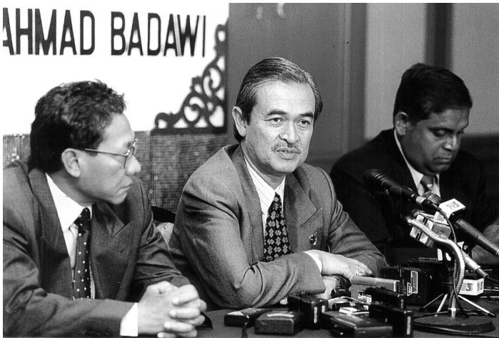
Abdullah giving his briefing on the Foreign Minister's level meeting for the upcoming G-15 Summit on 2 November 1997.