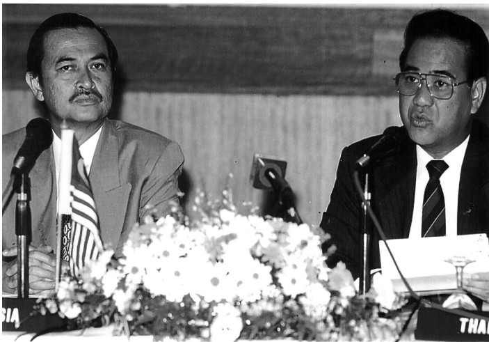
Foreign Minister Abdullah and Thailand's new Foreign Minister, Arsa Sarasin, in Pulau Langkawi for the first Malaysia-Thailand Joint Commission meeting on 16-17 February 1992.