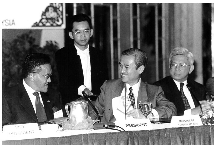
Foreign Minister, Abdullah Ahmad Badawi (centre) greeting Mr Aburizal Bakrie, a prominent Indonesian businessman (left), while Mr Rodolfo Severino, the ASEAN Secretary-General (right), looks on at the official opening of the ASEAN-CCI Conference in Kuala Lumpur on 9 April 1998.