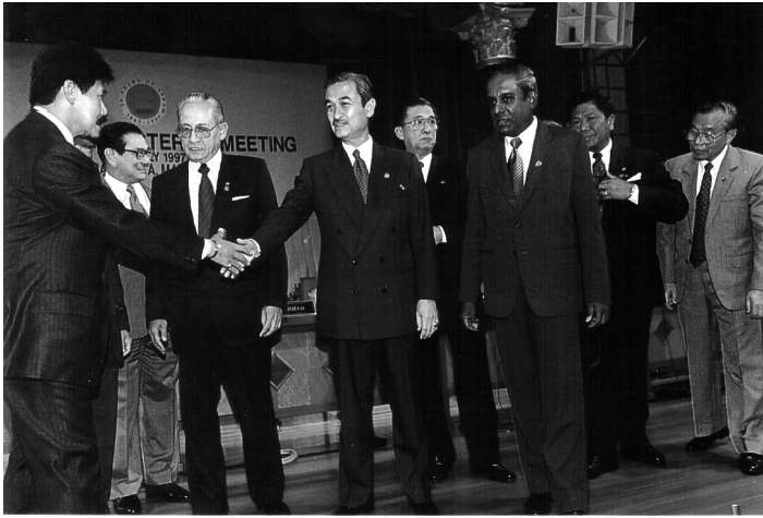
Abdullah at an informal meeting of ASEAN Foreign Ministers in New York on 3 October 1997.