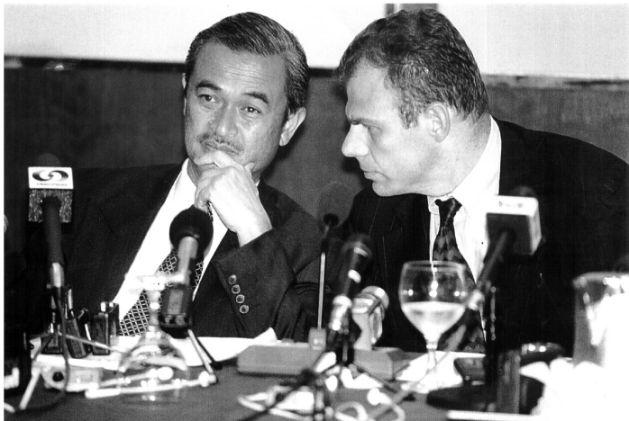
Abdullah listening to points conveyed by Muhamed Sacirbey, Foreign Minister of Bosnia, at the Organization of Islamic Conference special meeting in Kuala Lumpur.