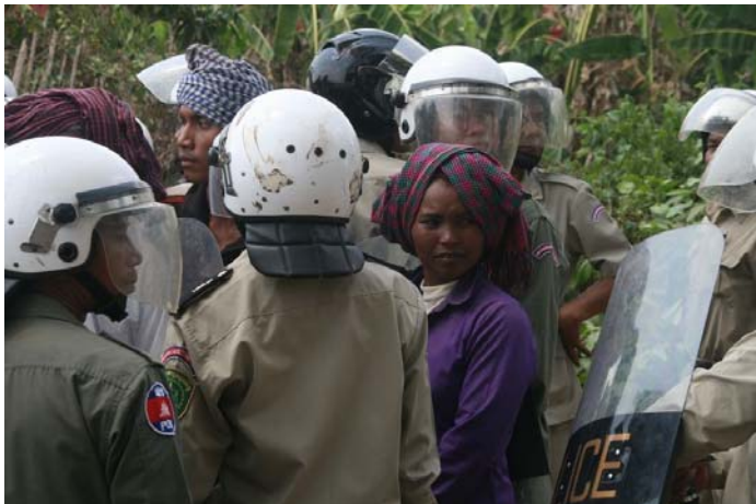
A woman stands among police officers attempting to stop Amleang villagers from reaching the court in Kampong Speu.

After the hearing the public prosecutor told them Senator Ly Yong Phat was too powerful to resist, because "half of the country owes him favors".