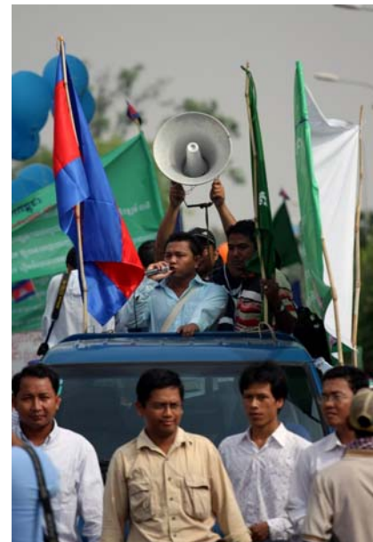
Workers march through Phnom Penh on May 1, 2010.

Furthermore, the restriction of protests on the sites of land evictions has increasingly led to violence. The inability of people to protect the areas where they have been living – sometimes for decades – often results in confrontational standoffs as they attempt to avoid eviction and relocation. These clashes with local authorities, police and military can lead to arrests, injury and death as they quickly become violent.